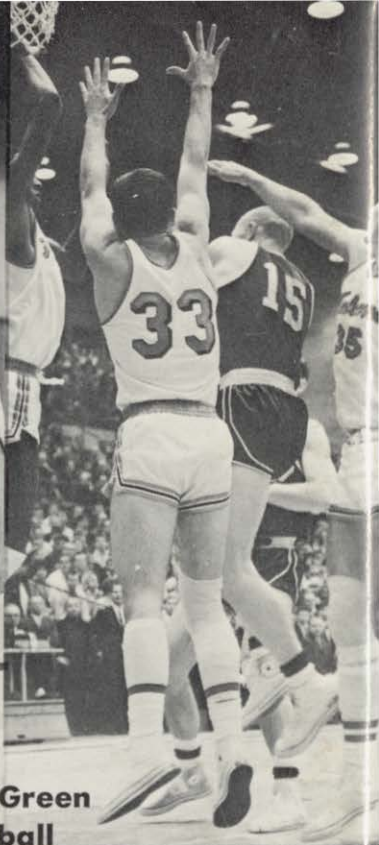
Bowling Green Basketball