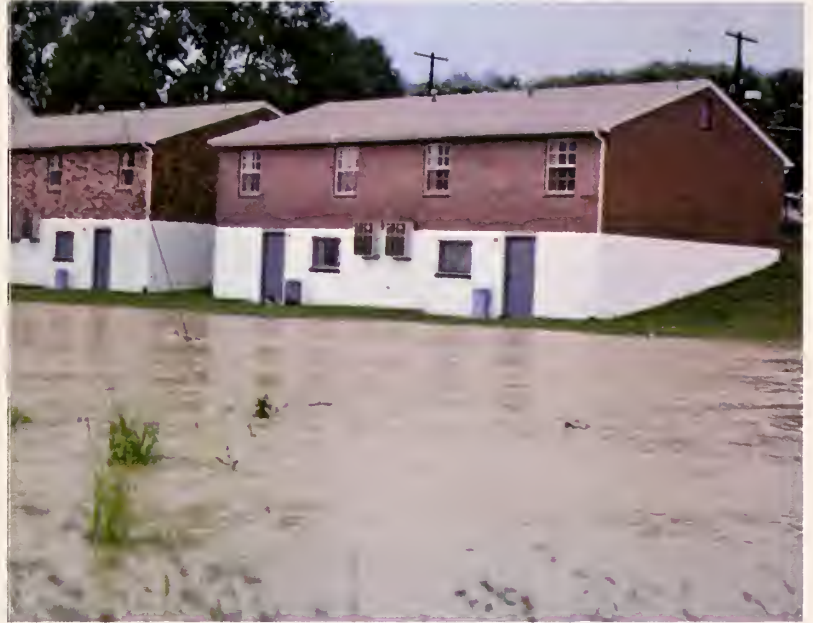
Flooding and other hazards that affect buildings are indicated in soil surveys.

Soils may be seasonally wet or subject to flooding. They may be shallow to bedrock. They may be too unstable to be used as a foundation for buildings or roads. Very clayey or wet soils are poorly suited to septic tank