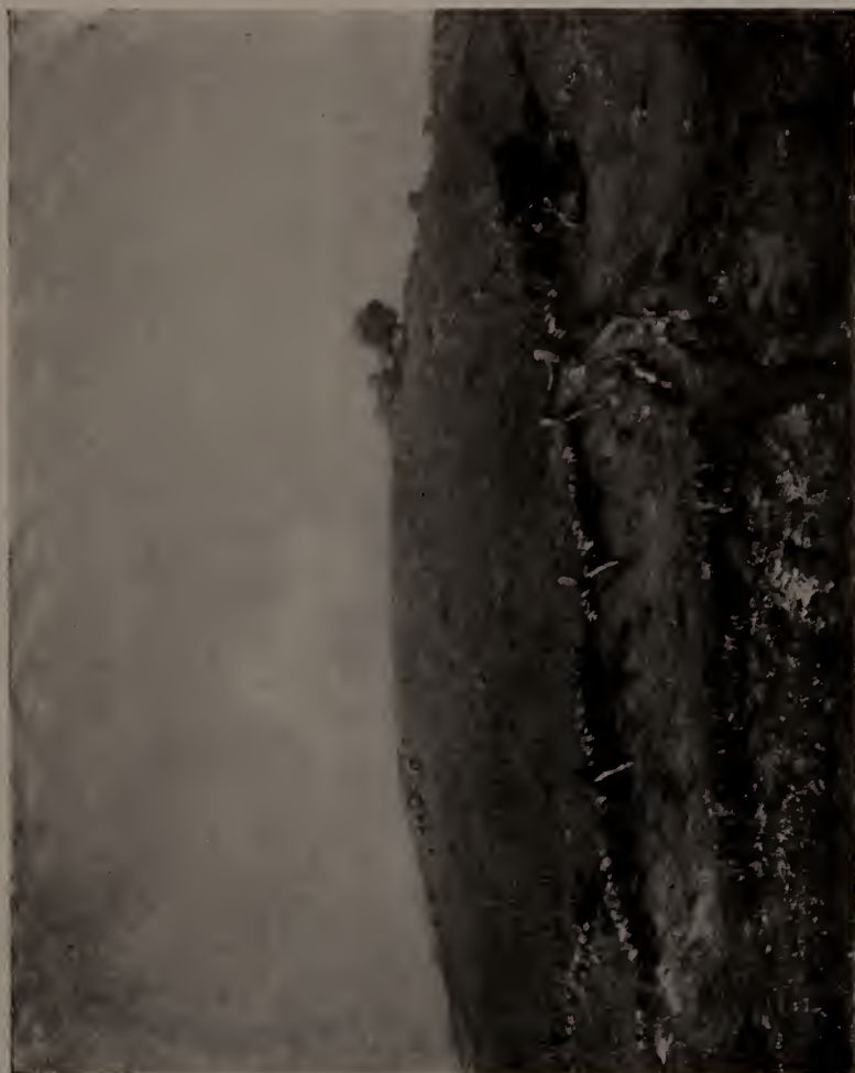
No. 74—CLOUDLAND AND PASTURE