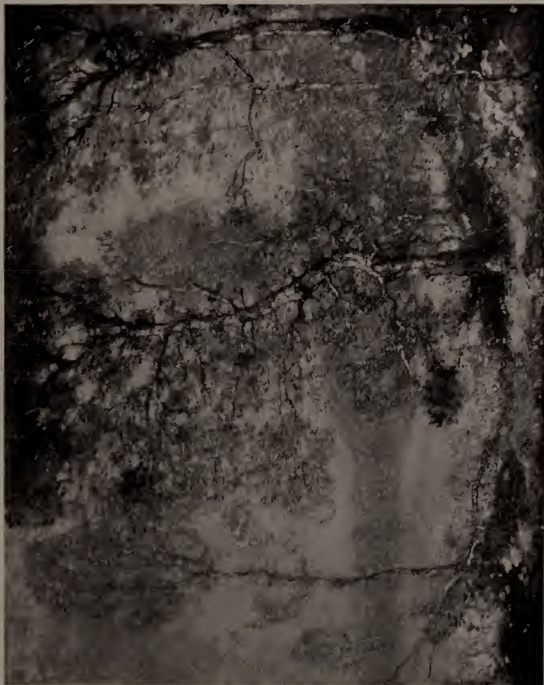
No. 149—MISTY AFTERNOON, RATHBURN POND