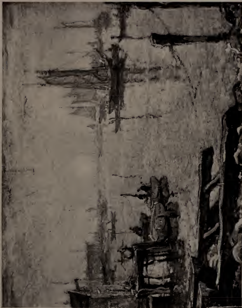
No. 162—SUNRISE AT NOANK