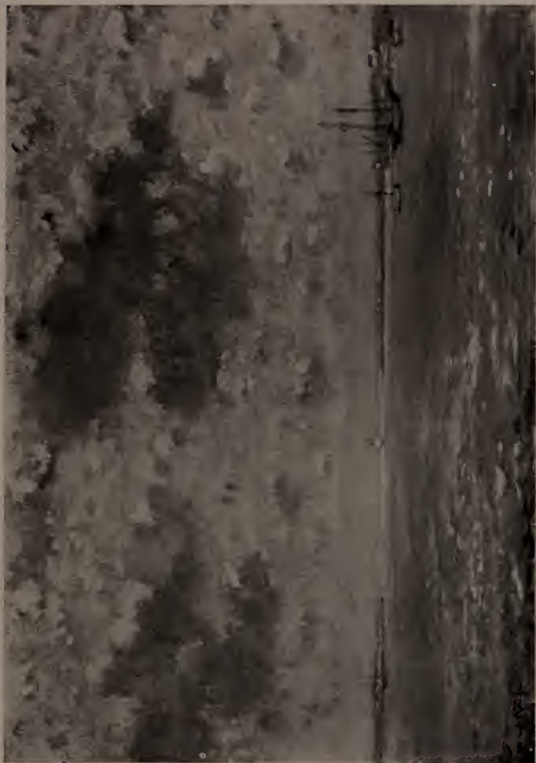
No. 131—A GOOD HARBOR