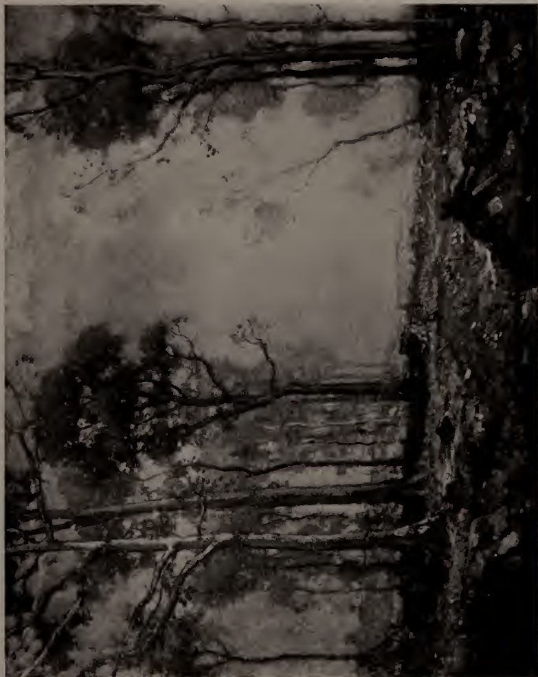
No. 59—THE SWAMP PASTURE