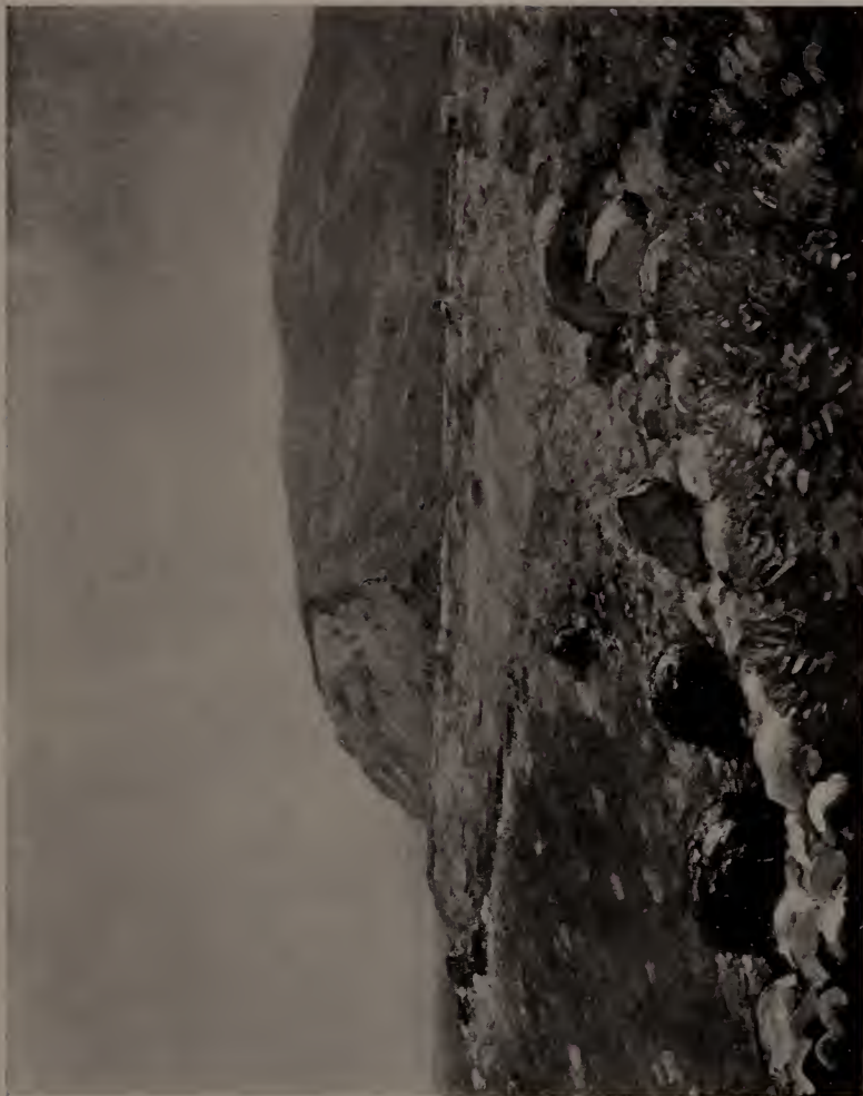
No. 72—STONY COVE AND HEADLAND