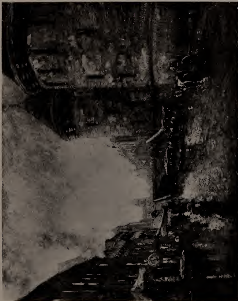
No. 68—THE ARMORY