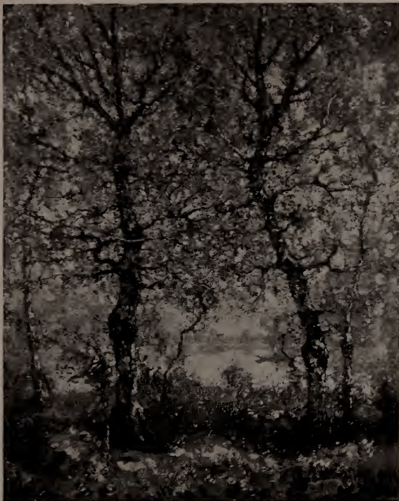
No. 151—TWIN TREES