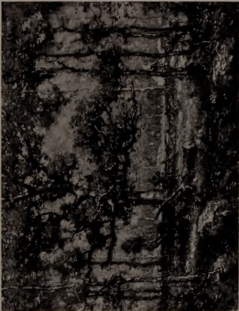
No. 83—AUTUMN, MASON'S ISLAND