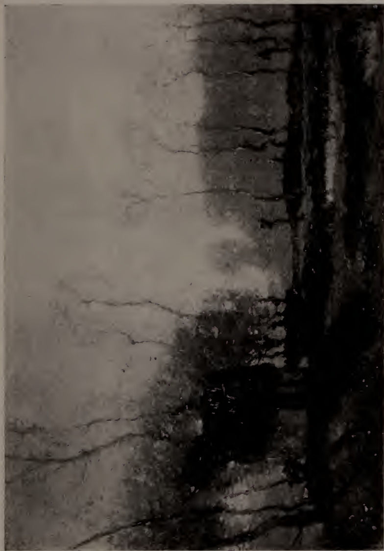
No. 51—SPRING LANDSCAPE