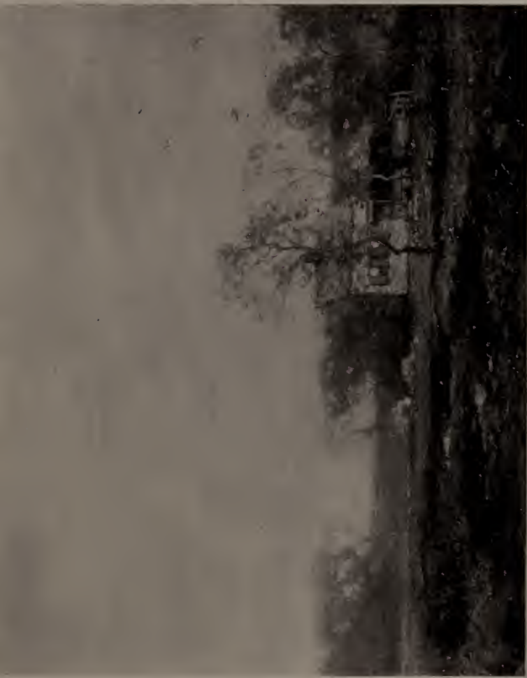
No. 147—OCTOBER LANDSCAPE