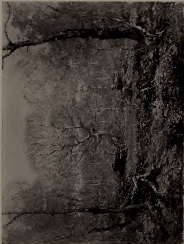
No. 143—THE WOOD LOT