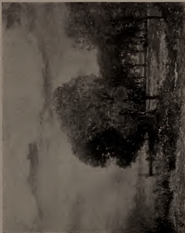
No. 153—HEAVY CLOUDS