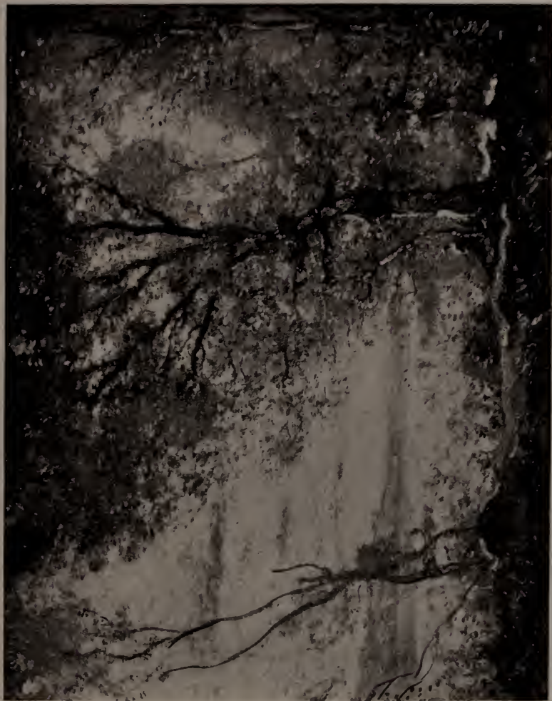
No. 161—SUNSET ON THE MYSTIC RIVER, CONN.