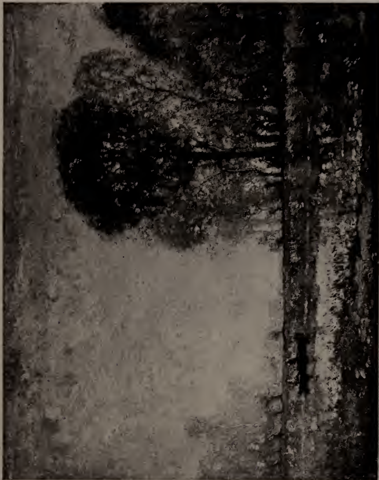
No. 61—SUNSET—RED AND GOLD