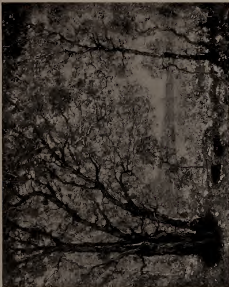
No. 159—LONG POND