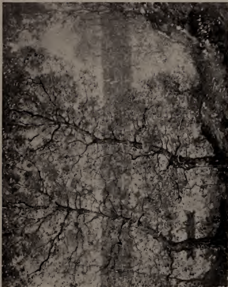
No. 145—THROUGH THE TREES