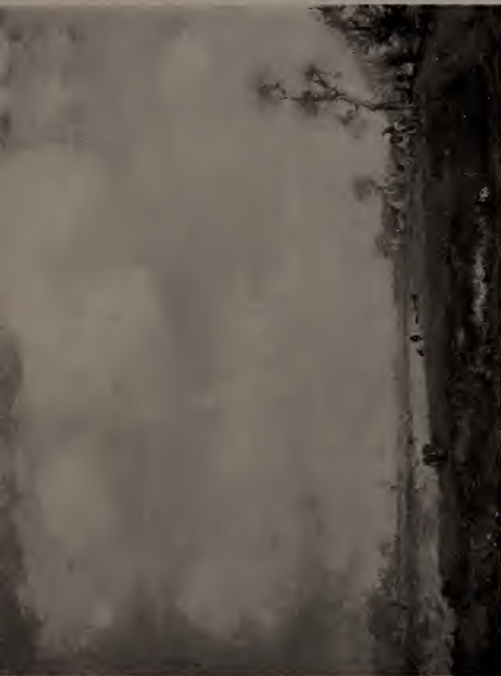
No. 163—LONG POINT MARSH