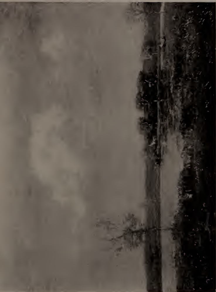
No. 157—SALT MEADOWS