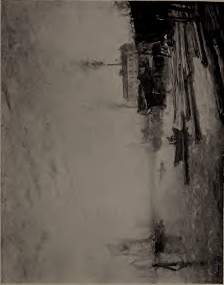
No. 134—NOANK, CONNECTICUT