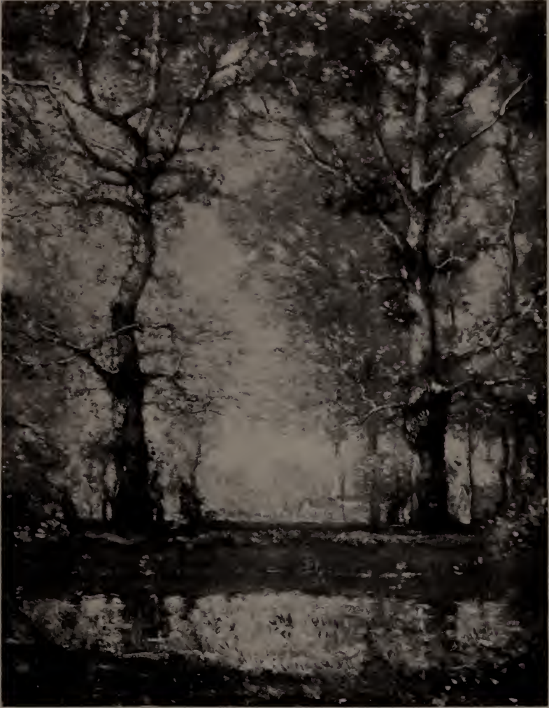
No. 141—THE EDGE OF THE VILLAGE