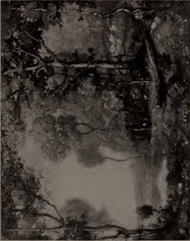
No. 135.—THE ARCHED TREES