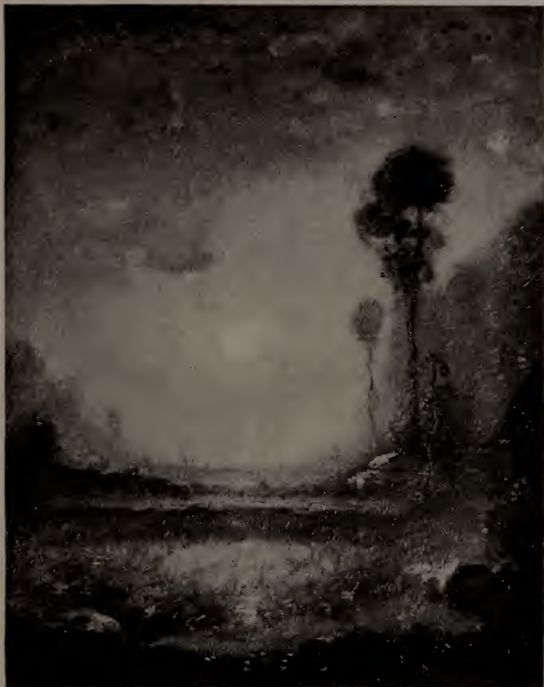
No. 156—MOONLIGHT AND STARSHINE