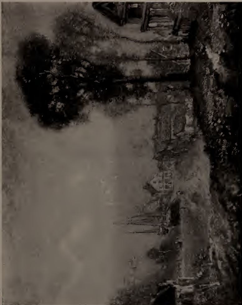
No. 164—ACROSS THE SOUND