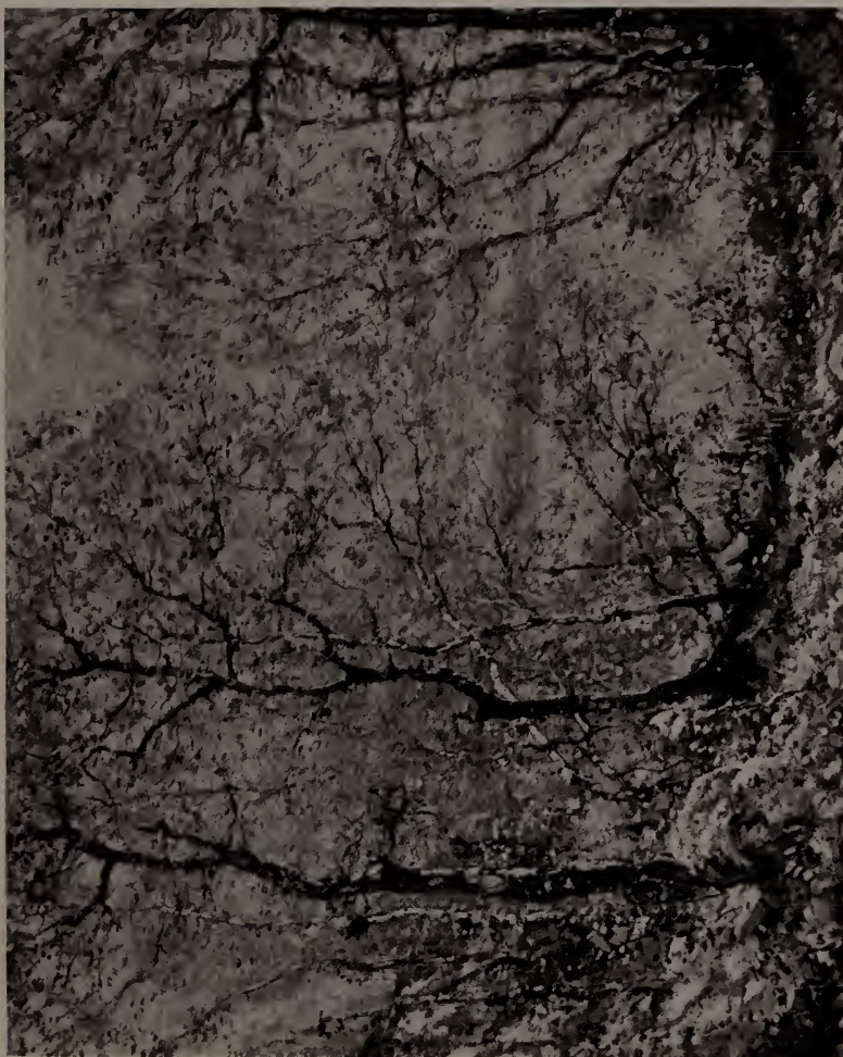
No. 139—EARLY SPRING