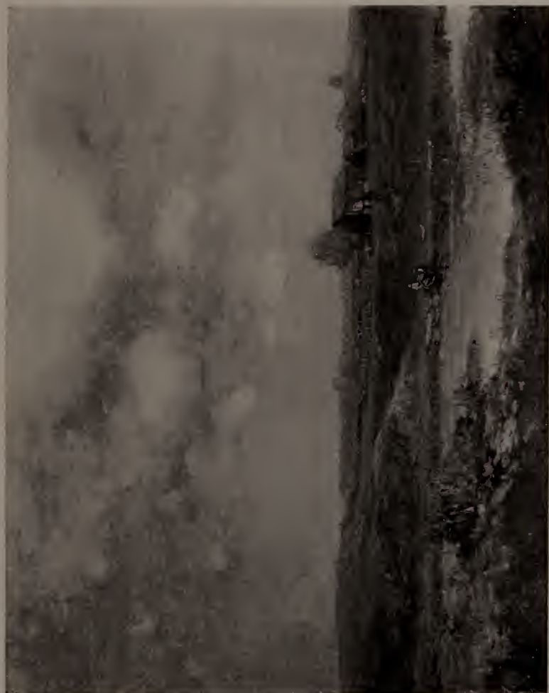
No. 155—THE BARN