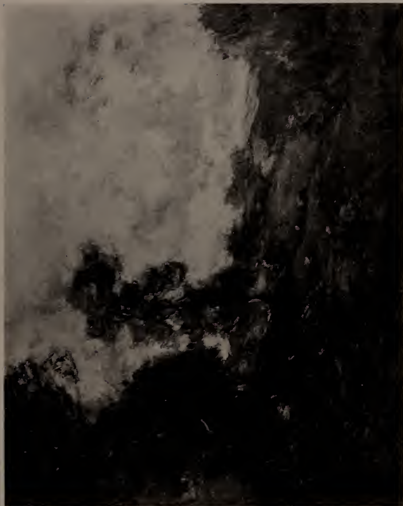
No. 99—AUTUMN SUNLIGHT