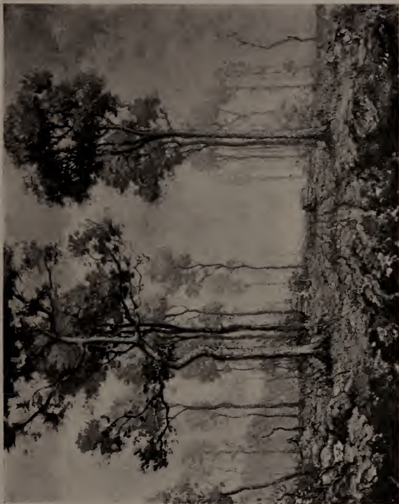
No. 79—THE OUTSKIRTS OF THE WOODS