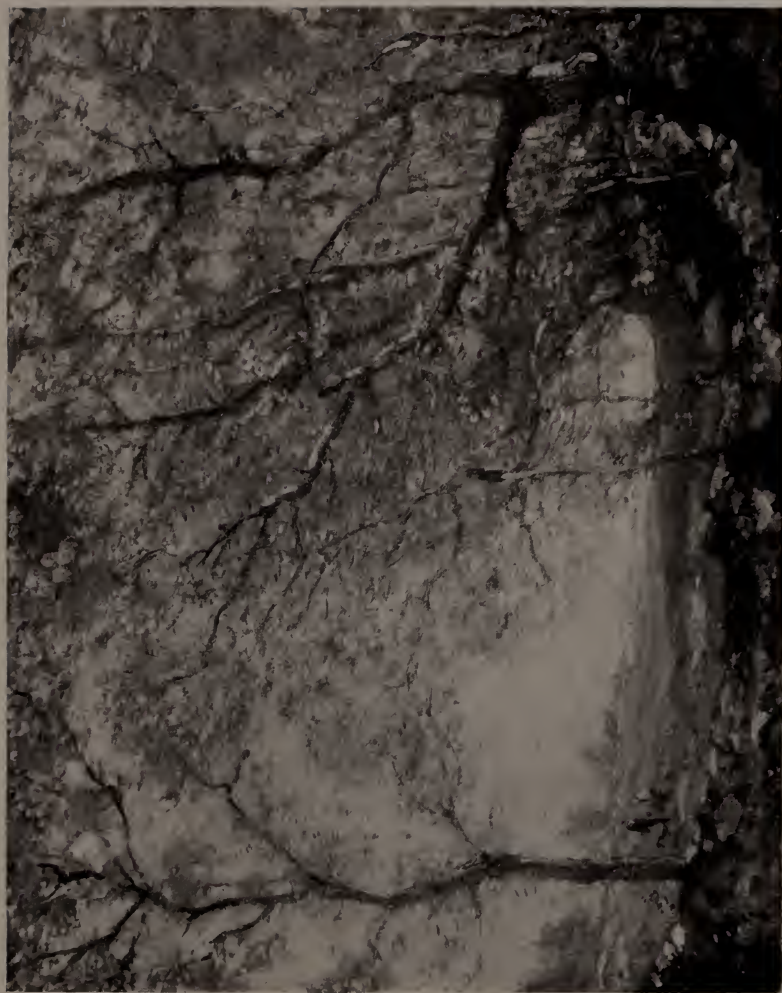
No. 137—TREES AND MEADOW