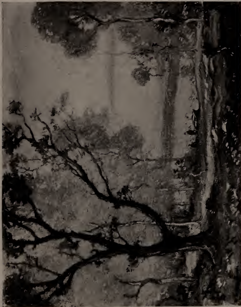
No. 77—A VIEW OF THE SOUND