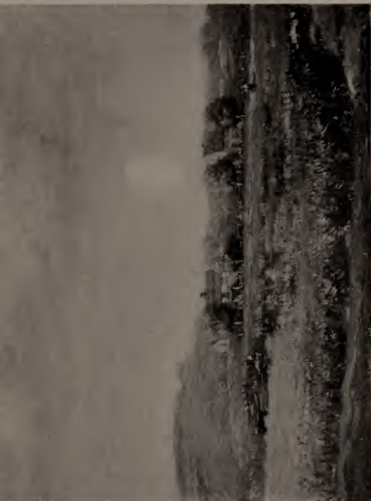
No. 63—OLD NEW ENGLAND HOUSES