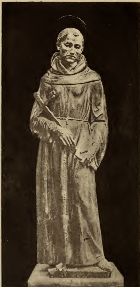
Statue of St. Francis By Andrea della Robbia, at S. Maria degli Angeli, Assisi.