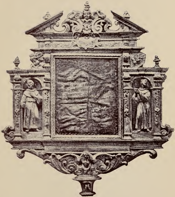
AUTOGRAPH BLESSING GIVEN BY ST. FRANCIS TO BROTHER LEO, PRESERVED IN THE SACRO CONVENTO AT ASSISI. (See page 146.)