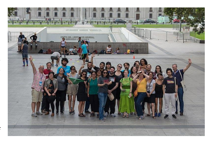
Carlos Figueroa, CC-BY-SA 4.0 (see on Wikimedia Commons)

The conference discussed the present and future of Iberocoop as a regional organization, the internal competencies of the affiliates to reach the various adjacent communities, and the projection of Iberocoop as an initiative.