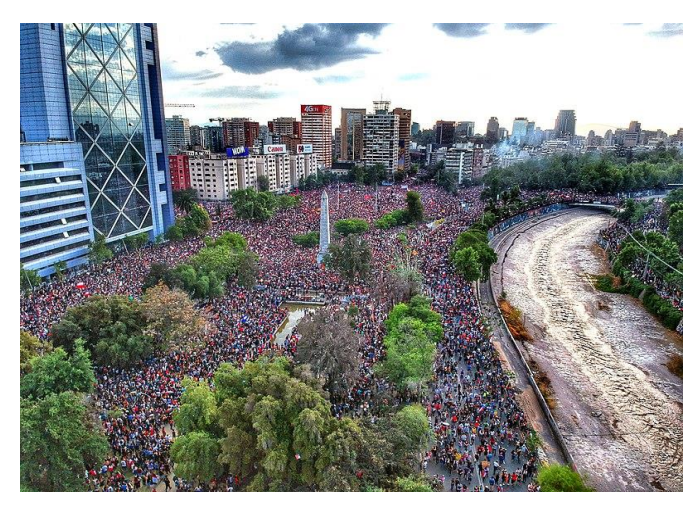
Hugo Morales, CC-BY-SA 4.0 (see on Wikimedia Commons)

The images obtained under this campaign have served to illustrate not only the different Wikipedia articles