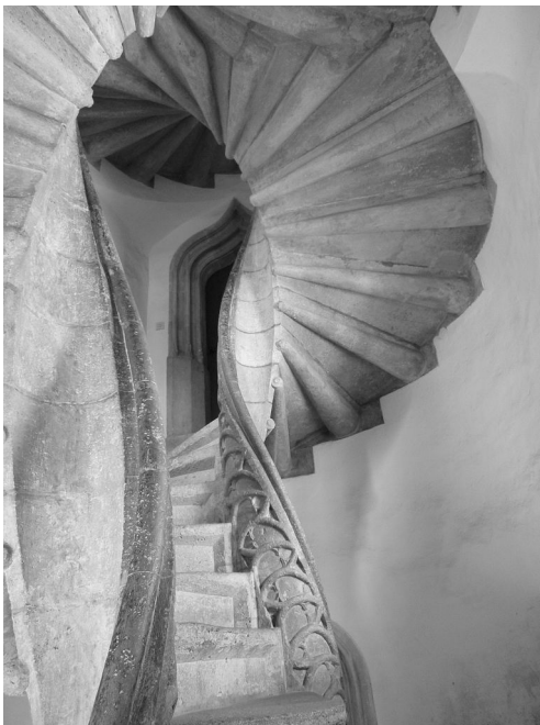
Photographer: E.mil.mil Location: Styria, Austria http://commons.wikimedia.org/wiki/File:Doppel wendeltreppe, Grazer Burg P1010587.JPG