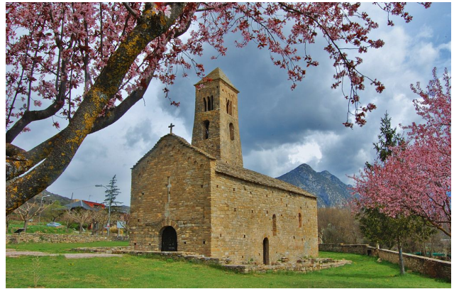
Photographer: MARIA ROSA FERRE Location: Coll de Nargó, Spain http://commons.wikimedia.org/wiki/File:Església de Sant Climent (Coll de Nargó) - 1.jpg