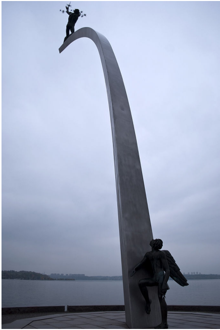
Photographer: Evunji Location: Stockholm, Sweden http://commons.wikimedia.org/wiki/File:Gud Fader på Himmelsbågen 02.jpg