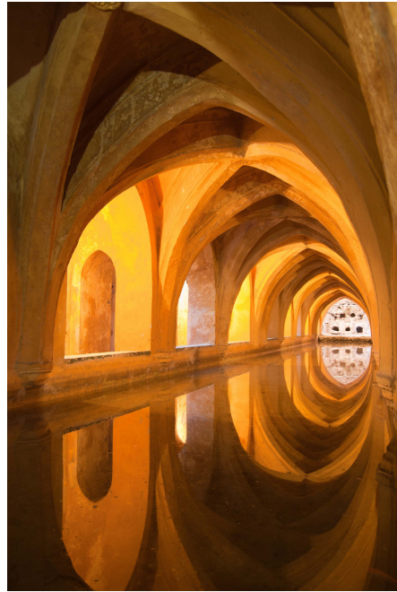
Photographer: ivan m v Location: Sevilla, Spain http://commons.wikimedia.org/wiki/File:Baños de Doña María de Padilla.jpg