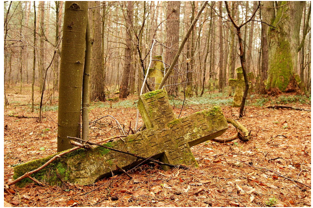
Location: Podemsczyzna, Poland