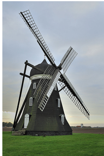
Photographer: Rolf Hellman Location: Trelleborg, Sweden http://commons.wikimedia.org/wiki/File:Skegrie mölla 03.jpg