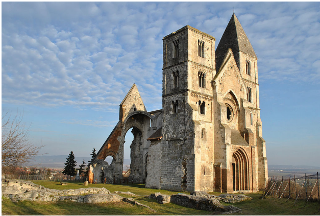
Photographer: Puffancs Location: Zsámbék, Hungary http://commons.wikimedia.org/wiki/File:Premonstri_prepostsági_templom_romja_(7623._számú_műemlék).jpg