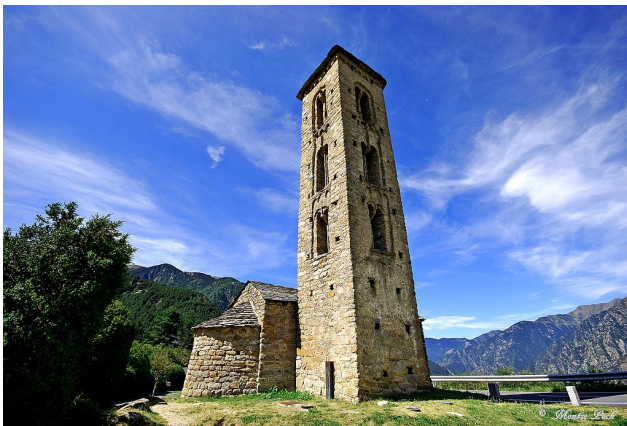
Photographer: Montse Poch Location: Escaldes-Engordany, Andorra http://commons.wikimedia.org/wiki/File:Església de Sant Miquel d'Engolasters - 6.jpg