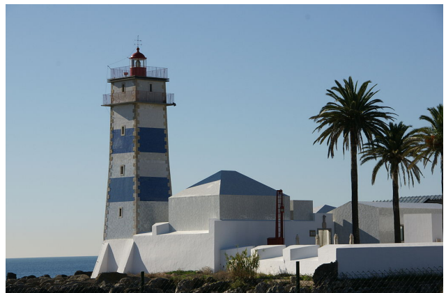
Location: Cascais, Portugal