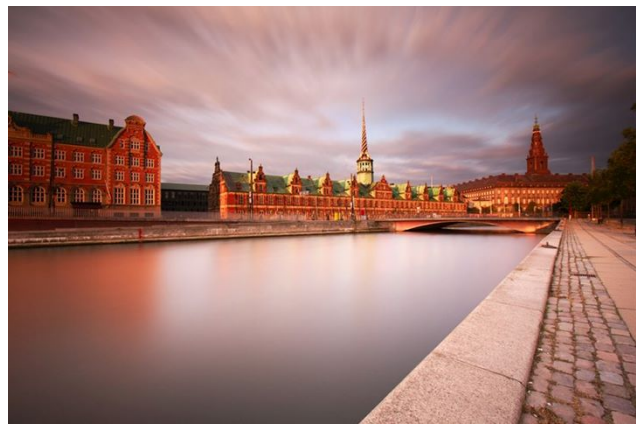
Location: Copenhagen, Denmark