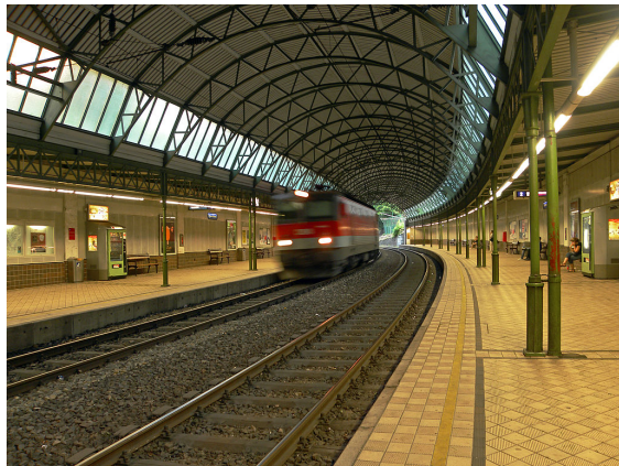
Location: Oberdöbling, Austria