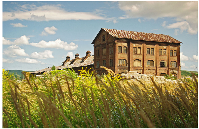
Photographer: diemehrdimensionale Location: Ózd, Hungary http://commons.wikimedia.org/wiki/File:Fúvógé pház (11688. számú műemlék) 2.jpg