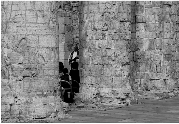
Photographer: Heidenstrom Location: Hamar, Norway http://commons.wikimedia.org/wiki/File:I_Hamar-kaupangen_Domkirkeodden.jpg