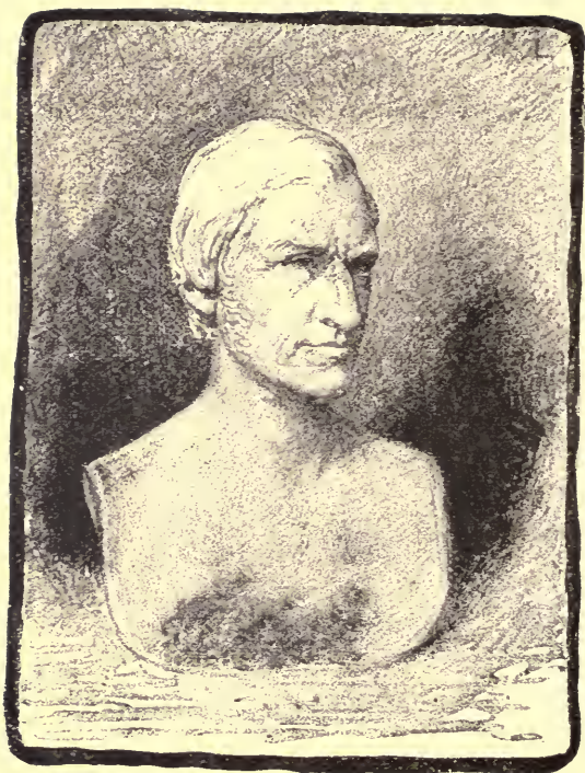
RALPH WALDO EMERSON. — From the bust by Milmore.