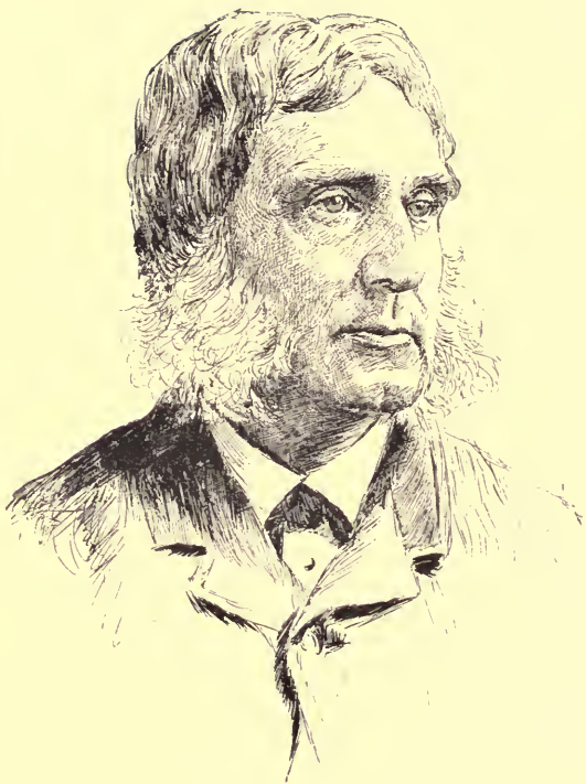
GEORGE WILLIAM CURTIS.