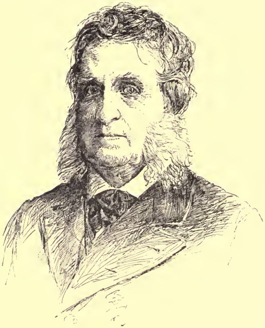
DONALD GRANT MITCHELL.