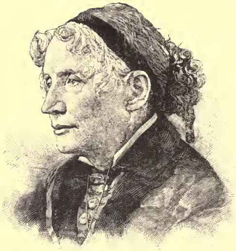
HARRIET BEECHER STOWE.