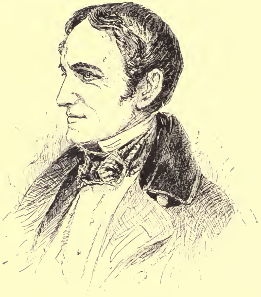
WILLIAM H. PRESCOTT.