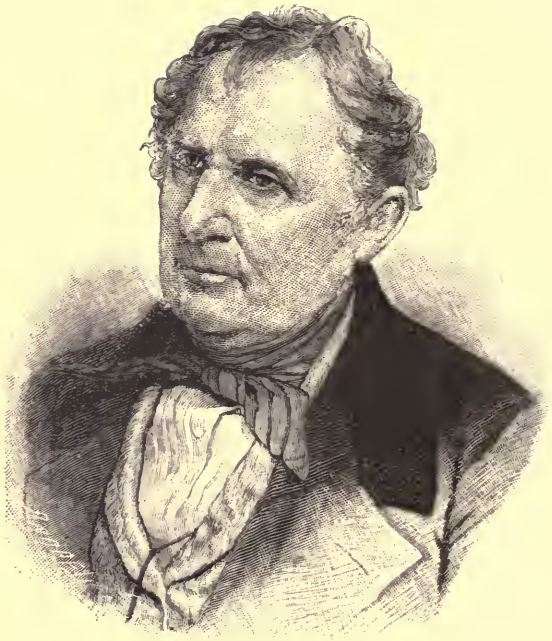
J. Fenimore Cooper