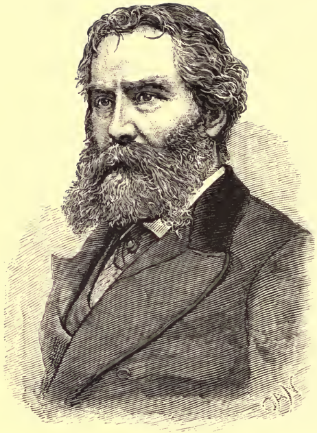
JAMES RUSSELL LOWELL.