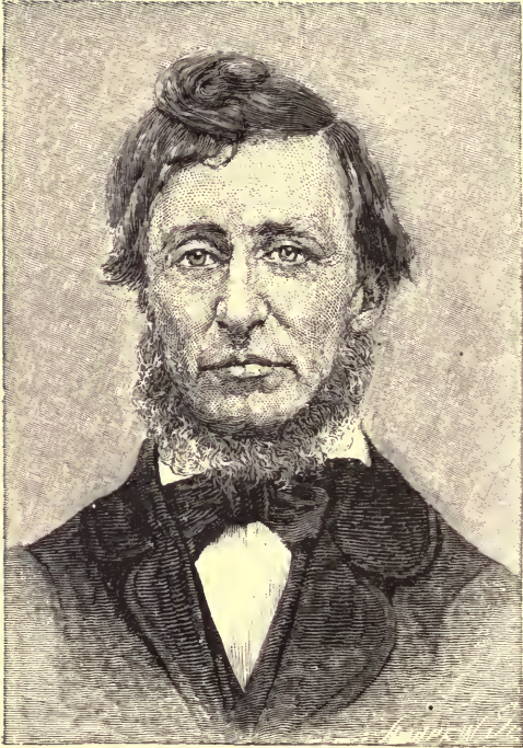
HENRY DAVID THOREAU.