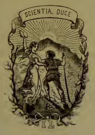
PARIS Isidore LISEUX, 2, Rue Bonaparte. 1879

Published from the original Latin manuscript discovered in London in the year 1872, and translated into French by ISIDORE LISEUX Now first translated into English With the Latin Text.