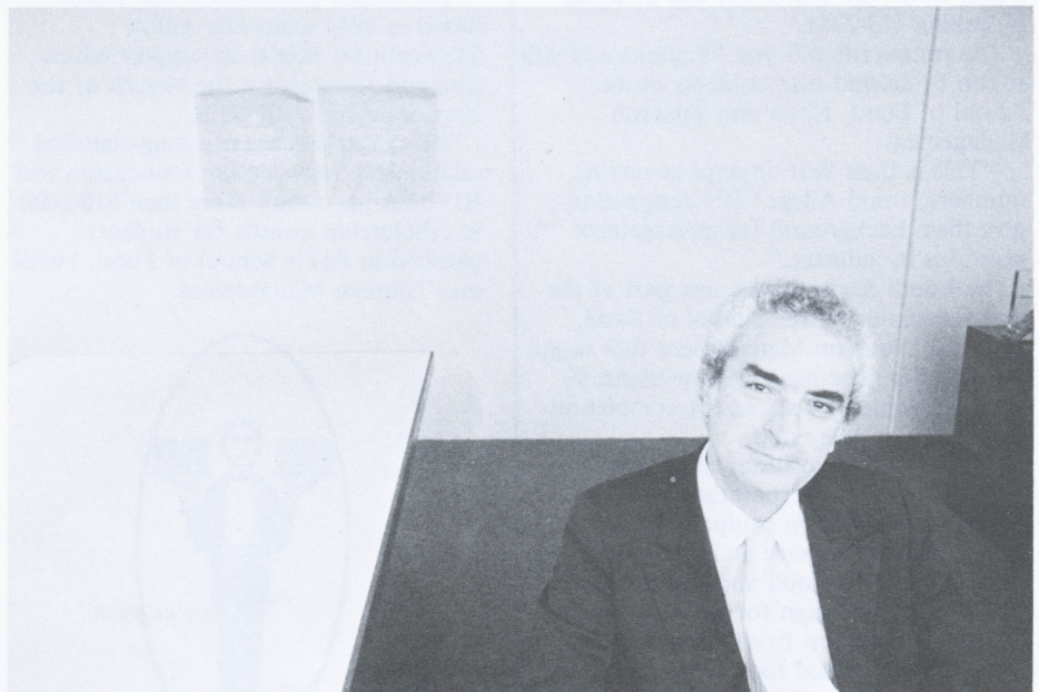
Massimo Vignelli