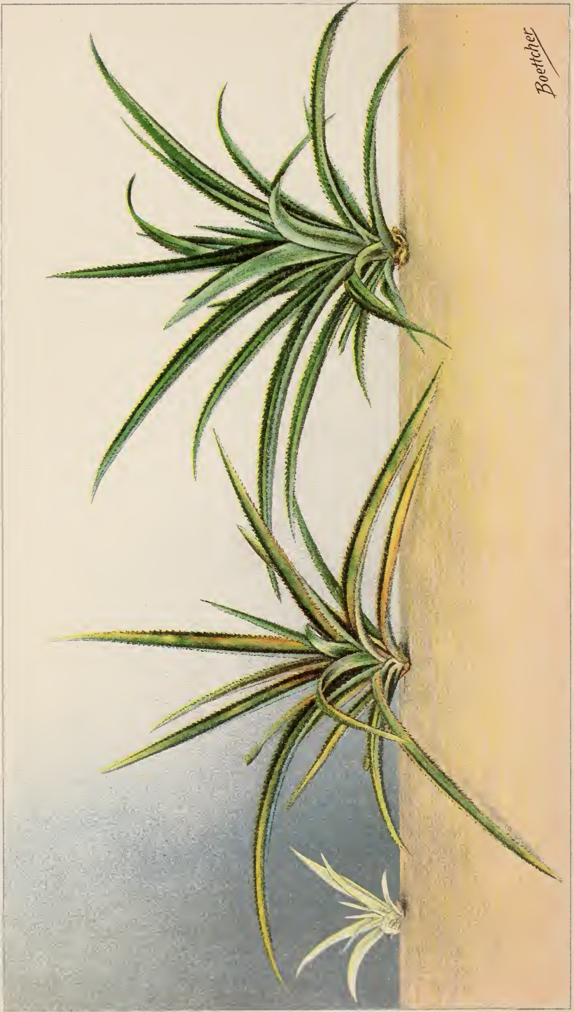
TWO STAGES OF CHLOROSIS AND NORMAL GREEN PLANT.