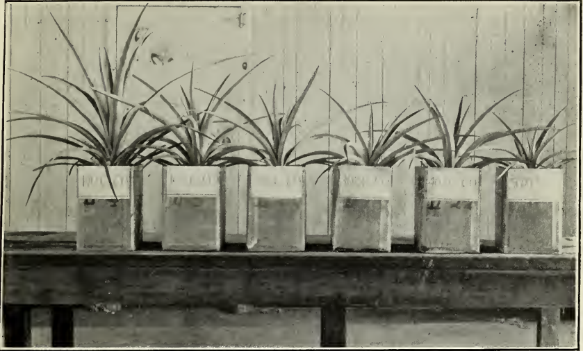
FIG. 1.—EFFECT OF CARBONATE OF LIME ON THE GROWTH OF PINEAPPLES.