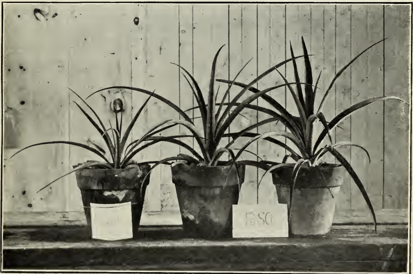
FIG. 2.—EFFECT OF FERROUS SULPHATE ON CHLOROTIC PINEAPPLE PLANTS.