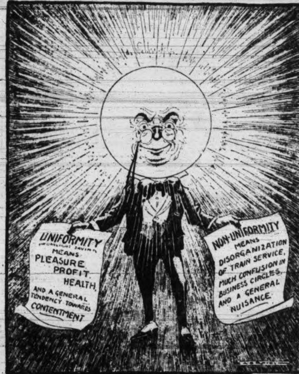
Old Sal:—Why Not Let Wadon Make You Choose?