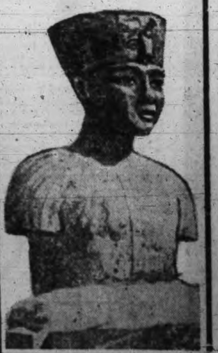
On the right is a statue taken a few weeks ago from Tutankhamen's tomb, and it has archaeologists guessing. Some say it is a curved bust of Tutankhamen's wife, while others claim it is what would be called today a tailor's dummy—formerly used for fashioning the royal robes.