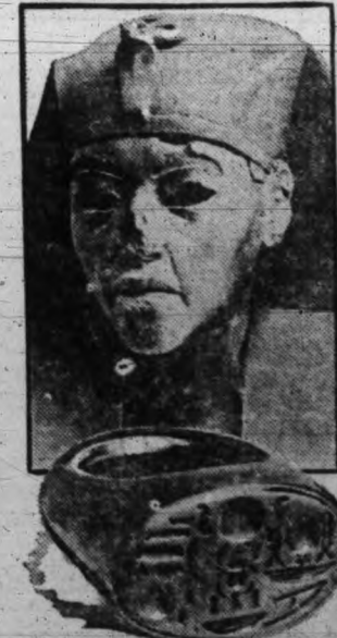
Above is a statue of Queen Hefertiti, wife of Akhenaten "the heretic King" who preceded Tutankhamen. She was Tutankhamen's mother-in-law. The original is in the Berlin museum. On the left is his father-in-law. The original is in stone in the Metropolitan Museum, New York. Below is Tutankhamen's signet ring.