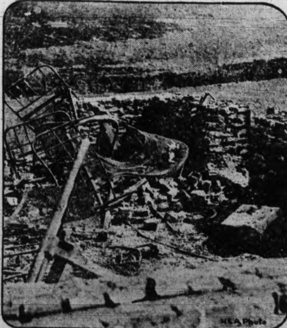
Seven aged women, inmates of the Allegheny County Almshouse at Angelica, N. Y., were burned to death when flames swept the structure in a mysterious midnight fire. Two attendants lost their lives attempting to rescue trapped victims. Above are shown the ruins of the women's dormitory where six women perished.