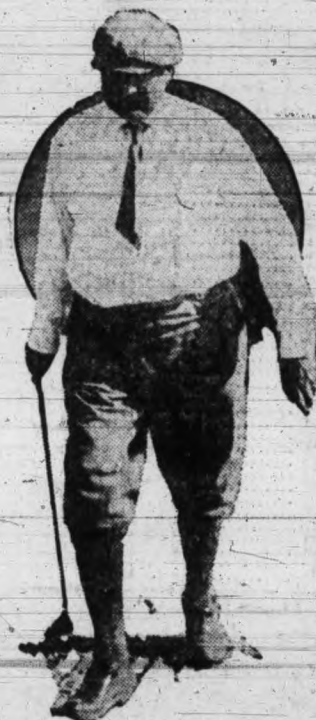
The president is shown going over the Fort Lauderdale golf course at Palm Beach, Fla.