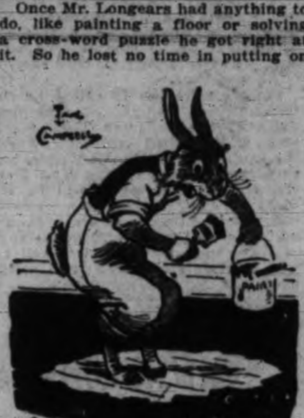
All about him was wet, sticky paint.

"It certainly is terrible! That's what it is! Just terrible!" Nurse Jane was speaking thus, and Uncle Wiggly, who was reading the morning paper as he sat in his easy chair, heard her.