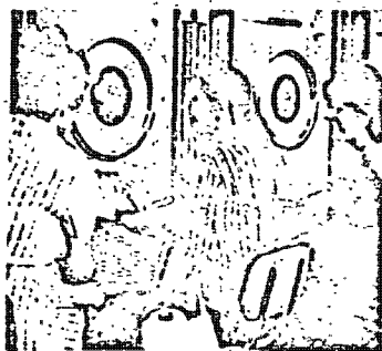
... and gossip at the Laundromat