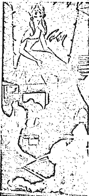
... lingerie at GUM...