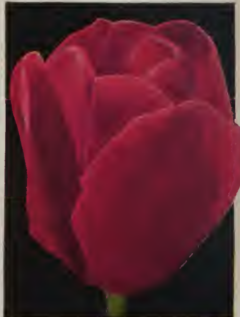
Ideal Darwin Tulip Margaux Page 8.