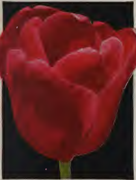
Ideal Darwin Tulip Tollens Page 9.