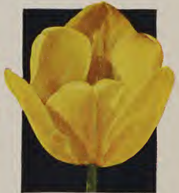
Darwin Tulip Yellow Giant Page 13.