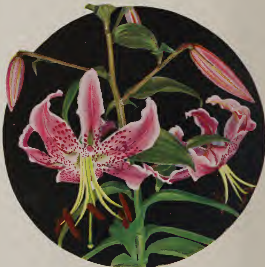
Lilium Speciosum Magnificum See page 48.