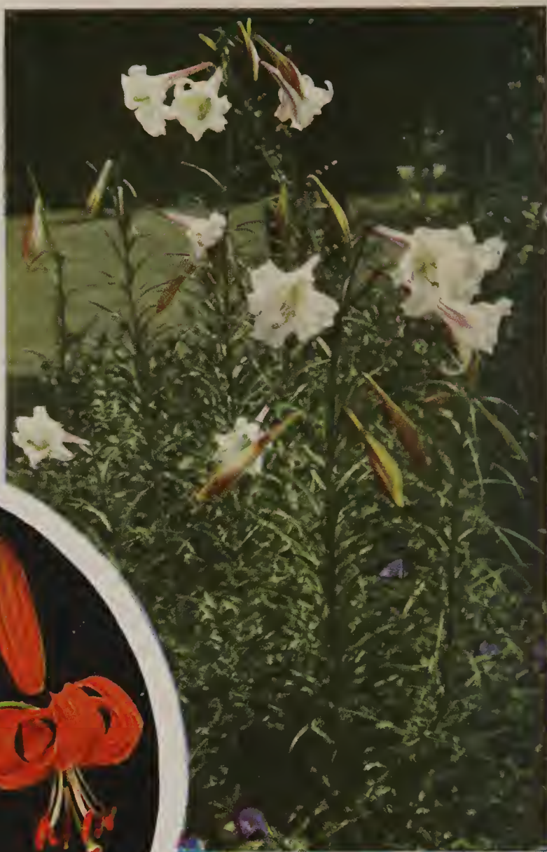
Lilium Philippinense Formosanum See page 48.