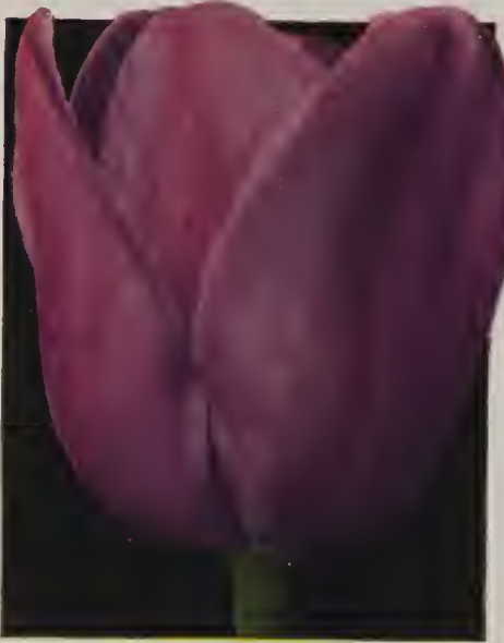
Ideal Darwin Tulip Tokay Page 9.