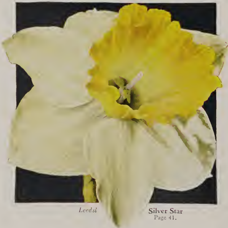
Leedsii Silver Star Page 41.