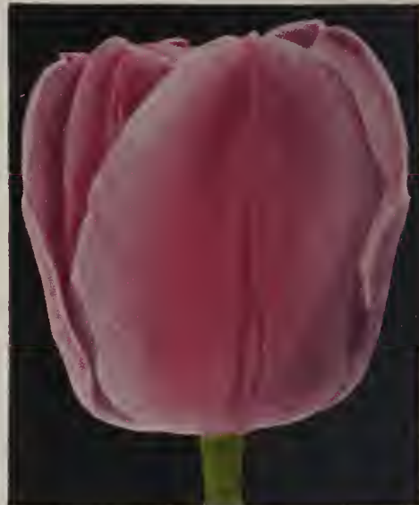
Ideal Darwin Tulip Benjamin Franklin Page 7.