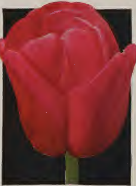
Ideal Darwin Tulip Gloria Swanson Page 7.