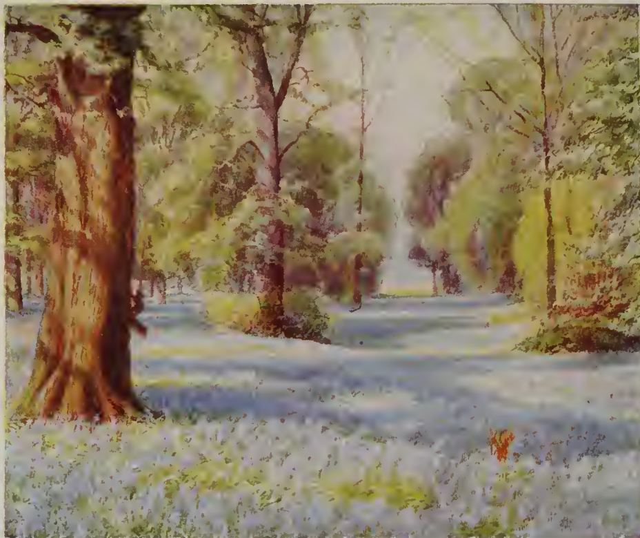
Scilla Nutans —English Blue Bells Naturalized in Woods See page 59.