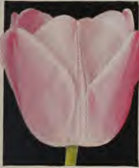
Ideal Darwin Tulip Mermaid Page 8.