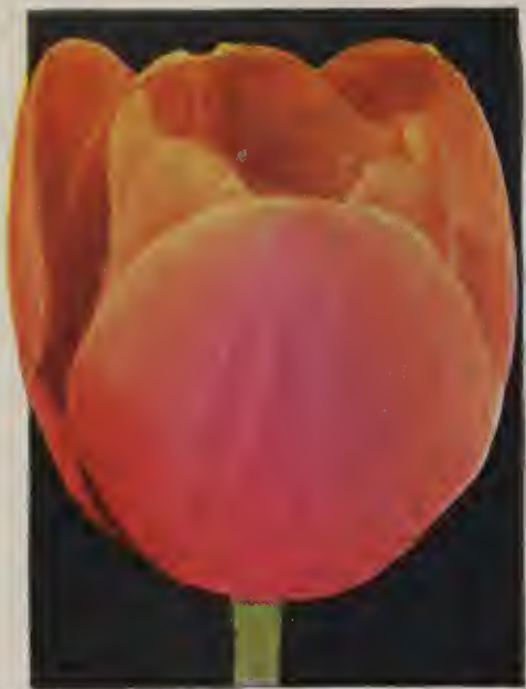
Breeder Tulip Sundance Page 15.