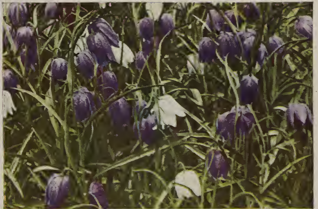
Fritillaria Meleagris See page 57.