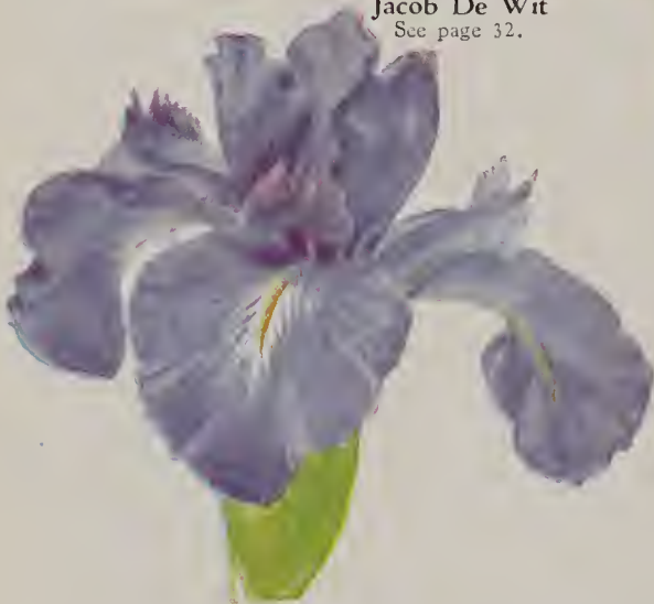
English Iris See page 32.