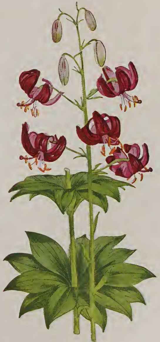
Lilium Martagon See page 47.