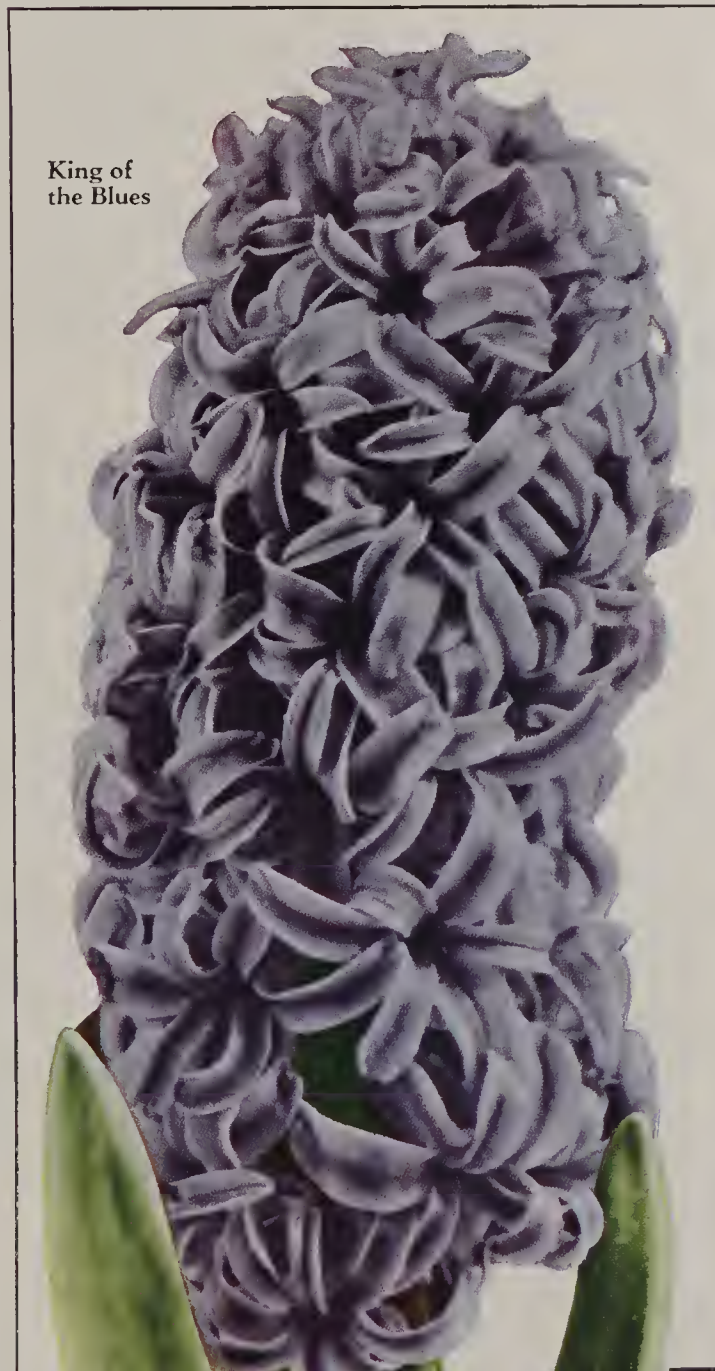
King of the Blues