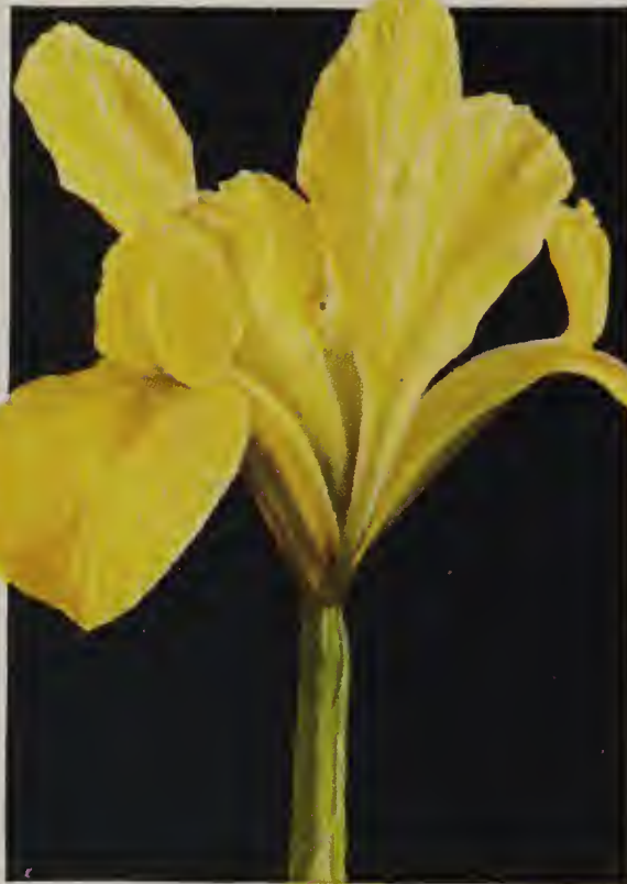
Dutch Iris Yellow Queen See page 32.