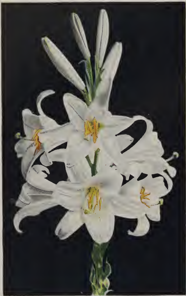
Lilium Candidum See page 46.