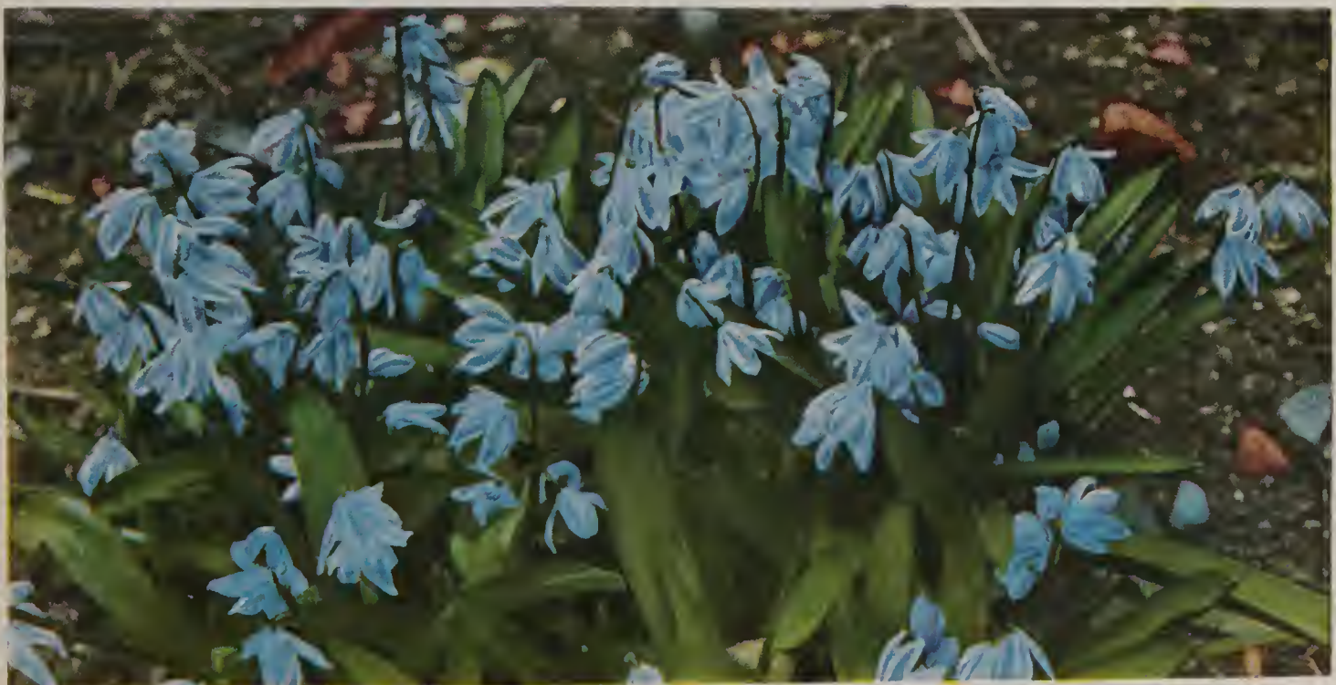
Scilla Sibirica See page 60.