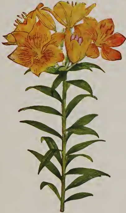
Lilium Batemanniae See page 47.