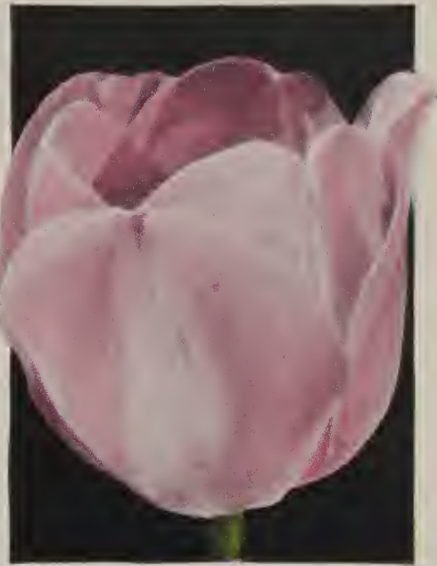
Ideal Darwin Tulip Insurpassable Page 8.