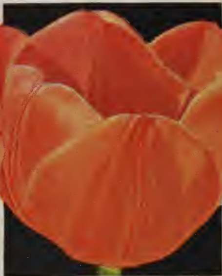
Breeder Tulip Golden Goblet Page 14.