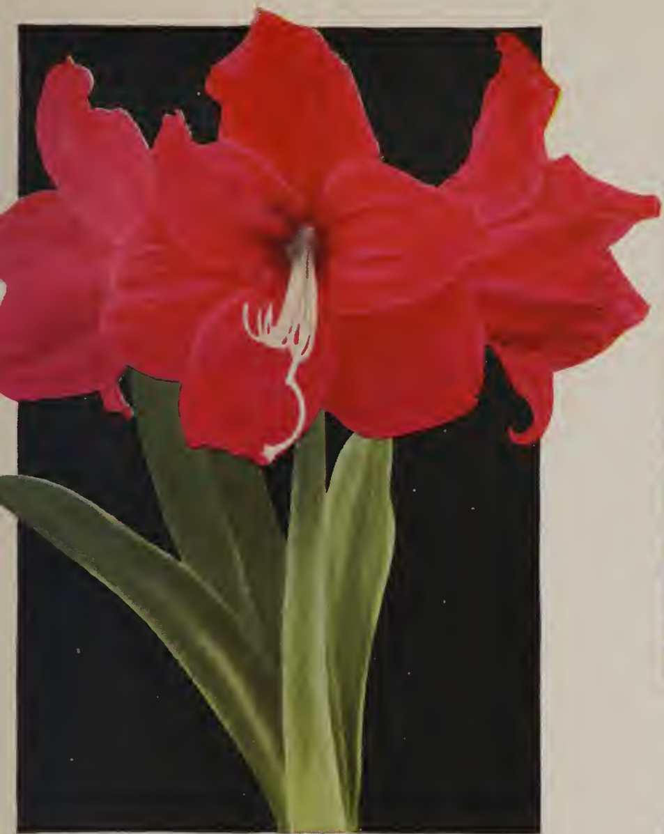
Amaryllis See page 52.