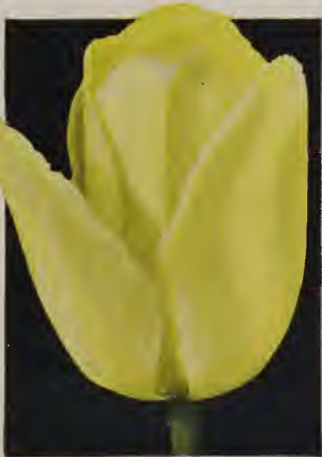
Ideal Darwin Tulip Starlight Page 9.