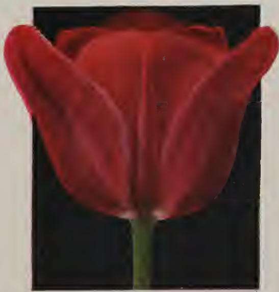
Ideal Darwin Tulip Bella Donna Page 7.