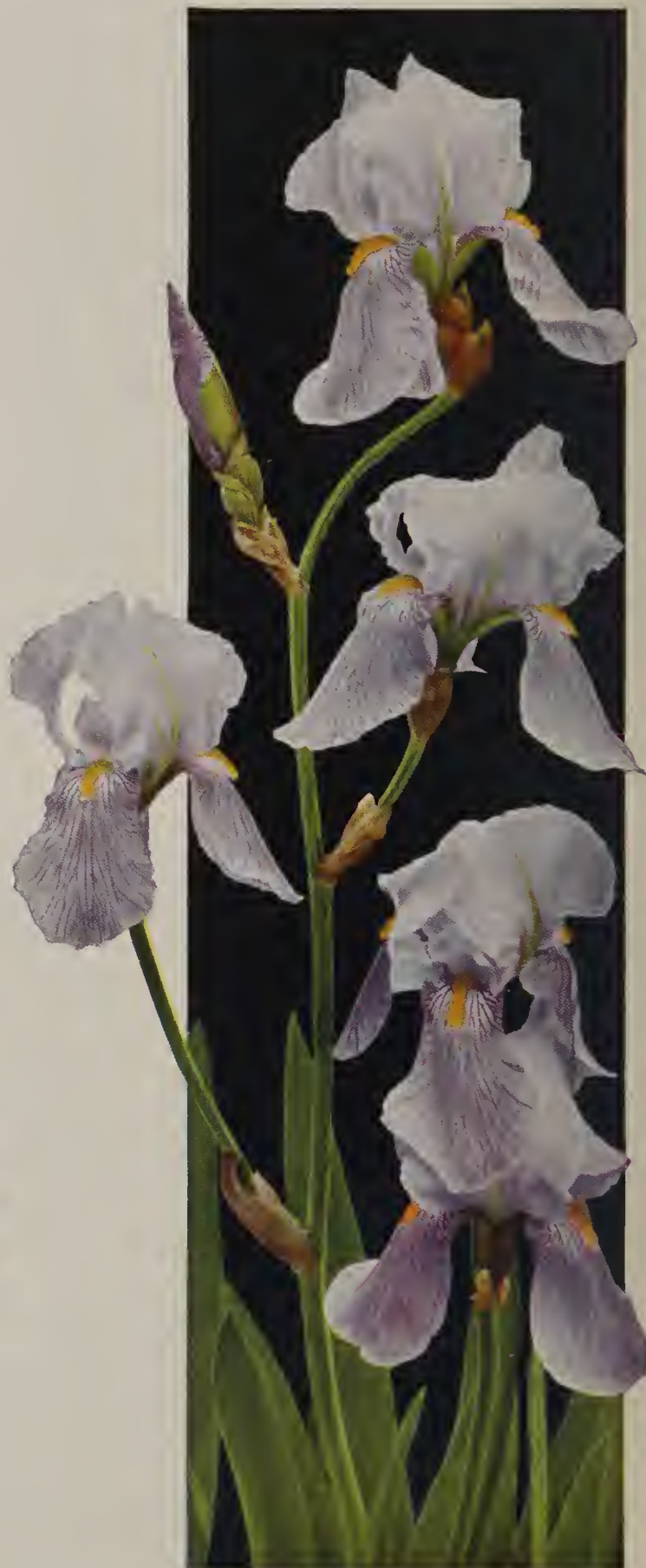
German Iris Pallida, Princess Beatrice See page 34.