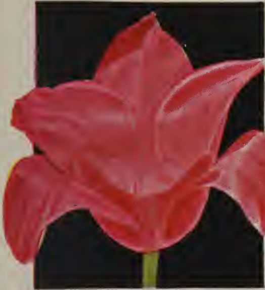
Lily-Flowering Tulip Yankee Girl Page 15.