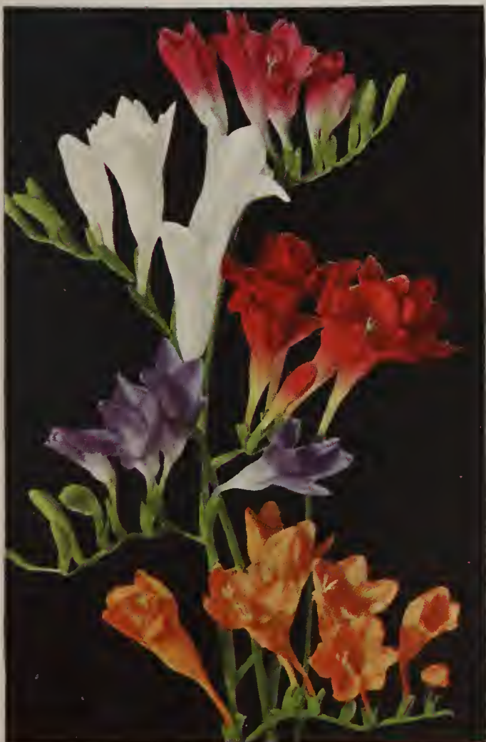
New Freesias See page 54.