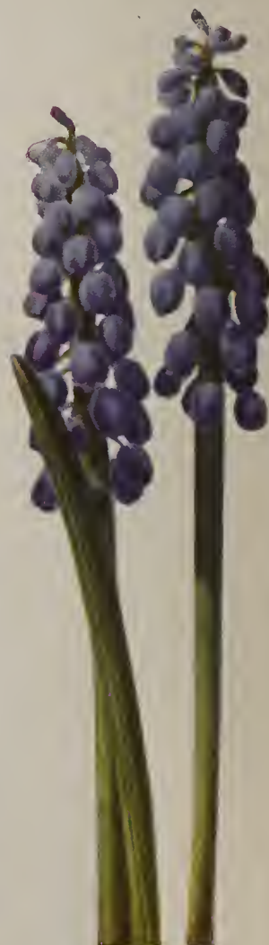
Muscari Botryoides See page 58.