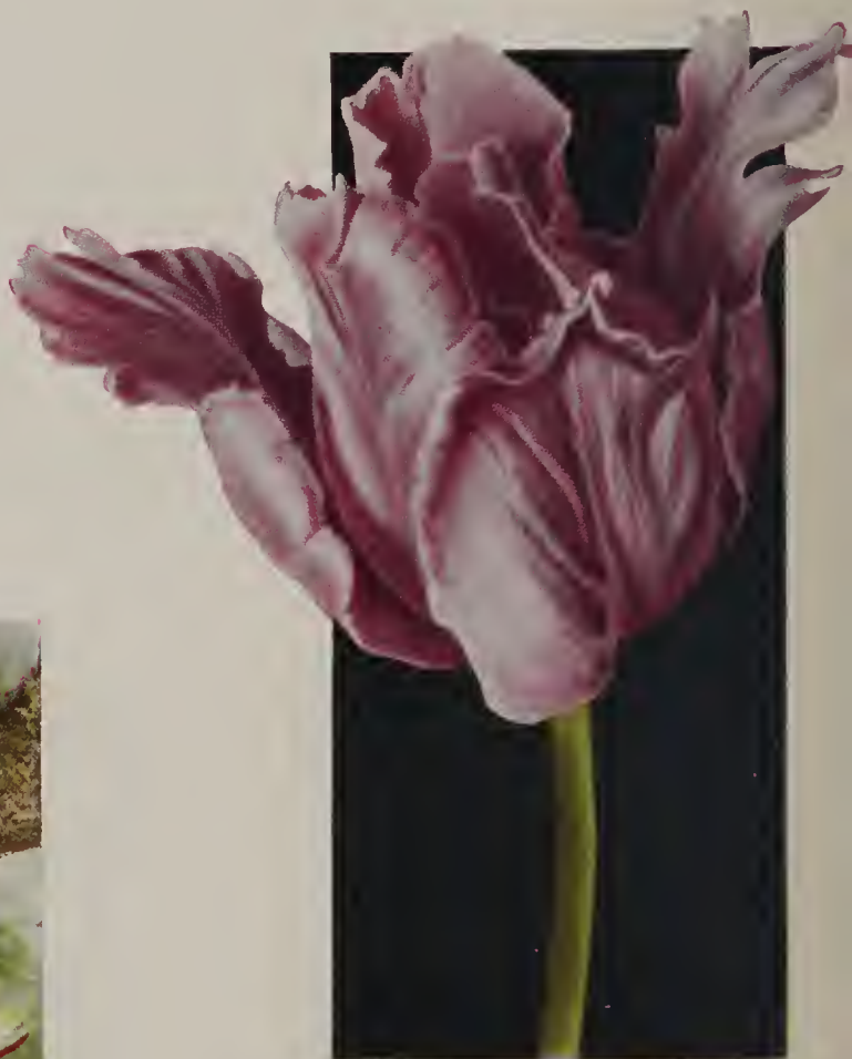
Parrot Tulip Gadelan Page 21.