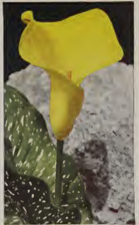
Calla Elliottiana See page 53.