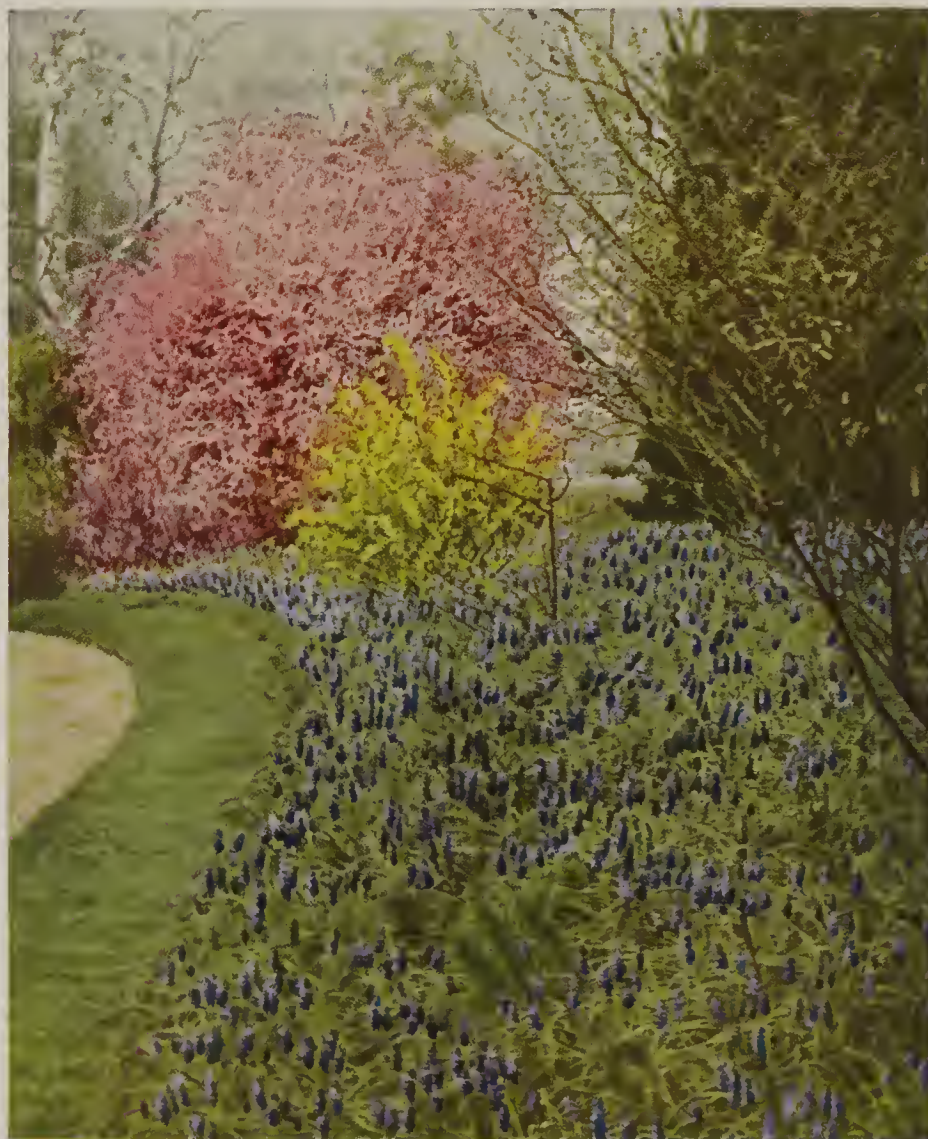
Muscari , Heavenly Blue See page 58.