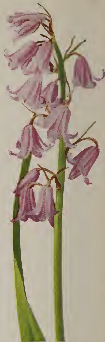
Scilla Hispanica Queen of the Pinks See page 59.