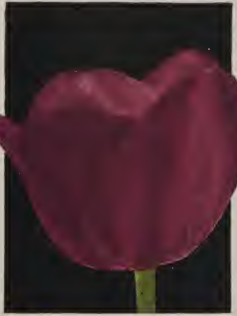
Darwin Tulip Paul Baudry Page 10.