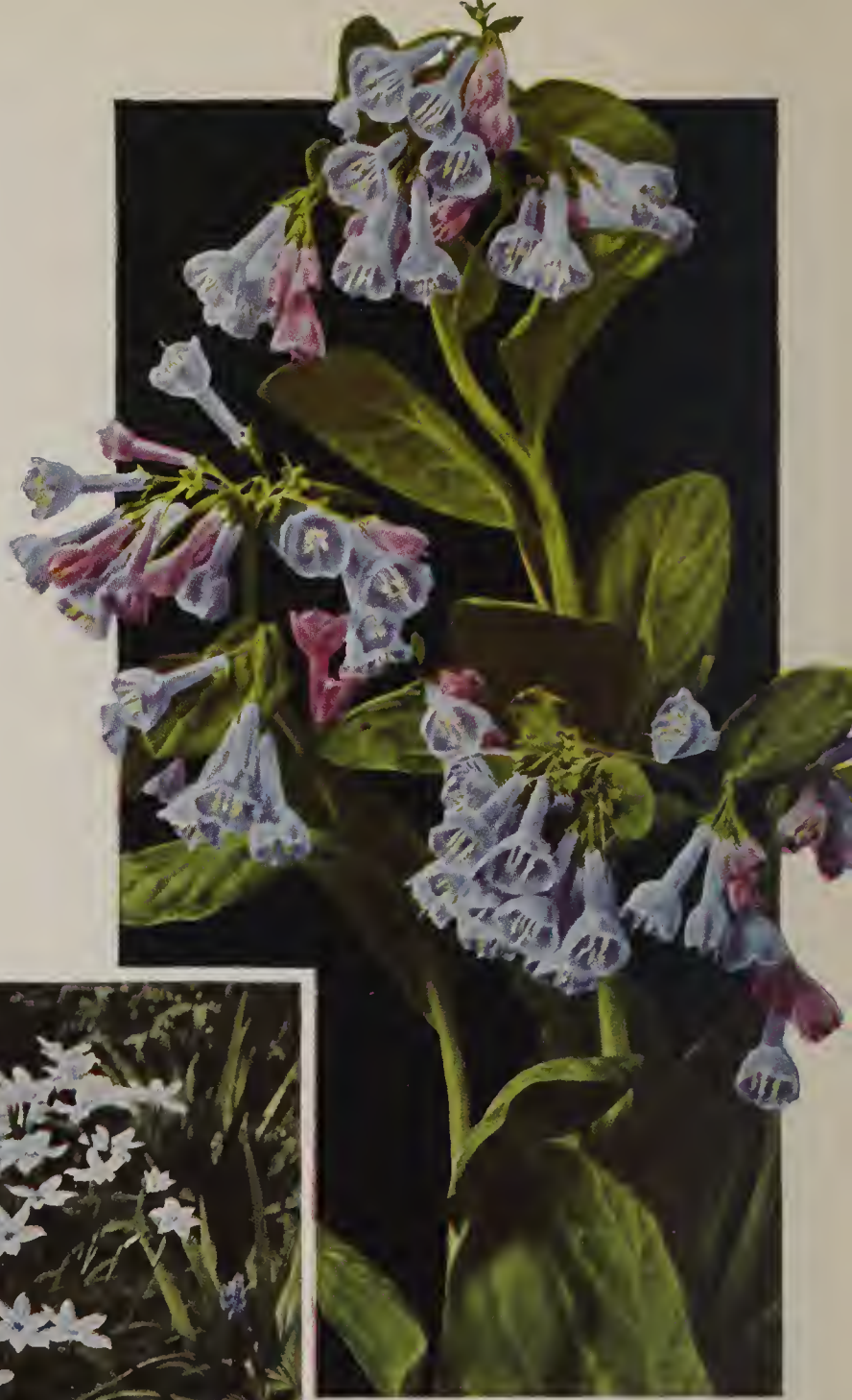
Mertensia Virginica See page 59.