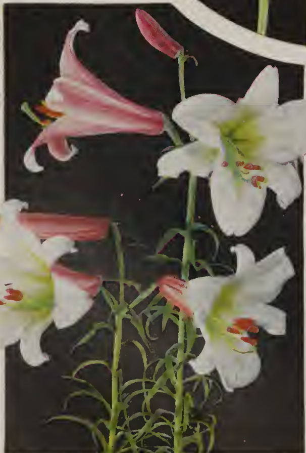
Lilium Regale See page 48.