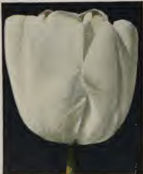
Ideal Darwin Tulip White Giant Page 9.