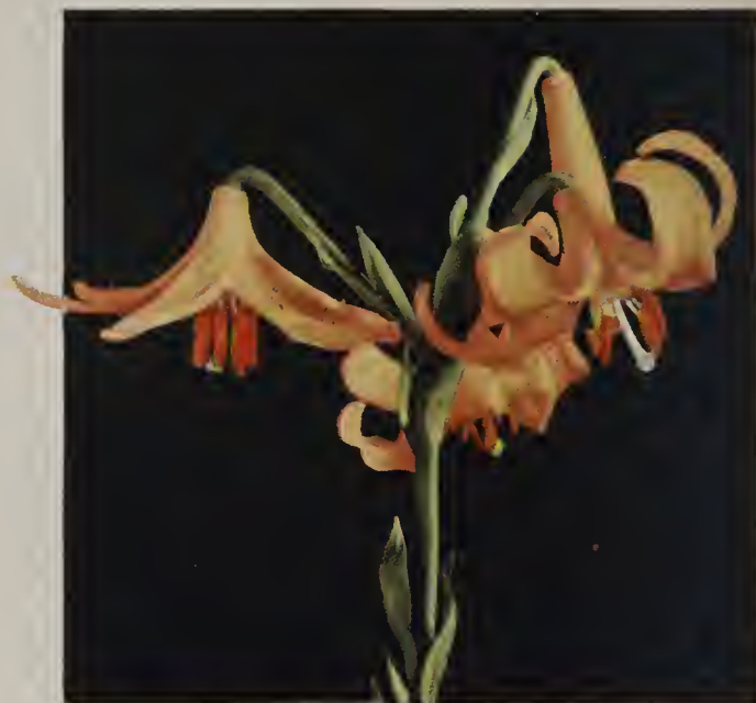
Lilium Testaceum See page 46.