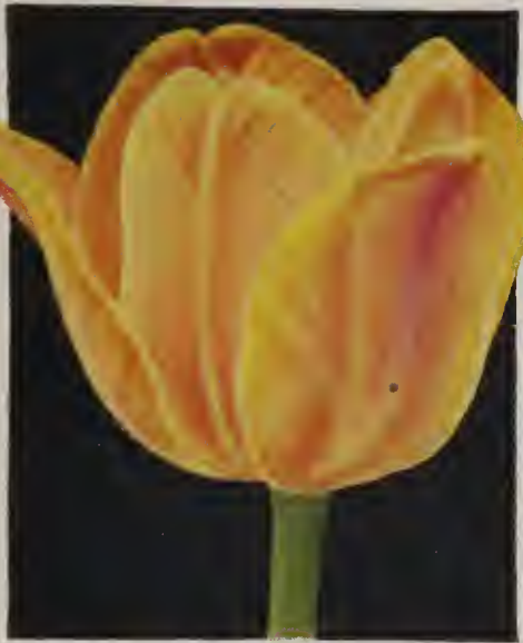
Breeder Tulip Golden West Page 14.