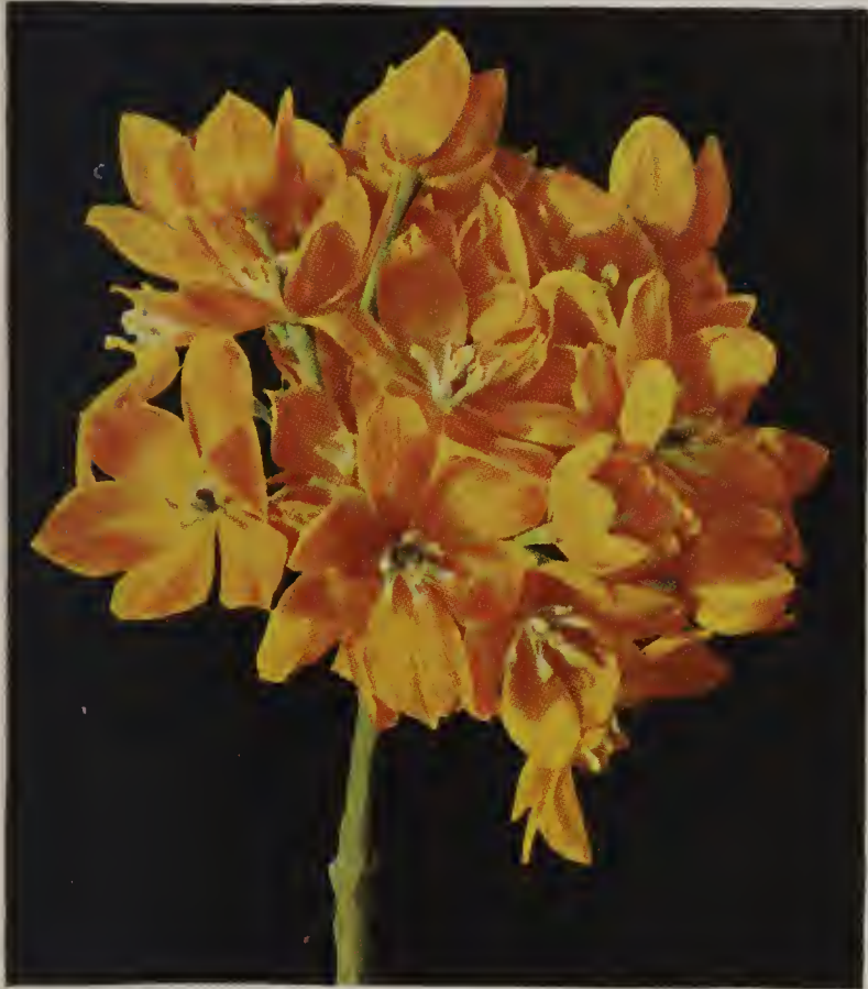
Ornithogalum Aureum See page 59.