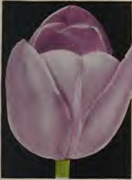
Ideal Darwin Tulip Heliotrope Page 8.