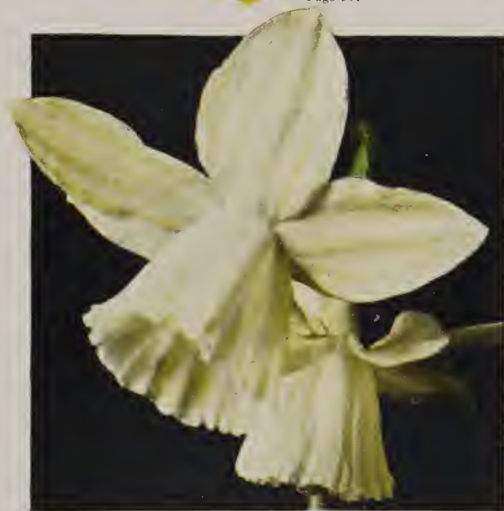
Triandrus Hybrid, Thalia Page 41.