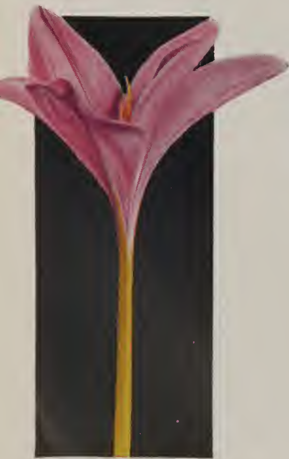
Colchicum Speciosum See page 27.