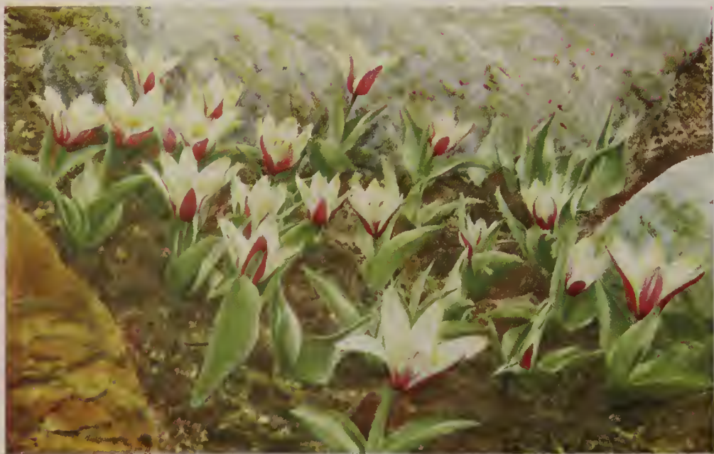
Waterlily Tulip, Tulipa Kaufmanniana Page 25.