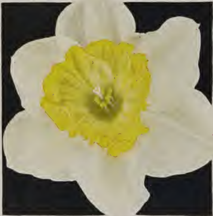
Incomparabilis John Evelyn Page 40.