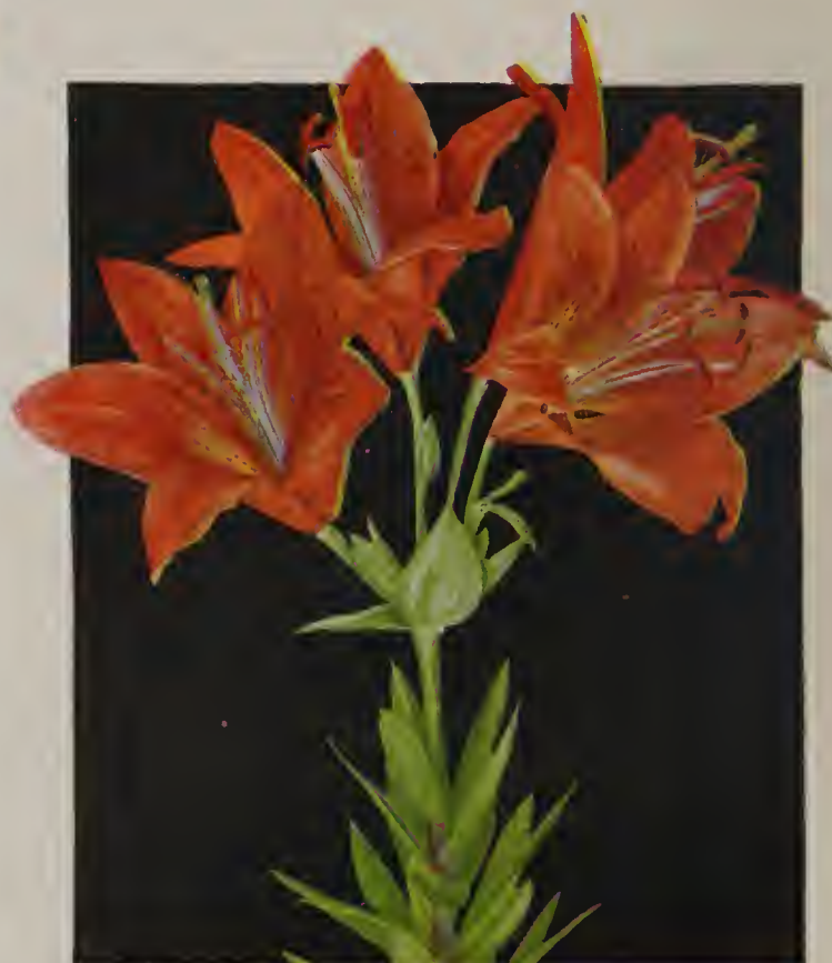
Lilium Umbellatum Grandiflorum See page 48.