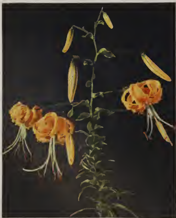
Lilium Henryi See page 47.

These four charming Lilies with reasonable care will grow in any garden