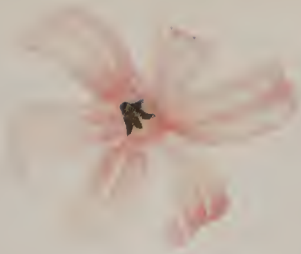
General De Wet