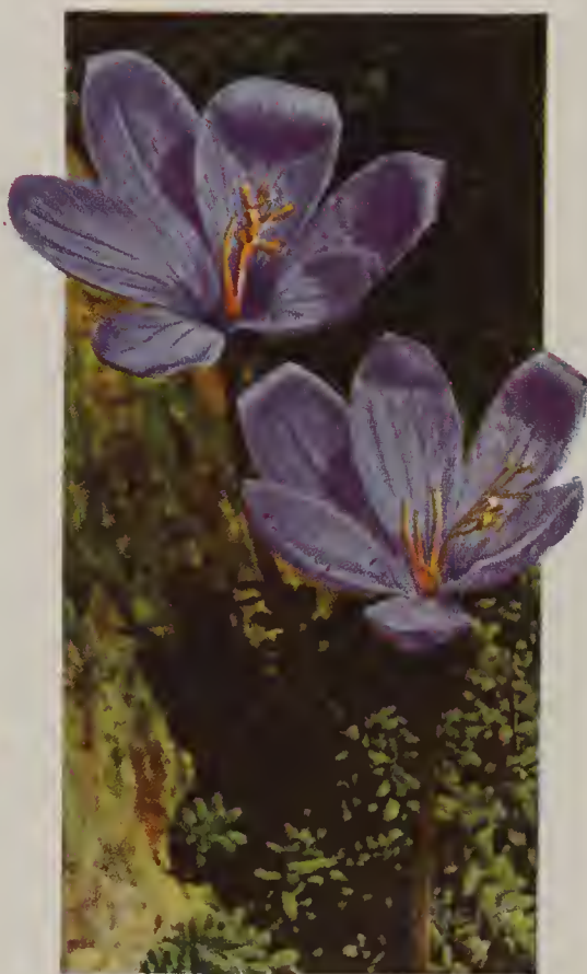
Autumn Flowering Species Crocus Speciosus See page 26.