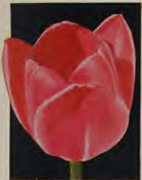
Ideal Darwin Tulip The Peach Page 9.