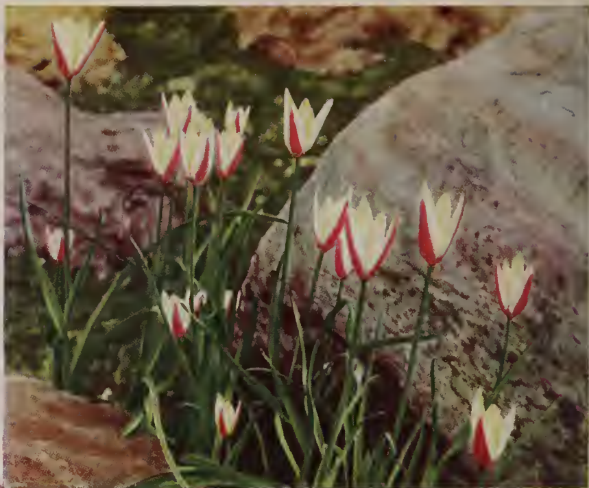
Tulipa Clusiana Page 25.