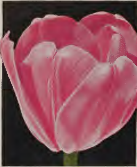
Ideal Darwin Tulip Caroline Testout Page 7.