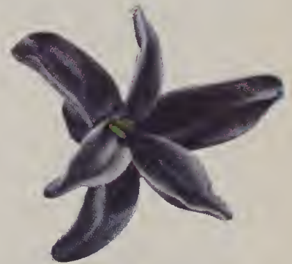
Duke of Westminster.