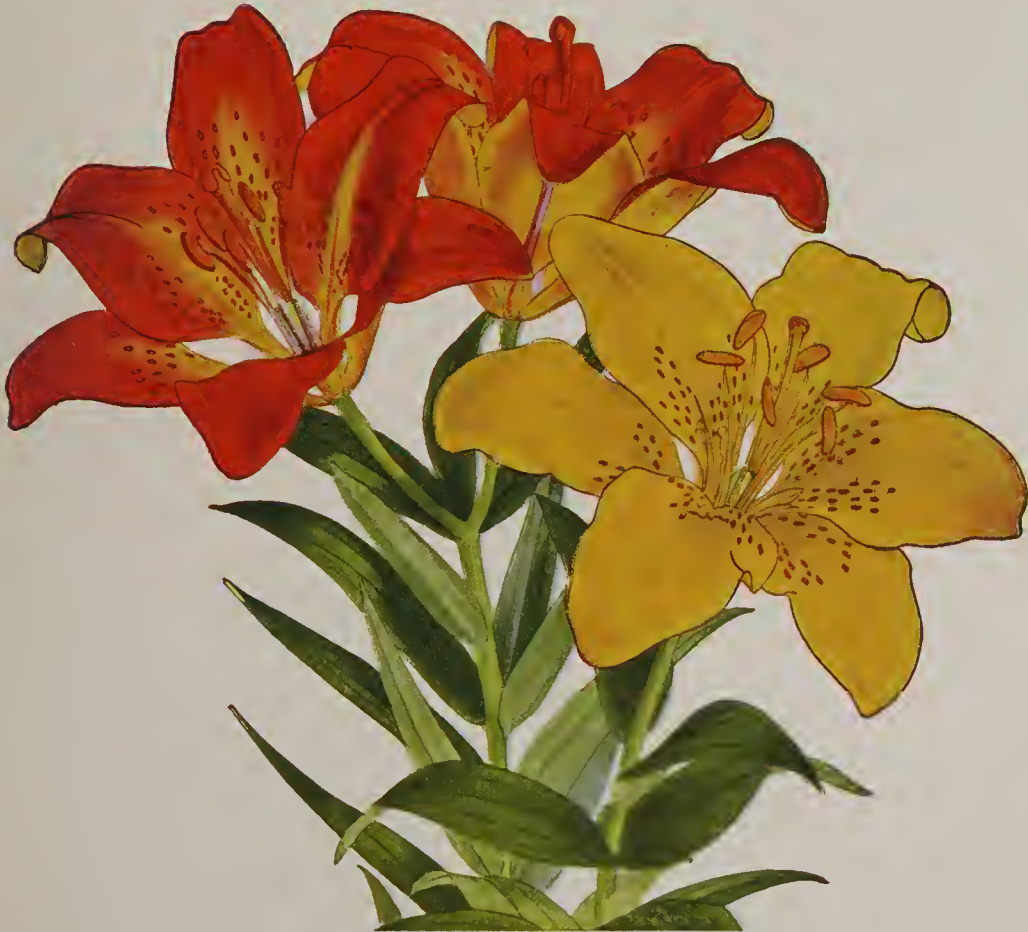
Lilium Elegans See page 47.