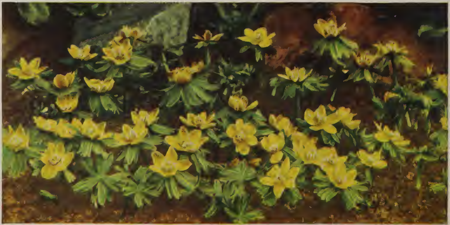
Eranthis Hyemalis See page 53.