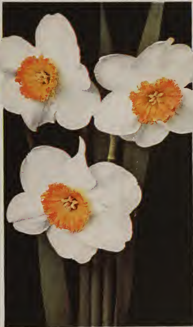
Barri, Fleur Page 41.