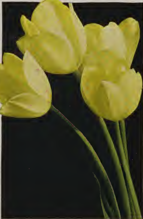
Multiflowered Tulip Sulphur Gem Page 20.