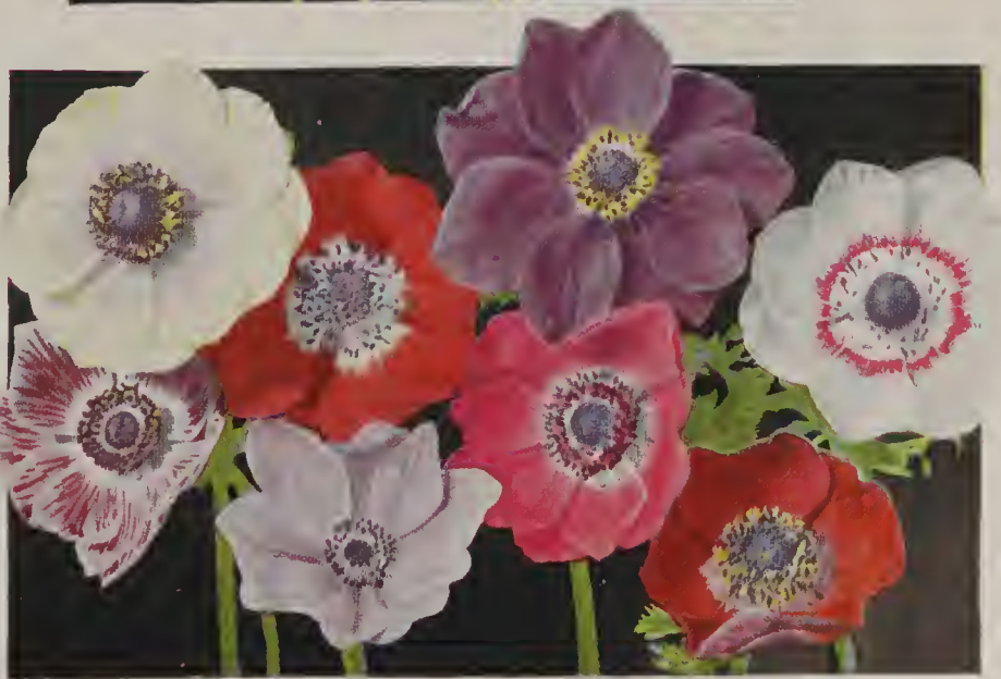
Anemone De Caen and St. Brigid, Poppy Anemones See page 52.