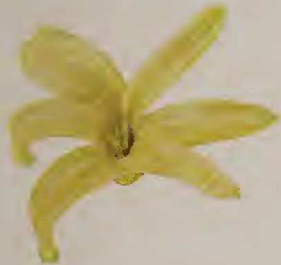
City of Haarlem

The 10 varieties illustrated here are especially recommended for ex- hibition or indoor growing.