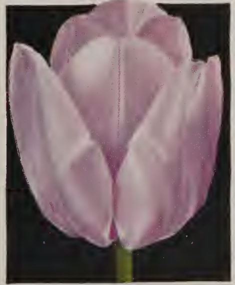
Ideal Darwin Tulip Lilac Wonder Page 8.