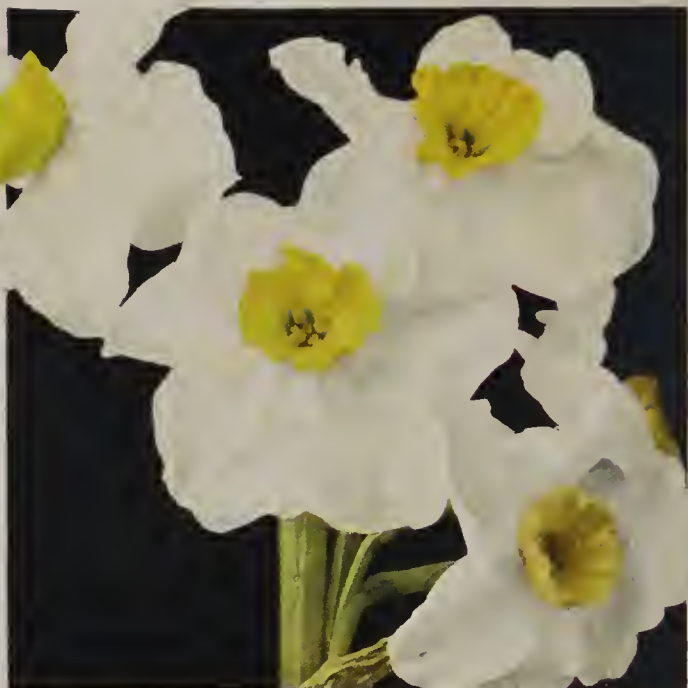
Poetaz , Laurens Koster