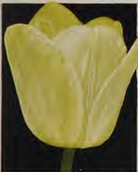
Ideal Darwin Tulip Lord Lambourne Page 8.