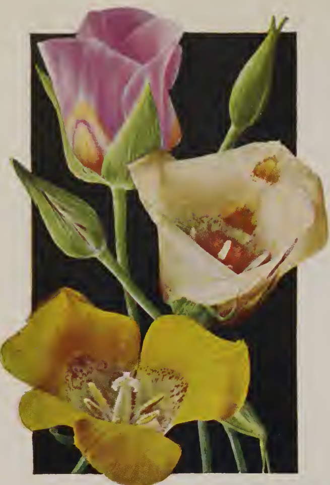
Calochortus See page 53.