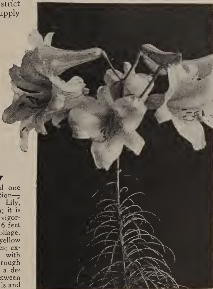
The Regal Lily

Big bulbs, about 9-11 inches in circumference, per doz., $2.88; per 100, $20.00. Not less than 3 bulbs sold at this price.