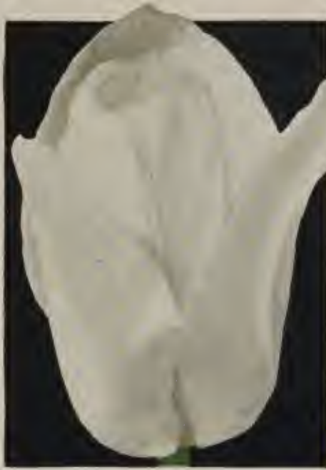
Ideal Darwin Tulip Mrs. Grullemans Page 8.