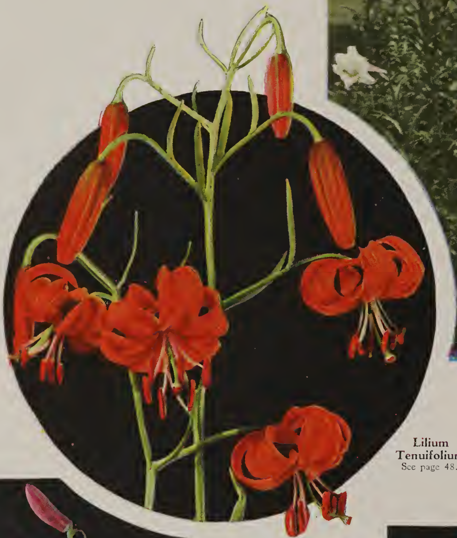
Lilium Tenuifolium See page 48.