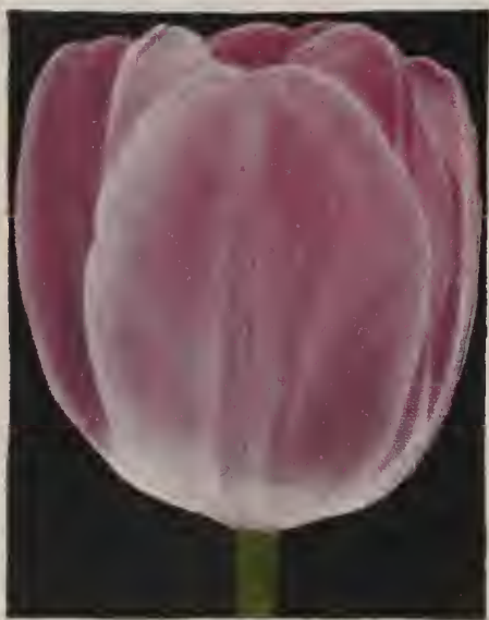
Ideal Darwin Tulip Cote d'Azur Page 7.