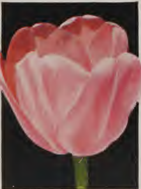
Ideal Darwin Tulip Queen of England Page 9.