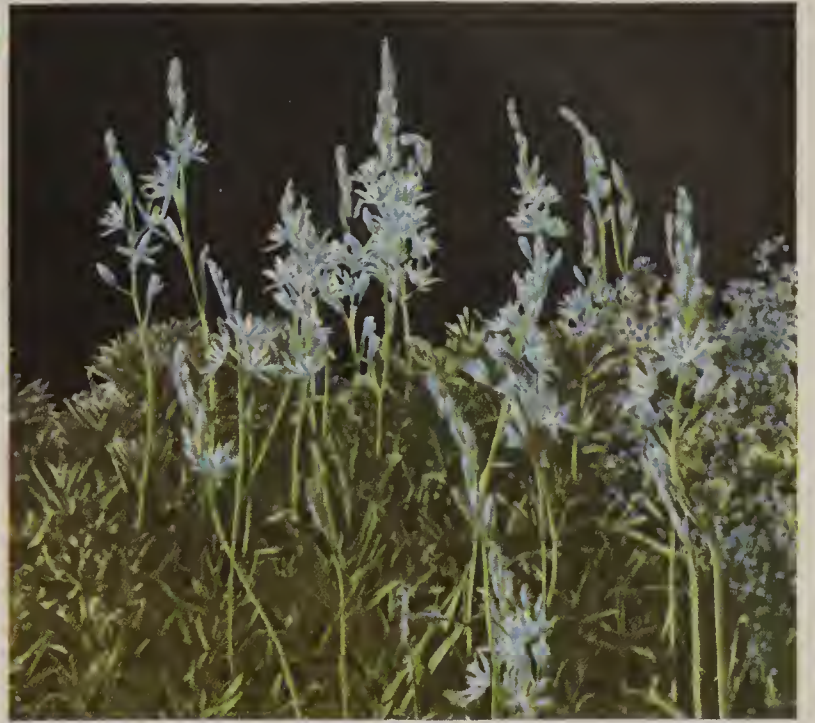
Camassia Leichtlini See page 53.