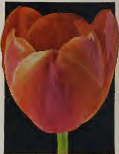
Breeder Tulip Dillenburg Page 14.