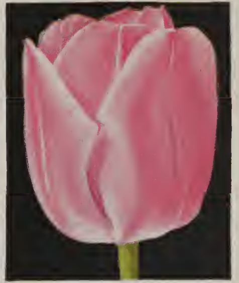
Ideal Darwin Tulip La France Page 8.