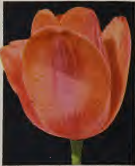
Ideal Darwin Tulip Lady Hillingdon Page 8.