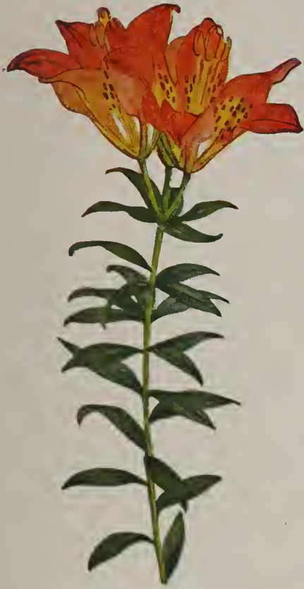
Lilium Philadelphicum See page 48.