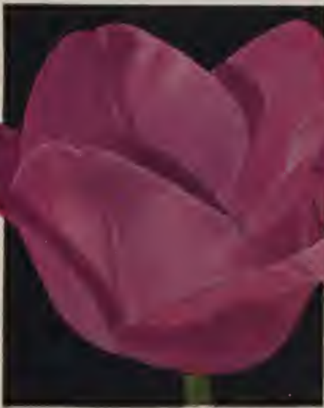
Ideal Darwin Tulip Scotch Lassie Page 9.