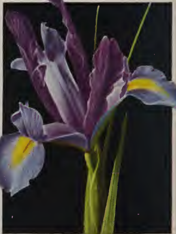
Dutch Iris Poggenbeeck See page 32.