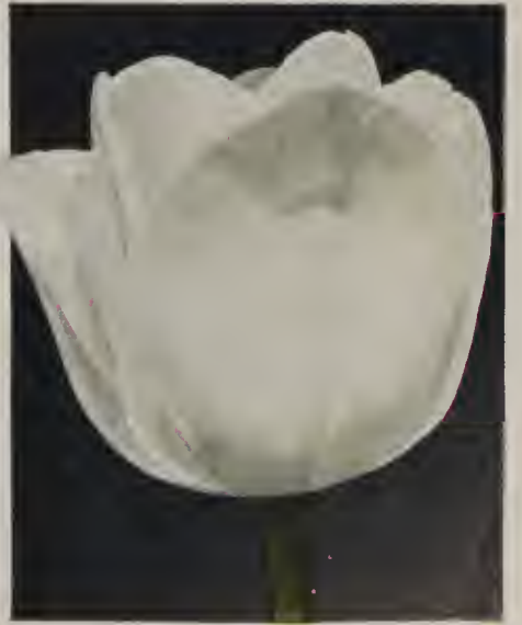
Ideal Darwin Tulip Mount Everest Page 8.