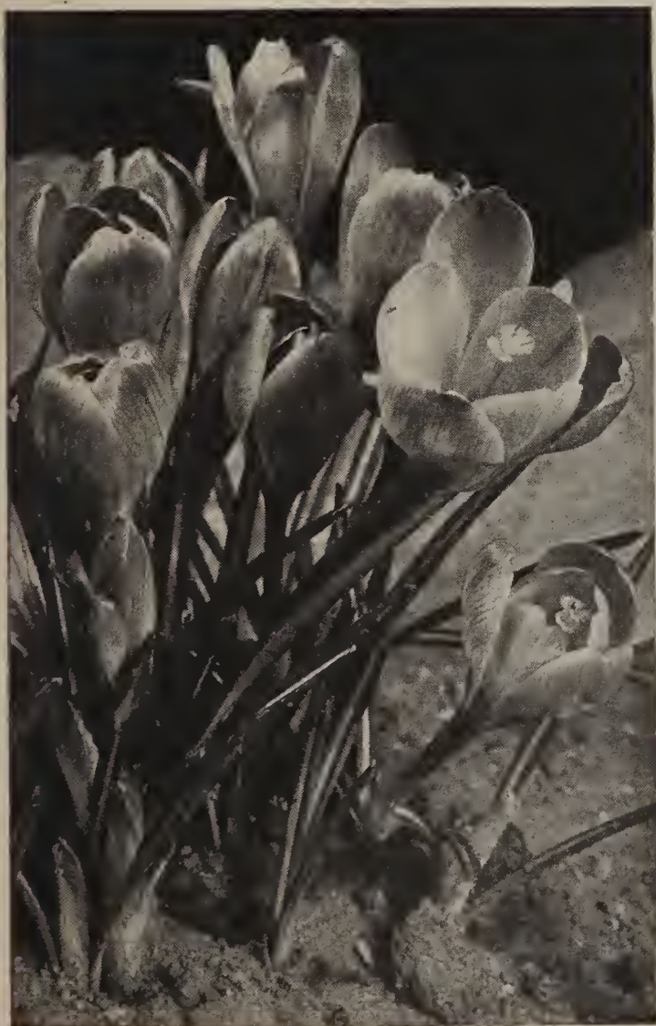
Crocus Vernus, Golden Goblet