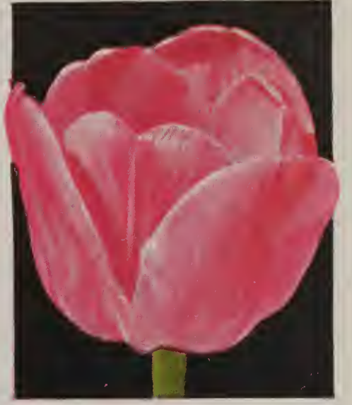
Ideal Darwin Tulip Adoration Page 7.