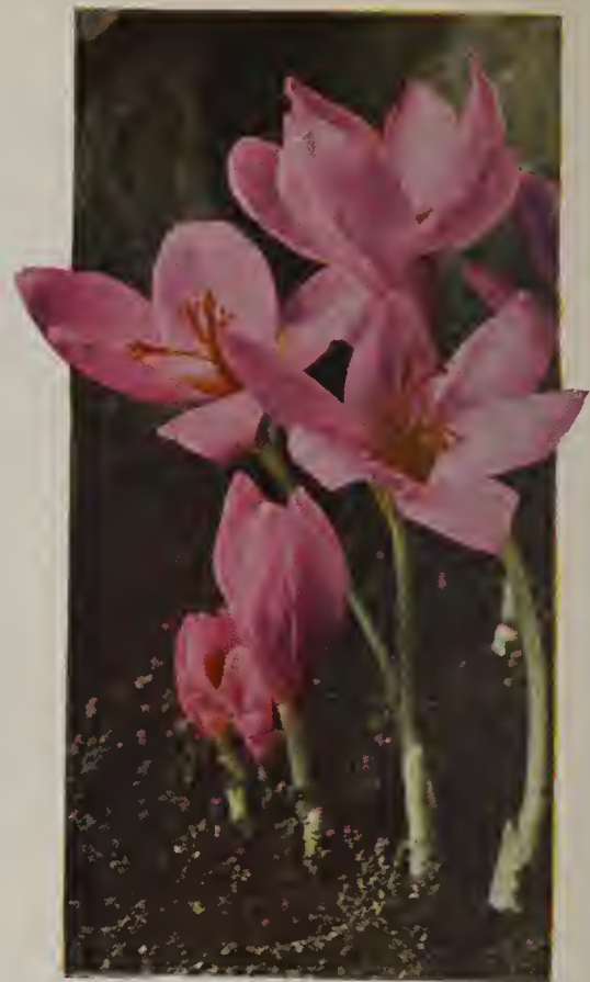
Autumn Flowering Species Crocus Zonatus See page 26.