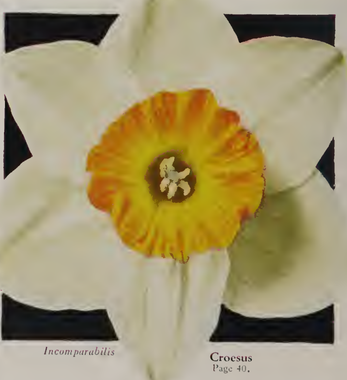
Incomparabilis Croesus Page 40.