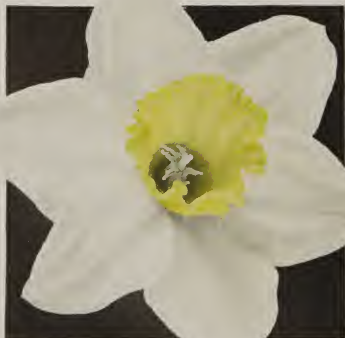
Leedsi Louis Capet