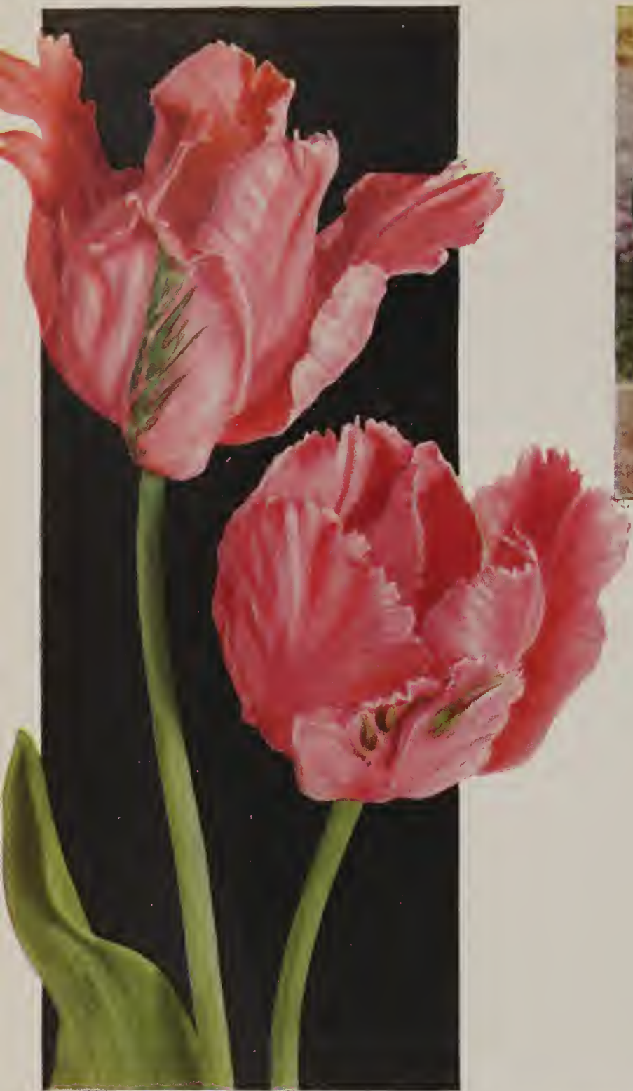
Parrot Tulip, Fantasy Page 21.