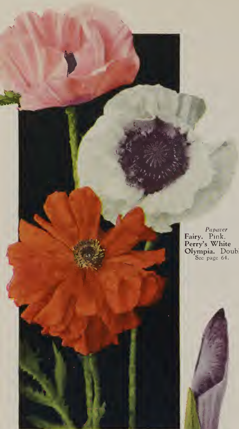
Papaver Fairy. Pink. Perry's White Olympia. Double. See page 64.

All should be planted early this autumn.