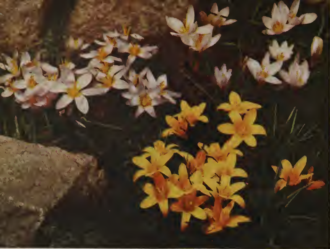
Late Winter Flowering Crocus Upper Left, Tommasinianus Upper Right, Sieberi Lower Right, Susianus See page 26.