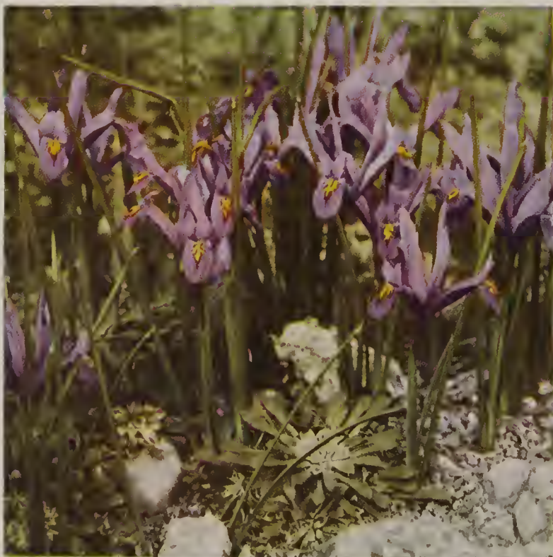
Sweet-Scented Iris Reticulata See page 32.