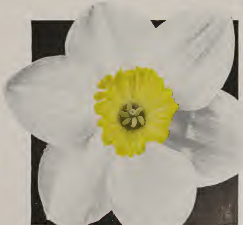
Leedsi, Hera Page 41.