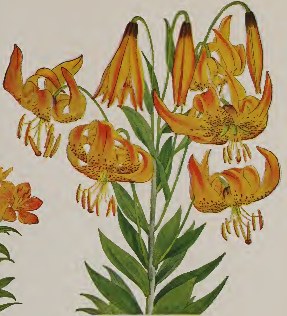
Lilium Superbum See page 48.