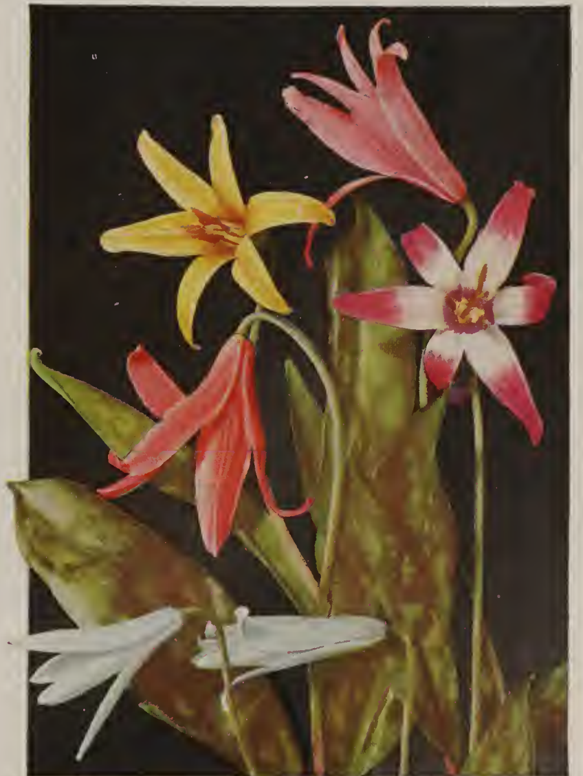
Erythronium See page 54.