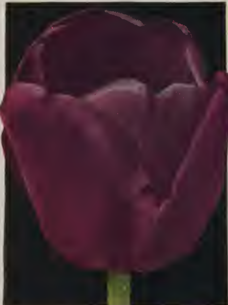
Ideal Darwin Tulip Humming Bird Page 8.