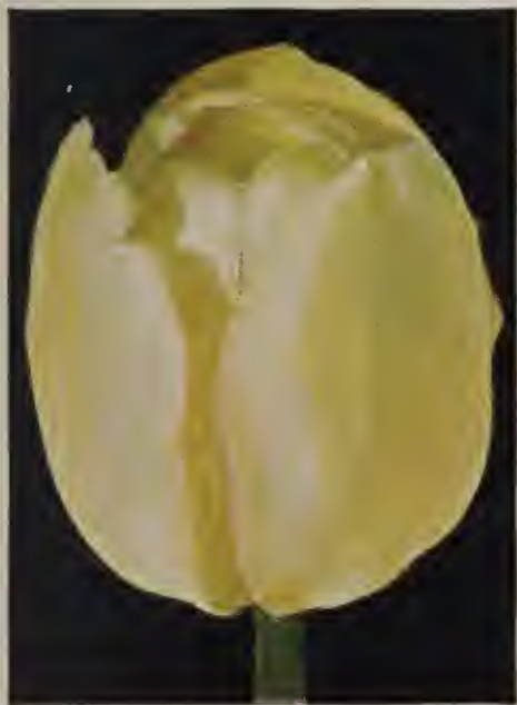
Ideal Darwin Tulip La Tosca Page 8.