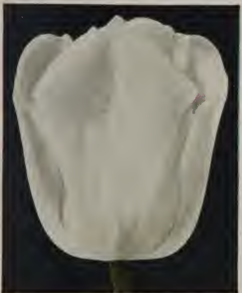
Ideal Darwin Tulip Kriemhilde Page 8.