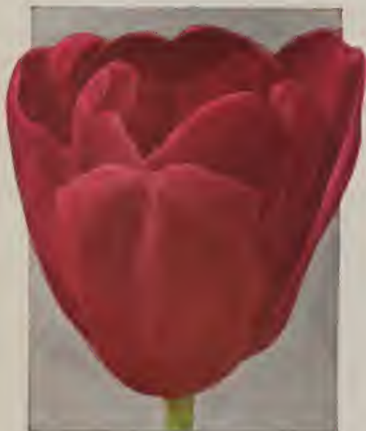
Ideal Darwin Tulip Bourgogne Page 7.