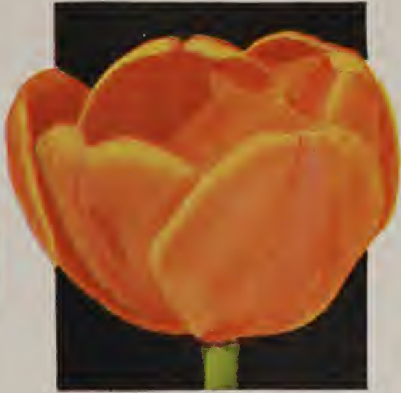
Breeder Tulip Reve d'Or Page 15.