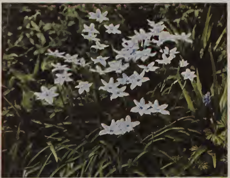
Triteleia Uniflora See page 60.