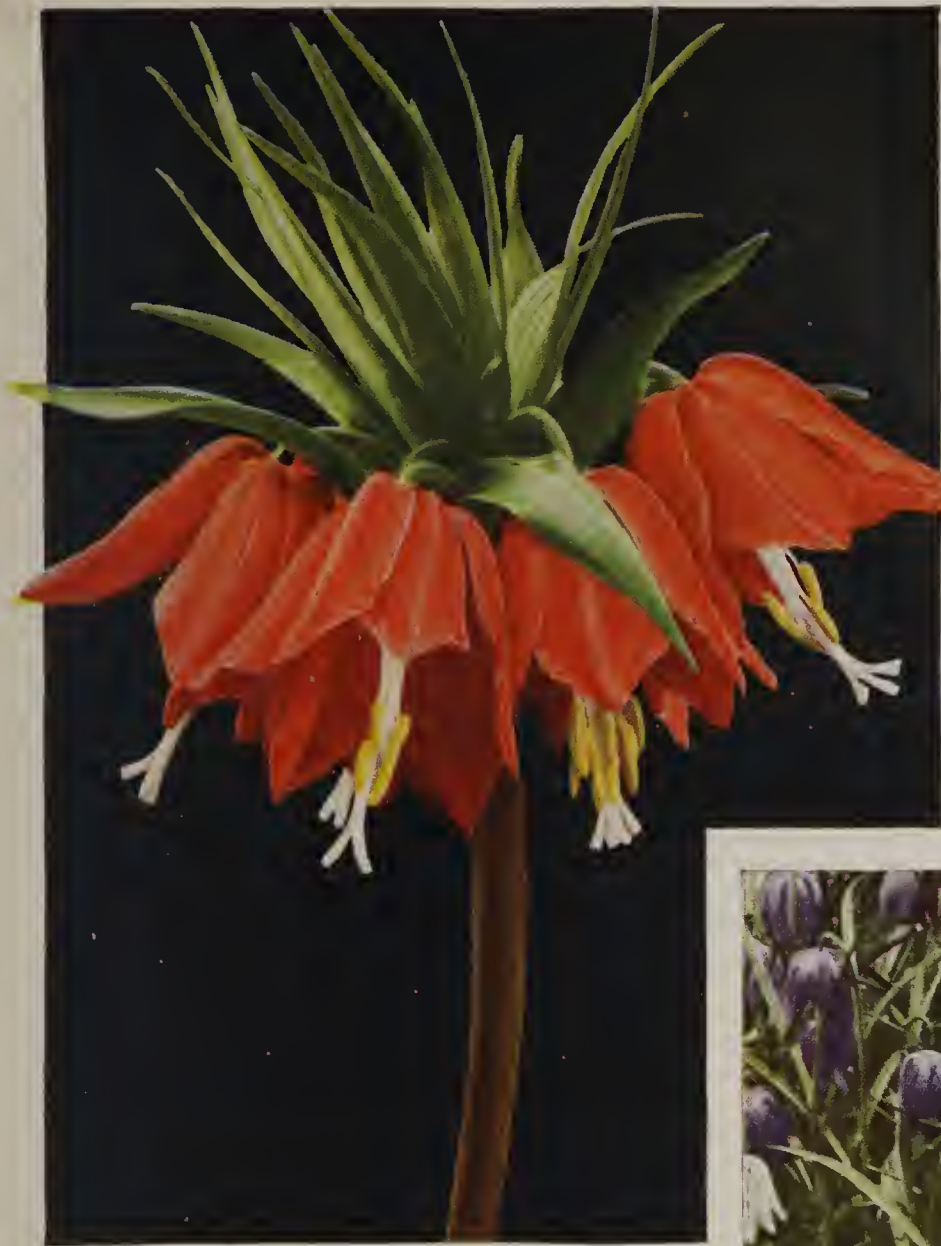
Fritillaria Imperialis Aurora. See page 57.