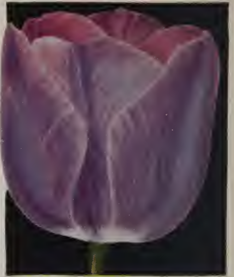
Ideal Darwin Tulip Helen Wills Page 8.