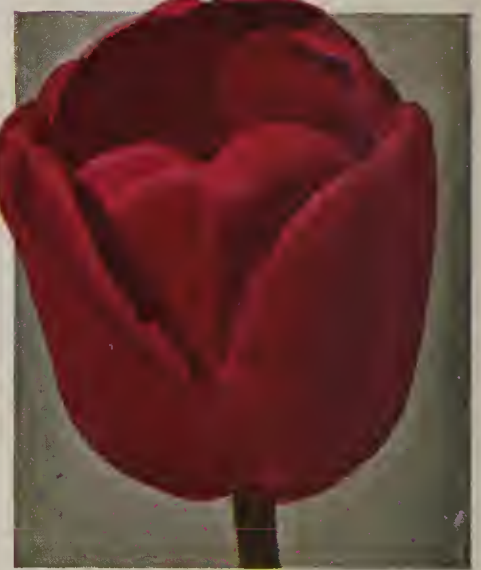
Ideal Darwin Tulip America Page 7.