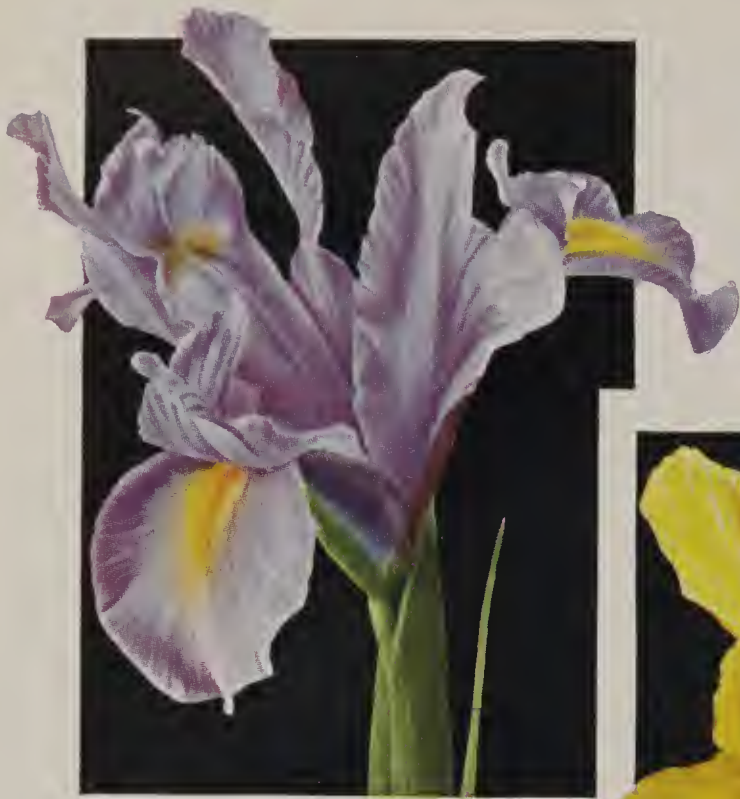
Dutch Iris Jacob De Wit See page 32.