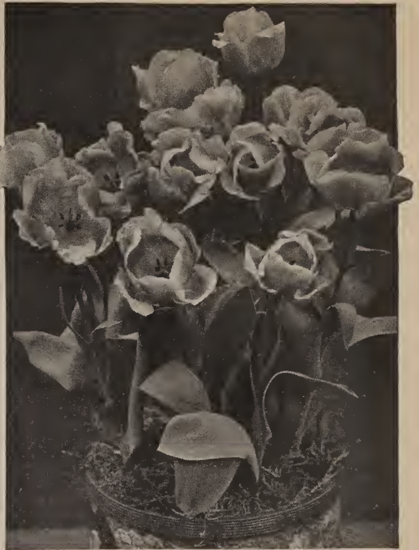
Single Tulip De Wet Growing in Fiber

When the bulbs have made a good top growth in the dark, the bowls should be placed in a sunny window where they will get the morning sun. They must have sufficient light and air to prevent the