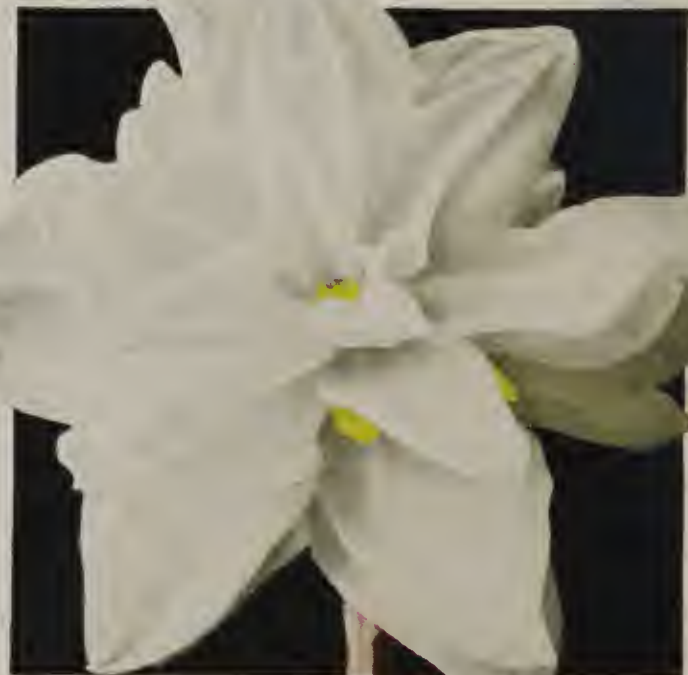
Double Narcissus , The Pearl