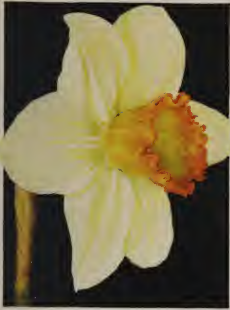
Incomparabilis Will Scarlett Page 40.