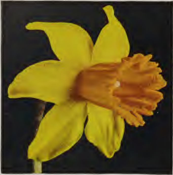
Cyclamineus Hybrid, February Gold Page 41.