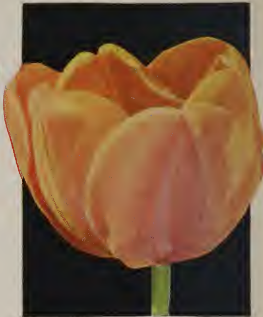
Breeder Tulip Rayon d'Or Page 15.