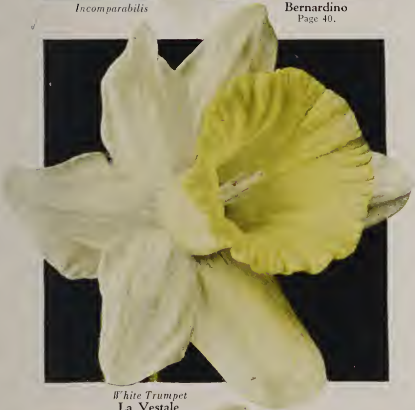
White Trumpet La Vestale Page 39.