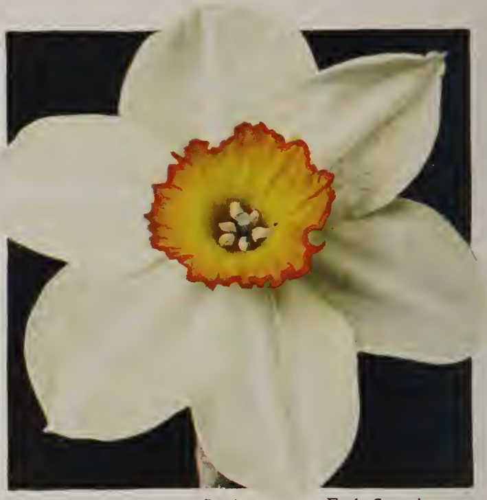
Barri Early Surprise Page 40.