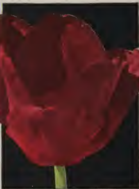
Breeder Tulip Indian Chief Page 14.