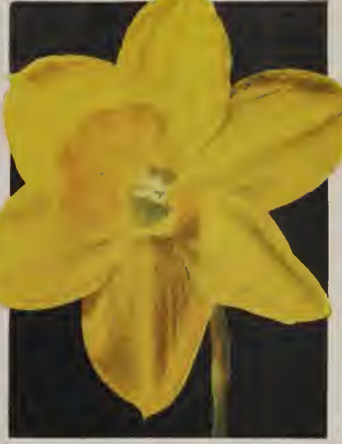
Jonquilla Tullus Hostilius Page 42.