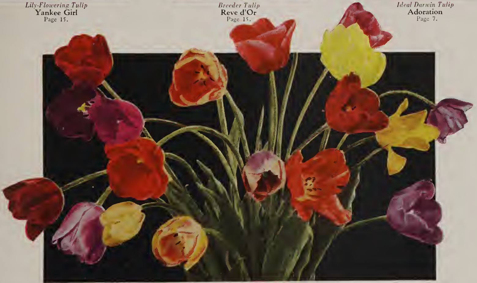
Unnamed varieties of Darwin, Breeder, Lily-flowered and Cottage Tulips blended in lovely colors; with long stems for cutting. See page 3 for price.