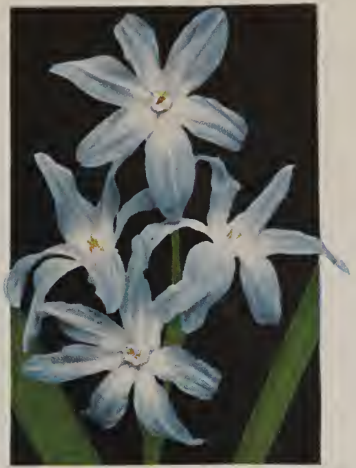
Chionodoxa Luciliae. See page 53.