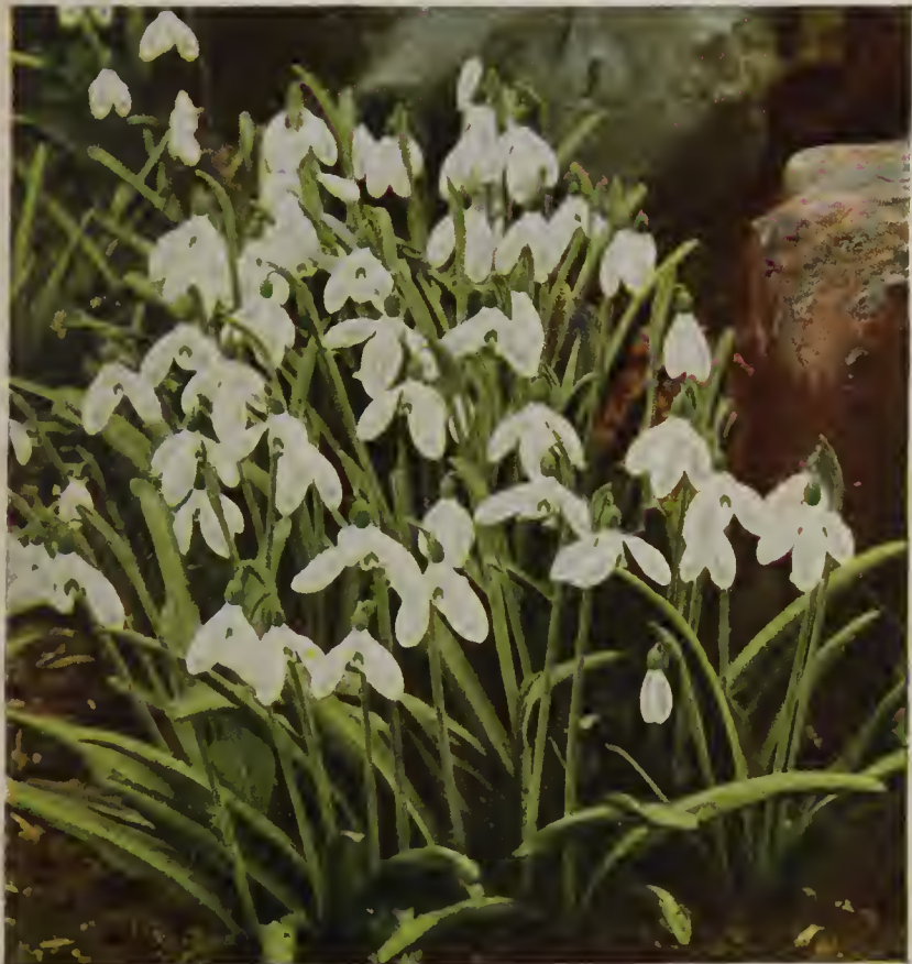
Galanthus Nivalis See page 57.