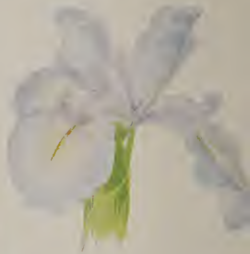
English Iris See page 32.