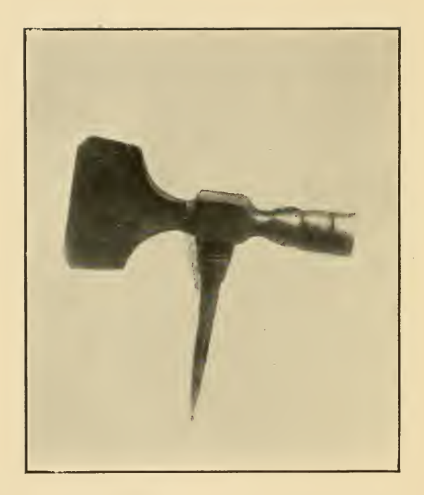
SCREW-DRIVER TO A FLINT-LOCK GUN