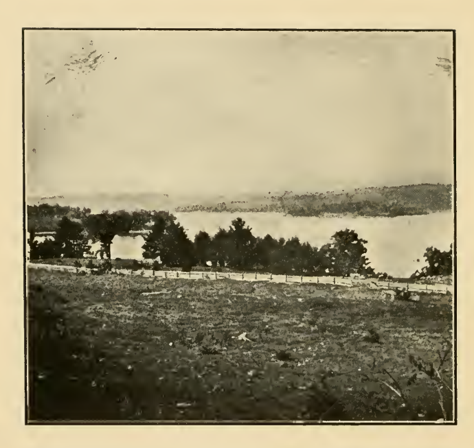
LAKE BOMBAZON, NESHOBE ISLAND, AND BIRCH POINT, IN CASTLETON, VERMONT.