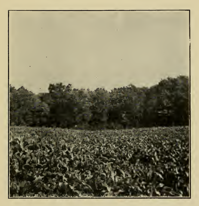
OLD BURYING GROUND IN LITTLETON, MASS., BEARING A CROP OF CORN IN 1914