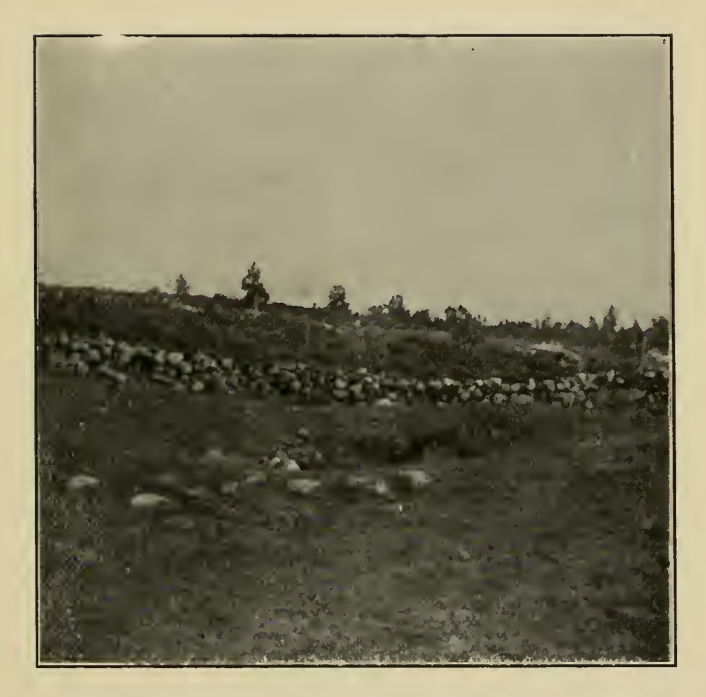
TRADITIONAL SITE OF THE INDIAN FORT AND WELL NEAR FORT POND IN NASHOBAH PLANTATION.