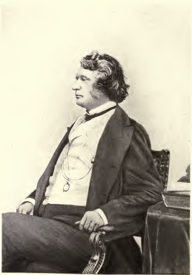
Charles Sumner. From a Photograph by Brady, 1869.