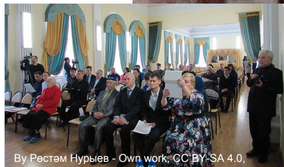
By Рәстәм Нурыев - Own work, CC BY-SA 4.0.