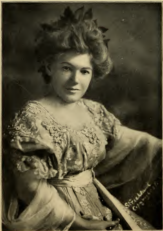
Ella Wheeler Wilcox