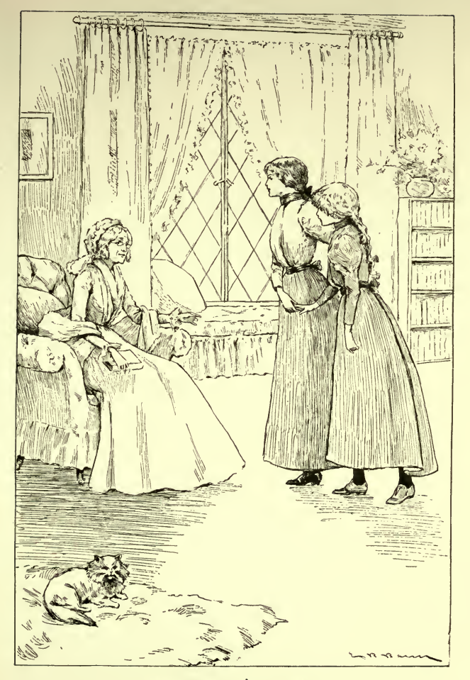
AUNT FAITH'S ROOM.