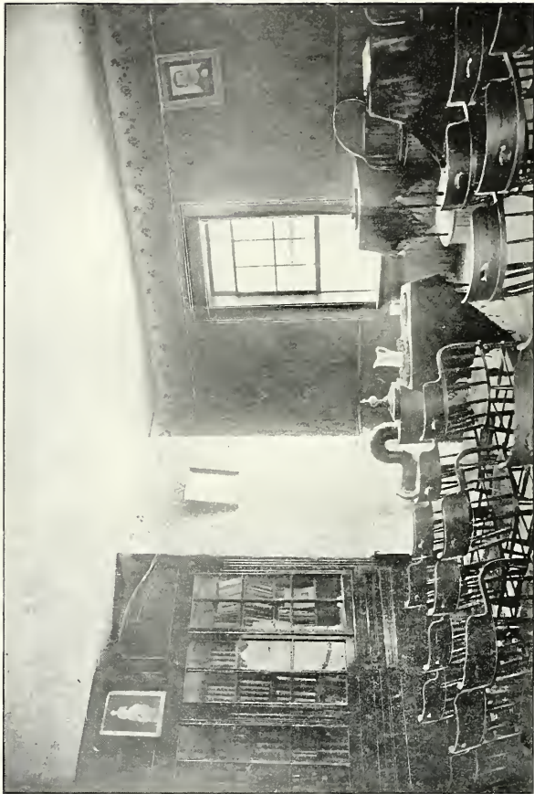
CLIOSOPHIC LITERARY SOCIETY