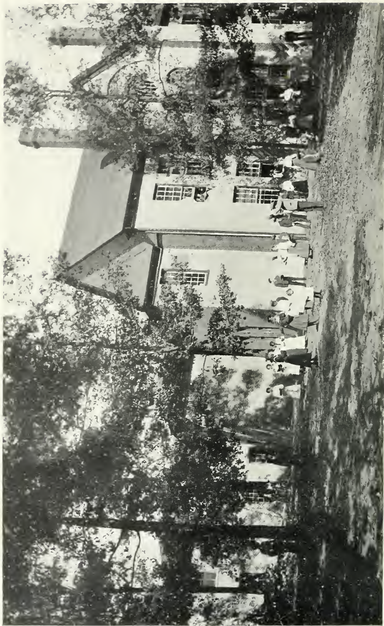
PARTIAL SOUTH VIEW OF ACADEMIC BUILDING