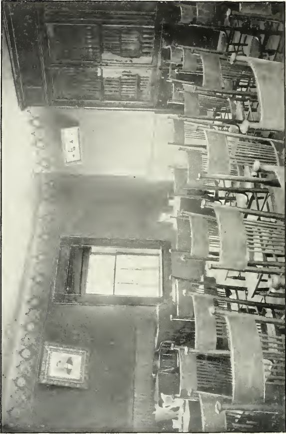
DELPHIAN LITERARY SOCIETY