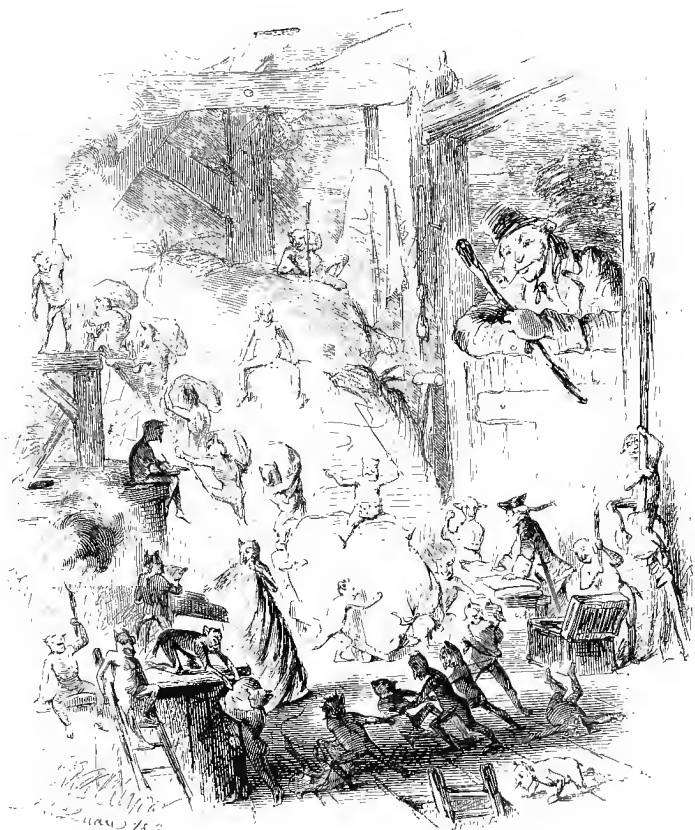
NED. GERAGHTY'S LUCK.