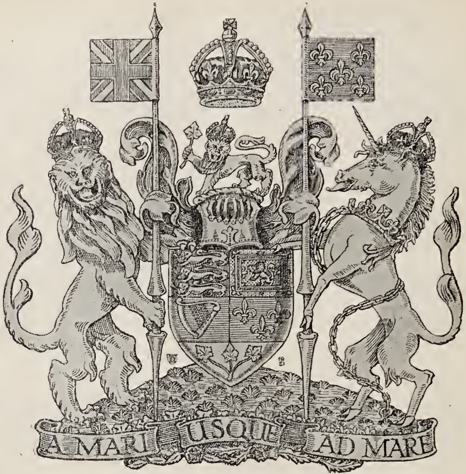
THE DOMINION OF CANADA COAT OF ARMS. Approved November 1921.