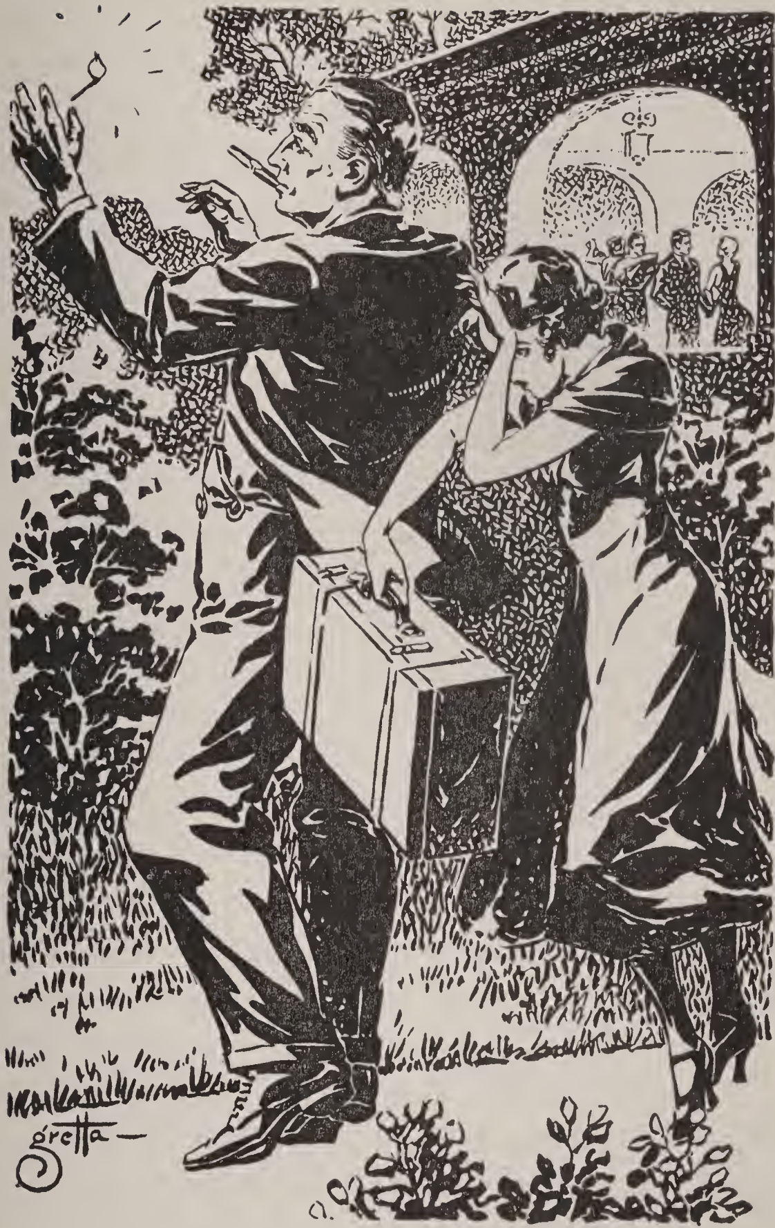
SHE COLLIDED WITH A MAN.—Page 267