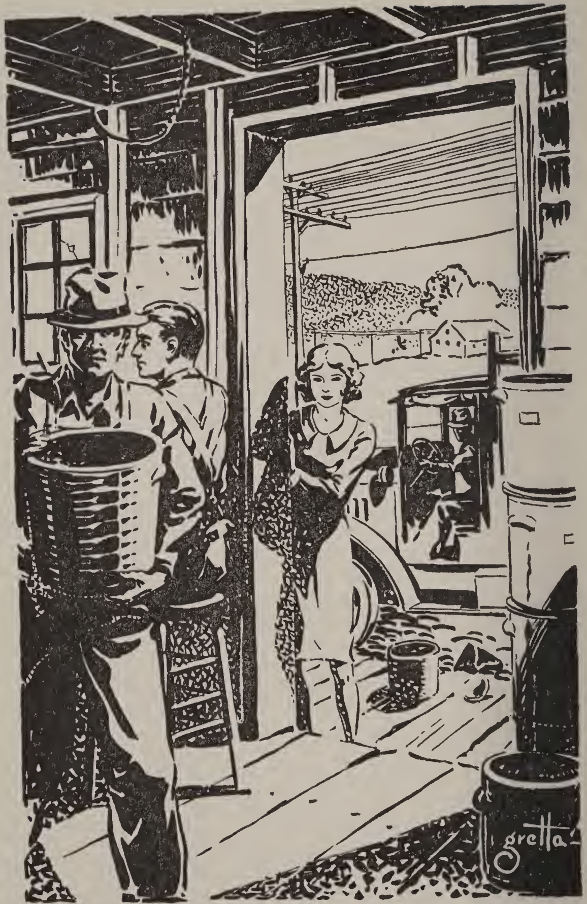
HER CURIOSITY EMBOLDENED HER.—Page 42