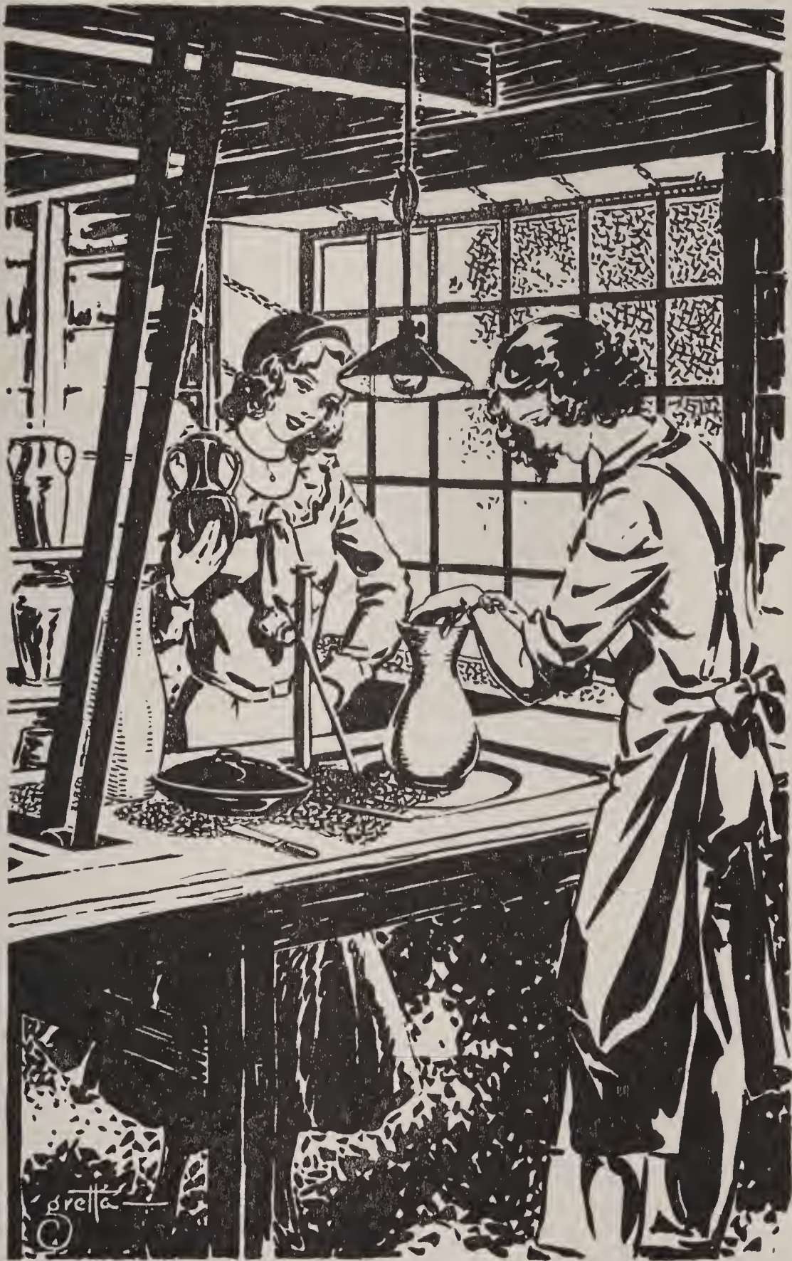
"I RATHER ENVY YOU."—Page 94