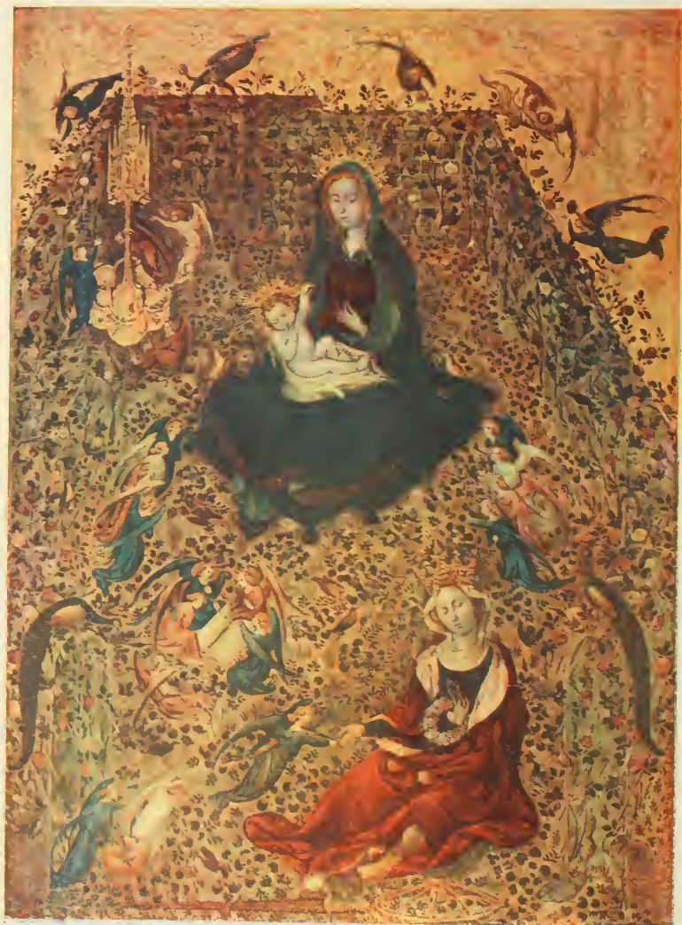
AN ITALIAN FANTASY By Stefano de Zevio (Verona)