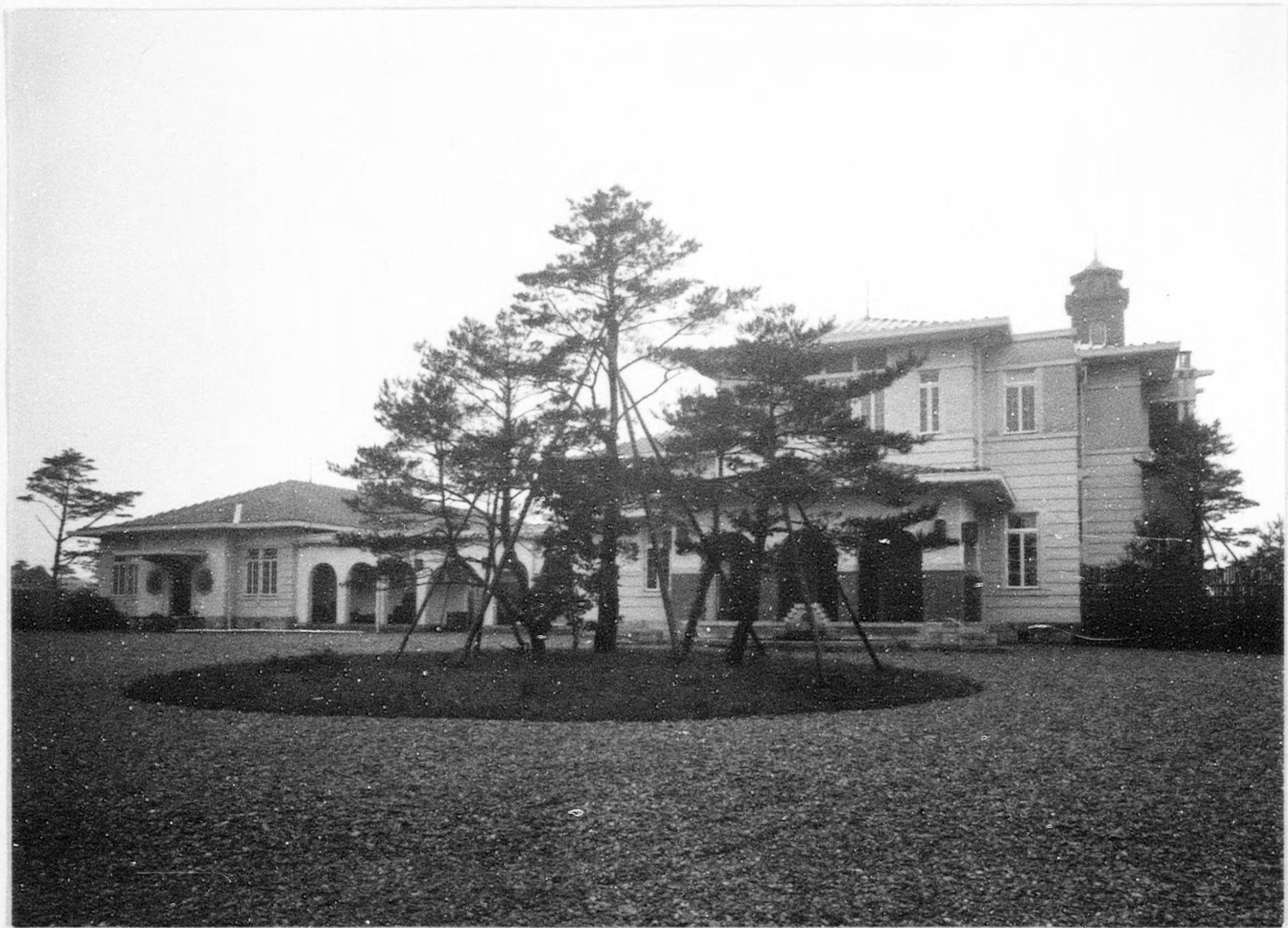
NASU IMPERIAL VILLA