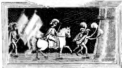
CHARLES VIII, OF FRANCE.