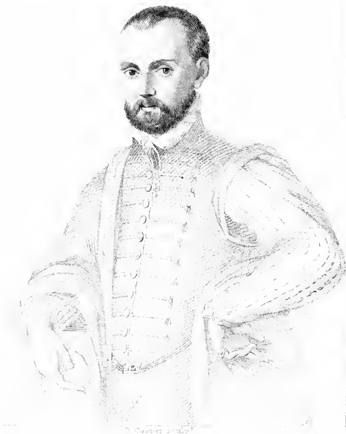
B. Cooper sculp