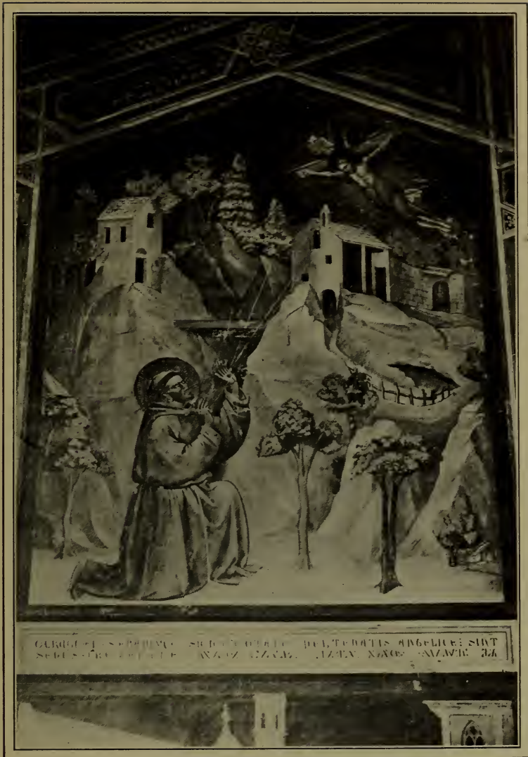
SAINT FRANCIS RECEIVING THE STIGMATA. From the fresco by Niccolo di Pietro Gerini.