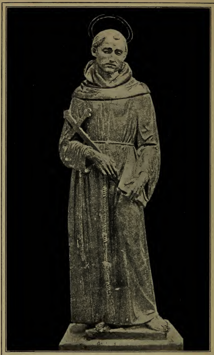
SAINT FRANCIS OF ASSISI. From the statue by Andrea della Robbia.