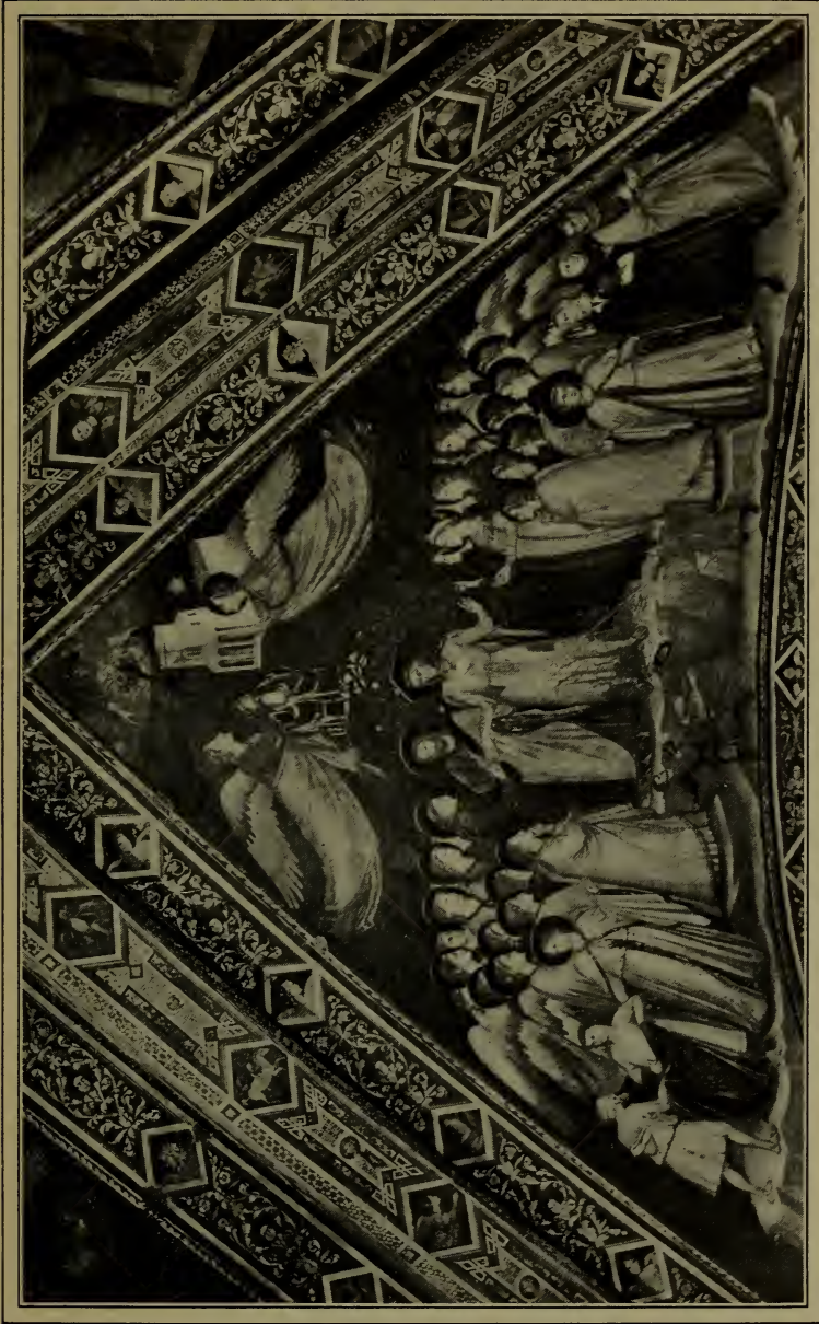
THE ALLEGORY OF POVERTY. (Saint Francis Wedded to Poverty by Christ.) From the fresco by Giotto.