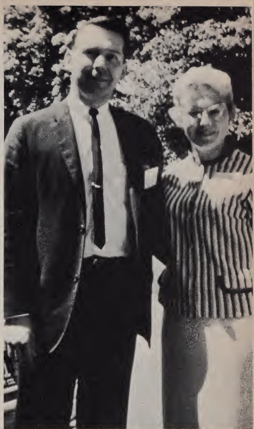
Dr. Paul E. Carlson and his wife, the former Lois Lindblom.

Mrs. Carlson returned to the United States in January, 1965, and is living with her two children in Torrance, California. Nevertheless, Dr. Carlson's work carries on. Today four doctors are trying to care for the health needs of more than 1,000,000 persons in the Congo's Ubangi Province. The Belgian Government had built a medical installation that cost more than $500,000 just before granting independence to its colony in 1960, but it was never occupied. Dr. Carlson had his eye on this plant, which can accommodate 220 patients in wards and one-room apartments. Just before the rebellion he had begun negotiations with the Government concerning its use.