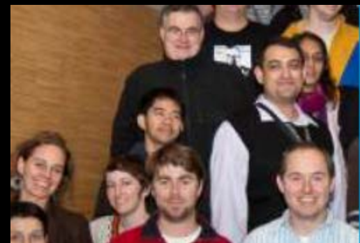
GLAMcamp Amsterdam participation December 2-4