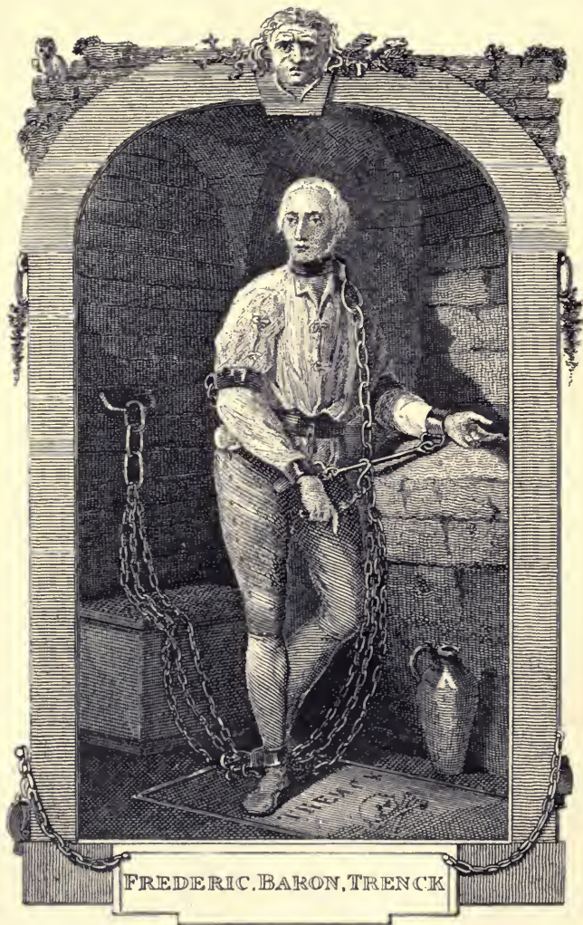
FREDERIC. BARON, TRENCK