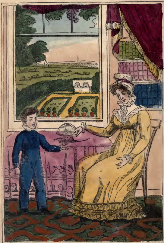
Mrs. Clifford relating to her son Alfred, the history of the Field-Mouse.