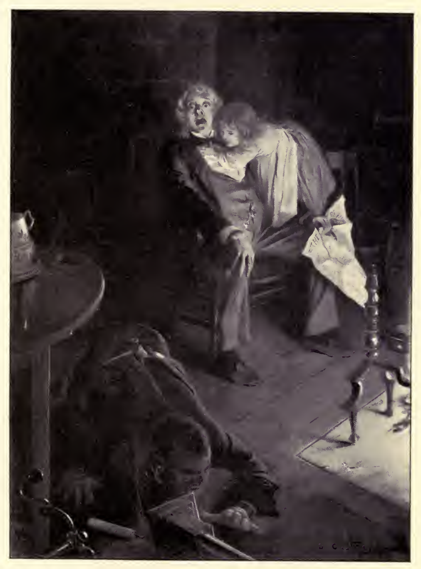
"Drinkwater Torm fell sprawling on the floor."