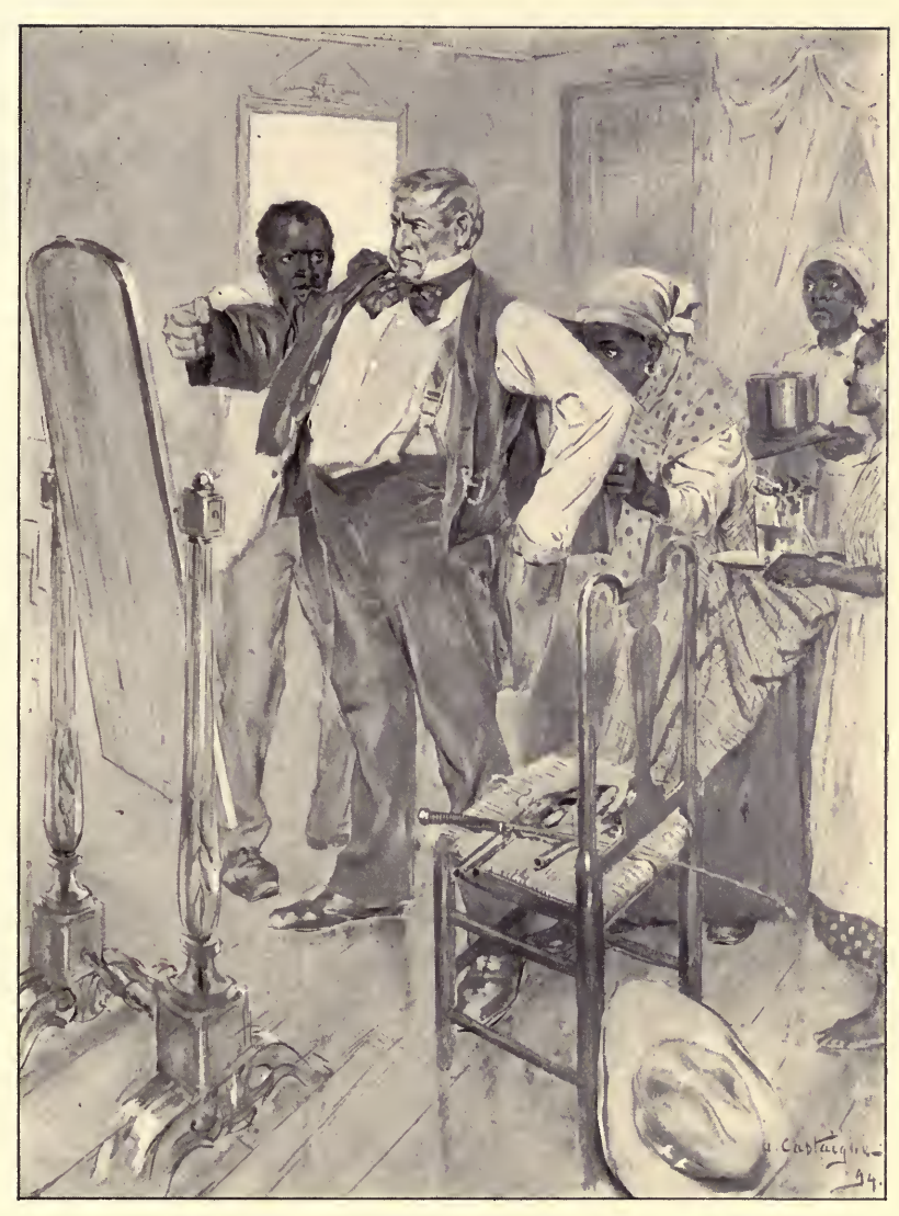
"He made Torm, Charity, and a half-dozen younger houseservants dress him."