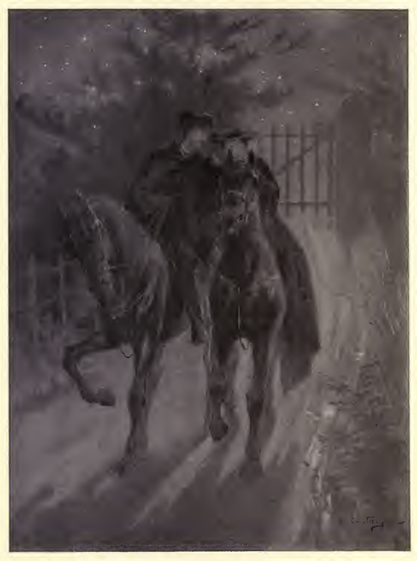
"The young man found it necessary to lean over and throw a steadying arm around her."