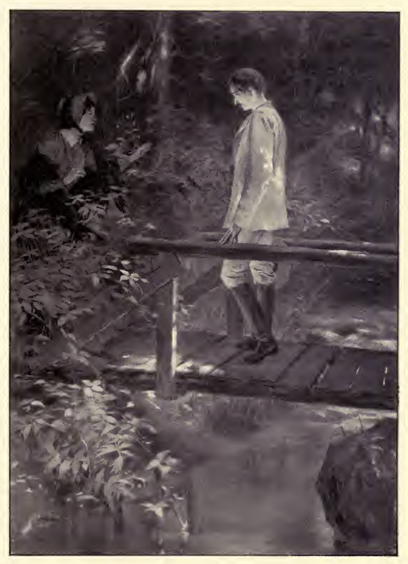
"There he was standing on the bridge just before her."