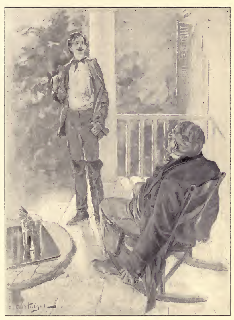
"'I will!' he said, throwing up his head."