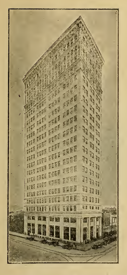
THE HOME OF THE AMICABLE LIFE INSURANCE CO. COMPLETED 1911