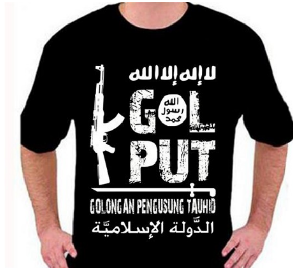
Figure 1. ISIS T-shirt once sold on Facebook

For some time, Facebook users could purchase black ISIS T-shirts until accounts that were selling them were shut down. Shirts contained the ISIS logo, an AK-47, and Arabic writing that was also translated into English. Source: “Isis Souvenir Gift Shops Shut Down by Facebook,” Telegraph.Co.Uk , 25 June 2014, http://www.telegraph.co.uk/news/worldnews/middleeast/iraq/10925871/Isis-souvenir-gift-shops-shut-down-by-Facebook.html .