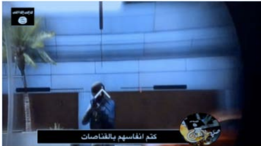
Figure 9. ISIS video game

An image from ISIS' first-person shooter video game. Source: "The Islamic State of Iraq and the Levant: Branding, Leadership Culture, and Lethal Attraction," National Consortium for the Study of Terrorism and Responses to Terrorism , November 2014, 32.