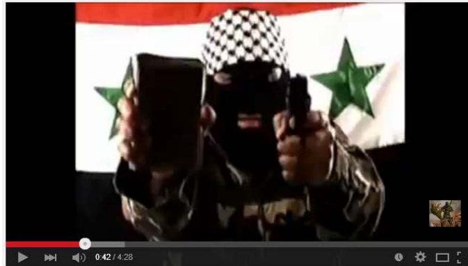
Figure 2. Masked Man with Quran and gun from Dirty Kuffar video

Screen capture taken from the Dirty Kuffar video.