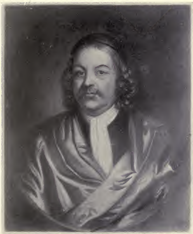
GOVERNOR SIMON BRADSTREET.