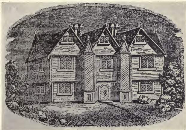
THE SALEM HOUSE ( from an old print ).