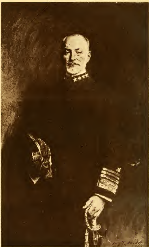
ADMIRAL SIMS By Irving R. Wiles, N.A.