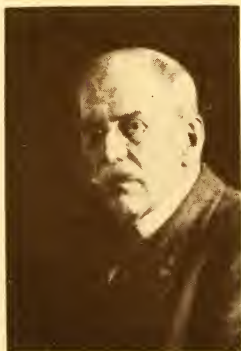
Joseph De Camp