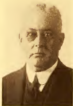
Edmund C. Tarbell