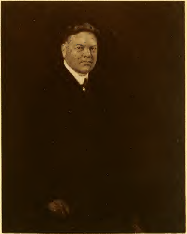
HERBERT HOOVER By Edmund C. Tarbell, N.A.