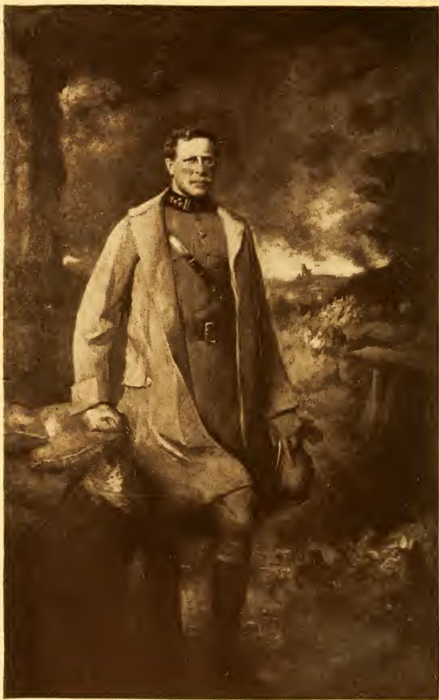
HIS MAJESTY ALBERT I