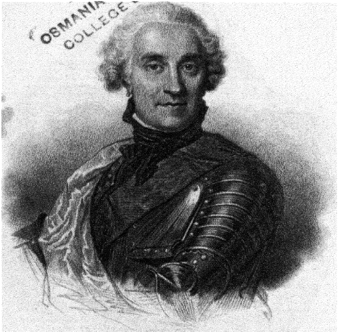
Maurice de Saxe.