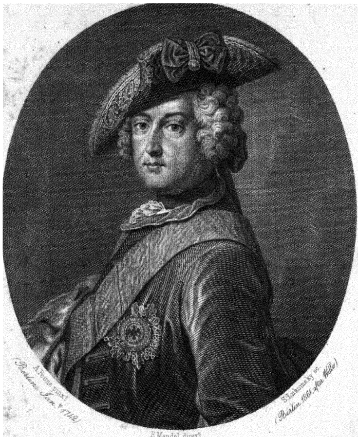
FRÉDÉRIC·II·ROI DE PRUSSE ELECTEUR DE BRANDEBOURG