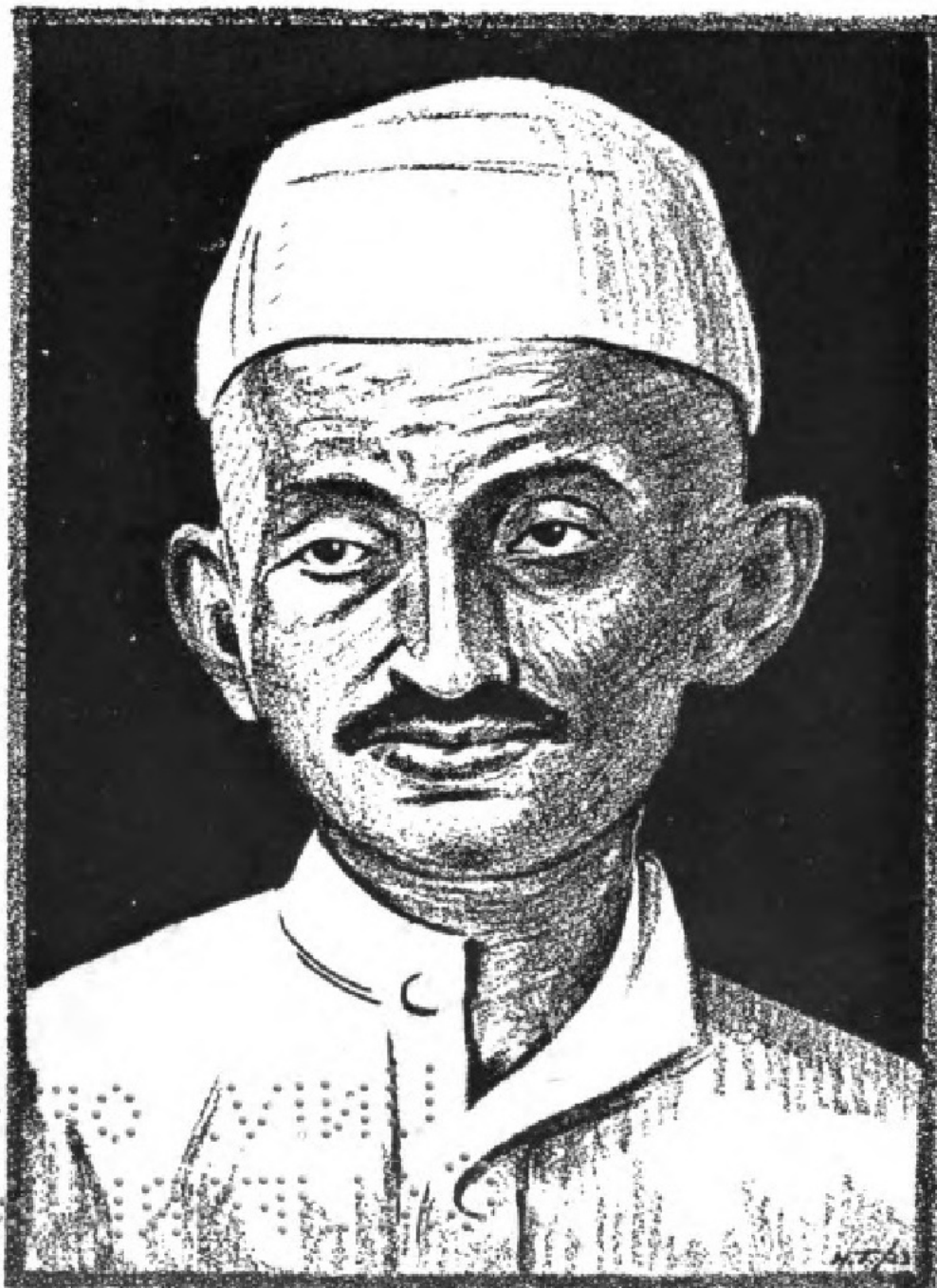
MOHANDAS KARAMCHAND GANDHI