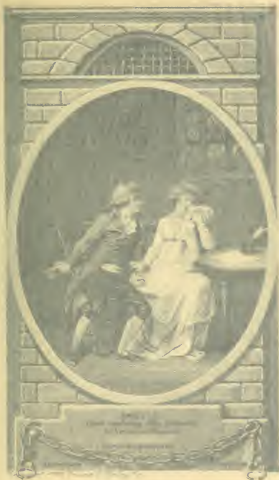
Custom and veris had just of soon as interview between Mr. Dodd and Miss Matthews, and their meeting now in a circumstance a plain affected look of them with an equal surprise.