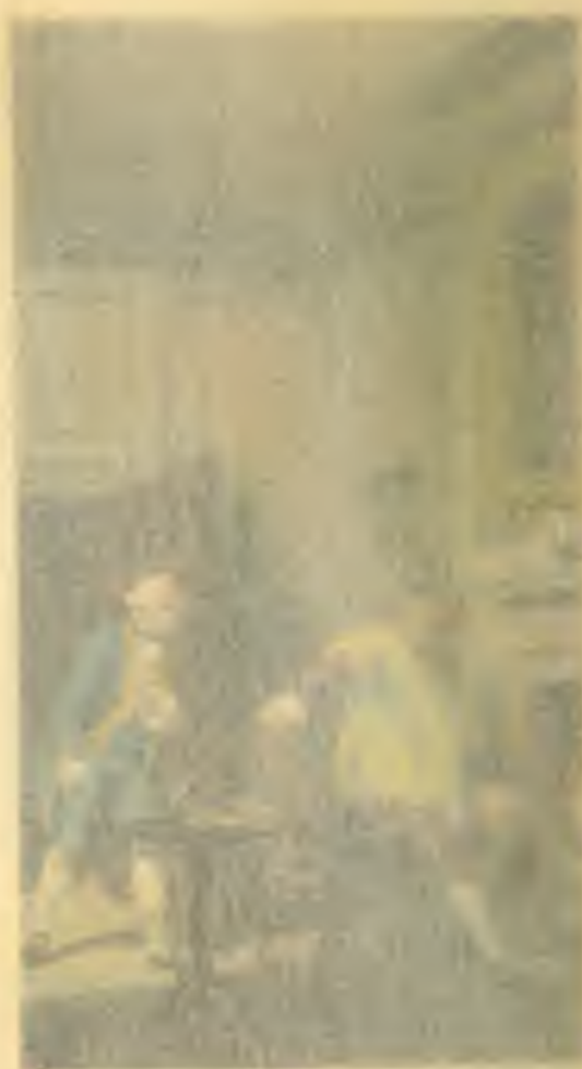
A woman study by the artist, most telling and expressive. I found this sketch in his notes (somehow) among his papers. I cannot remember the name of the woman.