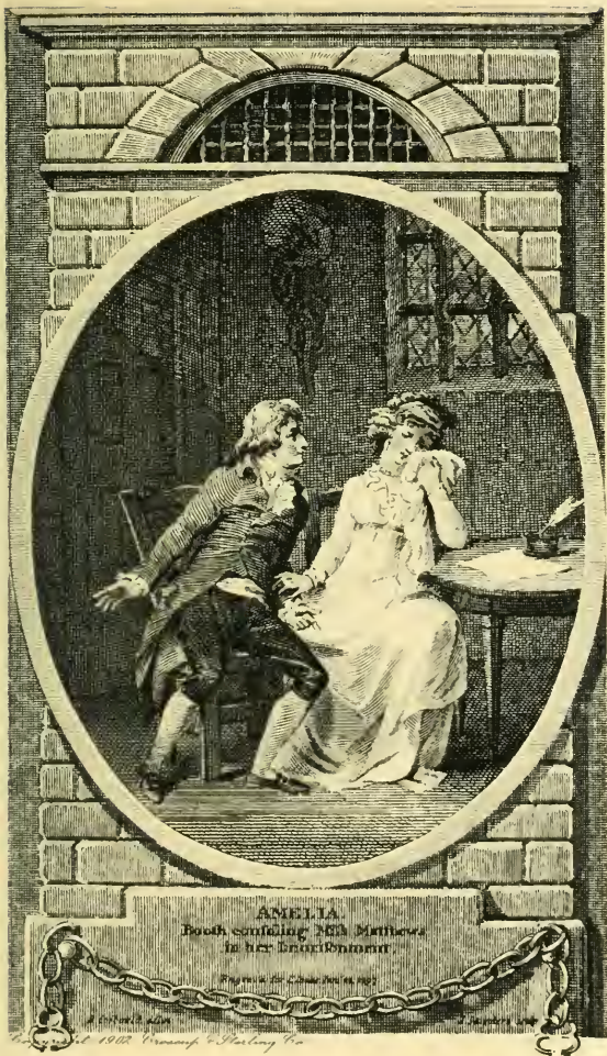
AMELIA. Booth consulting Miss Matthews in her Enquiry.