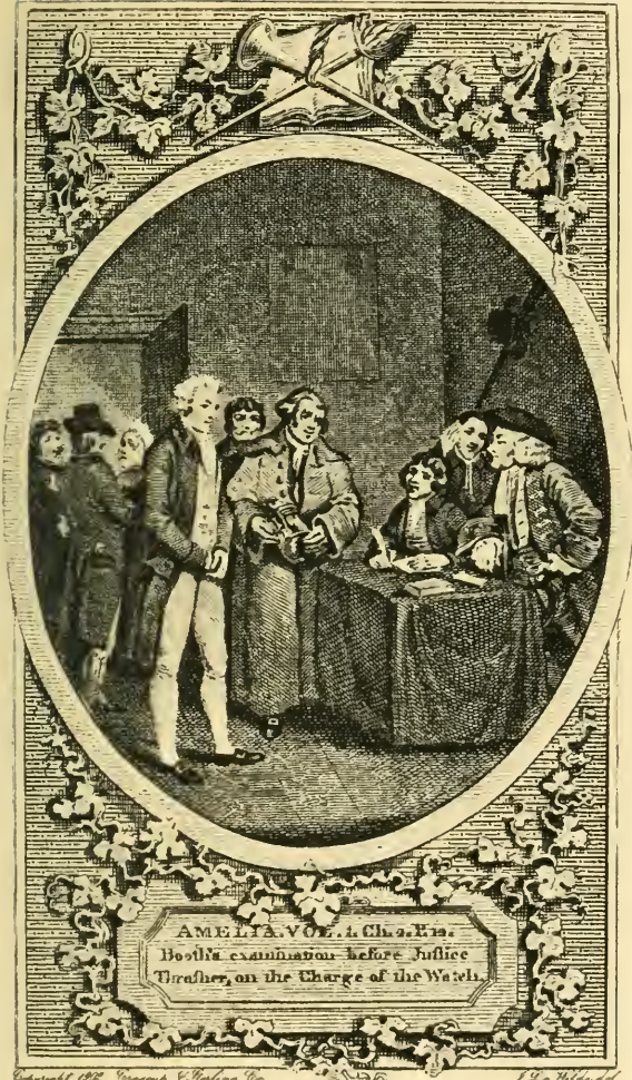
AMELIA, VOL. 4. CHAP. 13. Booth's examination before Justice Thrasher, on the Charge of the Wages.