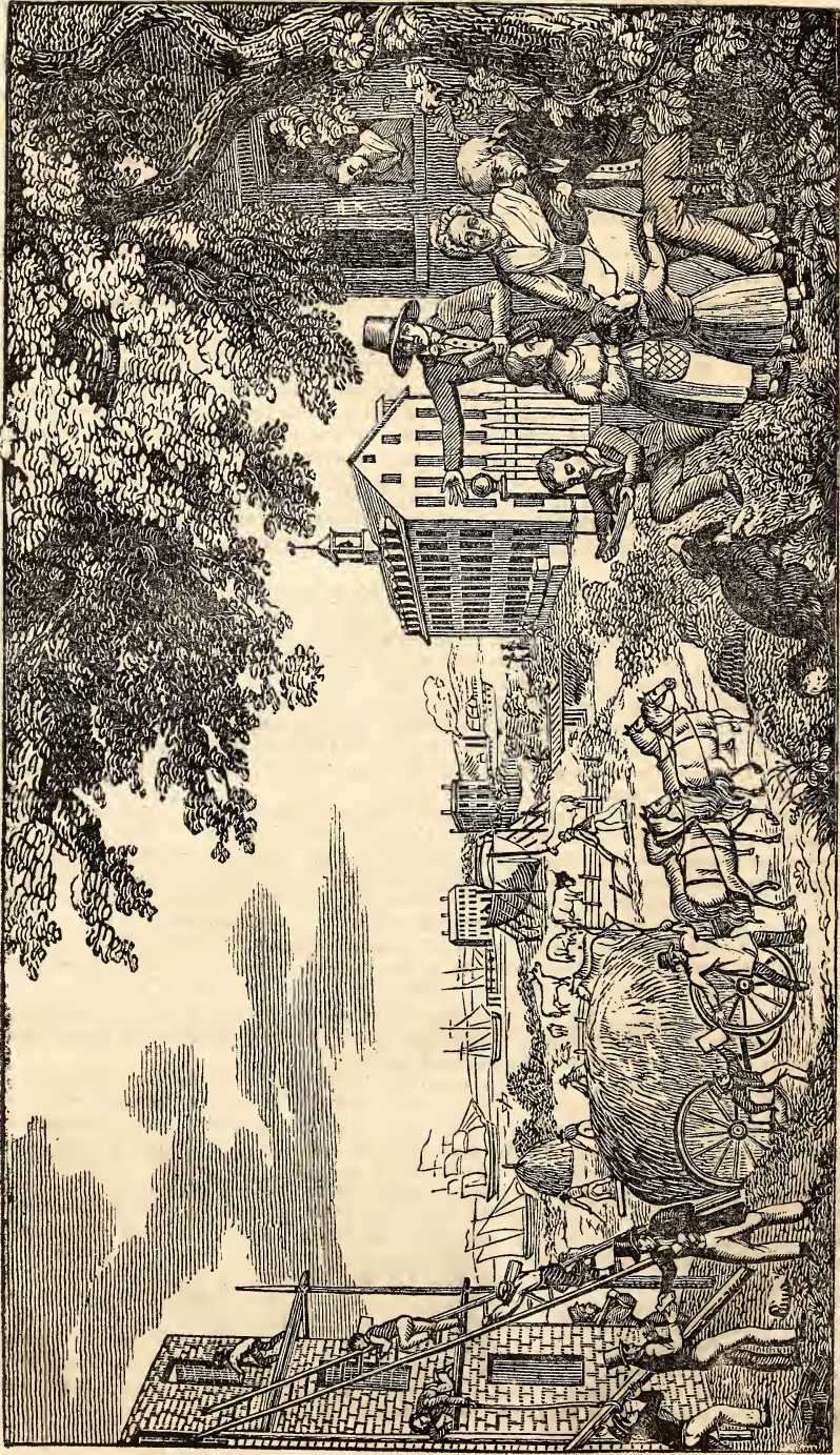
HARRISON AND PROSPERITY.