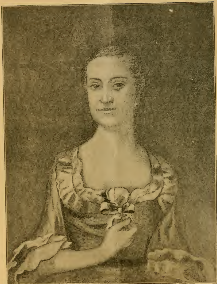
MRS. PENELOPE BARKER.

PRESIDENT OF THE EDENTON TEA-PARTY OF 1774.