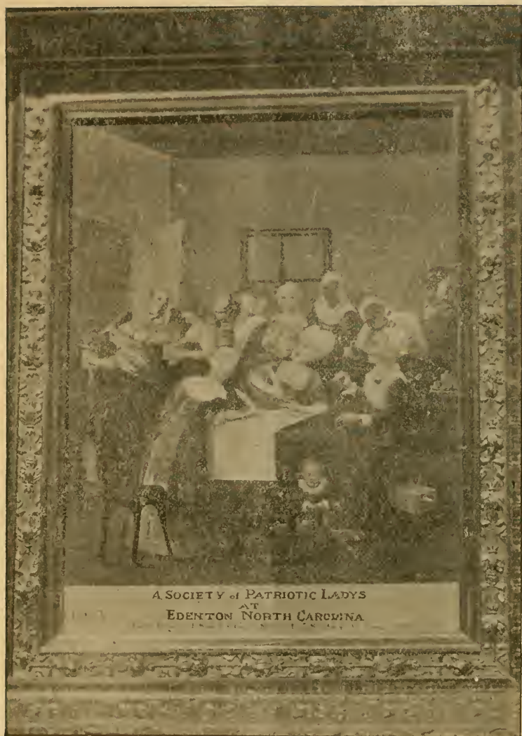
FROM AN OIL PAINTING OF THE ORIGINAL FRAGMENTS, PRESENTED THE VIRGINIA DARE MEMORIAL ASSOCIATION BY THE AUTHOR, AND NOW IN THE STATE LIBRARY AT RALEIGH, N. C.