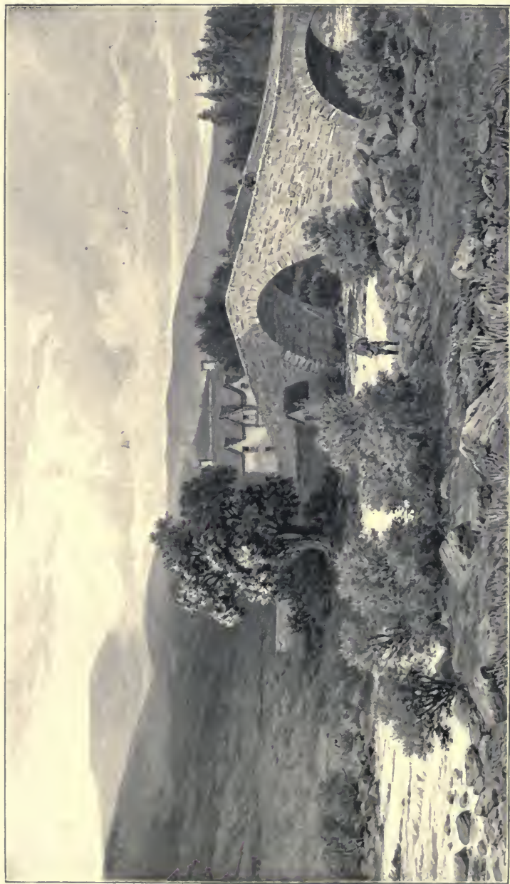
TUMMEL BRIDGE AND INN, PERTSHIRE