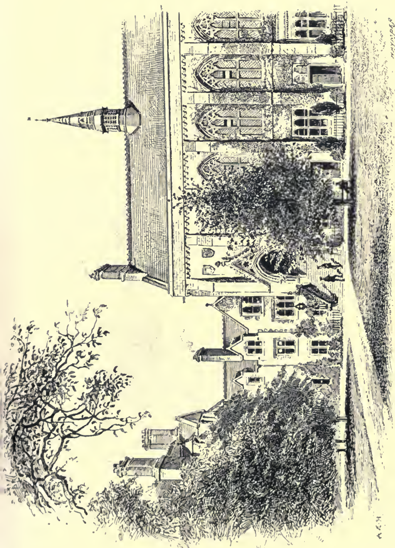
PART OF THE NEW HALL, BALLIOL COLLEGE