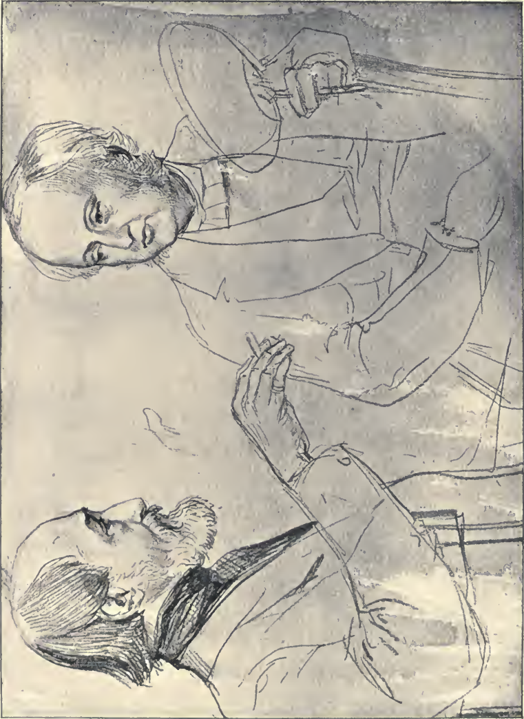
J. MAZZINI AND PROFESSOR JOWETT