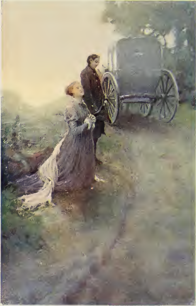
HORTENSE KNEIT DOWN TO THANK GOD TEARFULLY FOR HAVING PERMITTED HER TO SUCCEED SO FAR IN RESCUING HER SON

Muhlbach "Queen Hortense," Vol. Twelve, p. 33