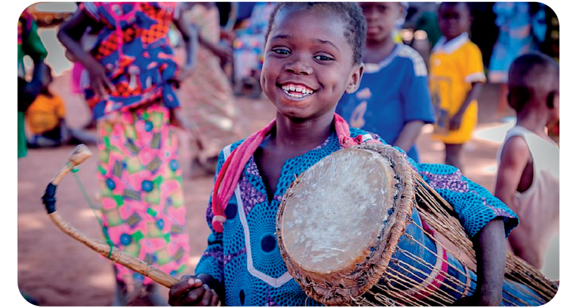
Children learning to play the local drum in northern Region of Ghana

DOCUMENTING THE WORLD'S INTANGIBLE CULTURAL HERITAGE