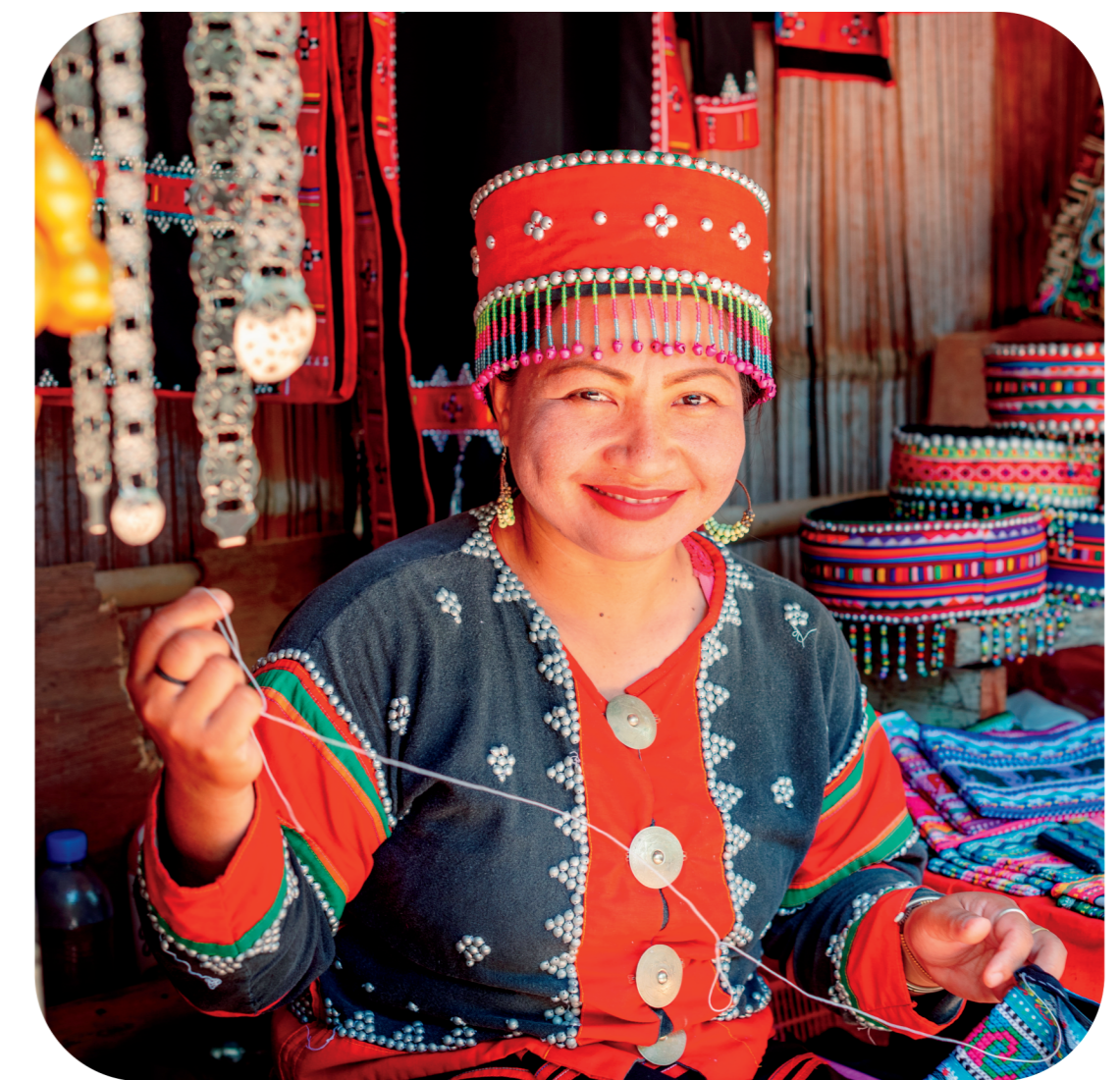
Karen tribal woman in traditional clothes by Varvara Kless-Kaminskaia

Wiki Loves Folklore is an international photography contest that celebrates the rich tapestry of folk culture from diverse regions around the globe. Our focus is on preserving and promoting the essence of intangible cultural heritage through the art of photography.