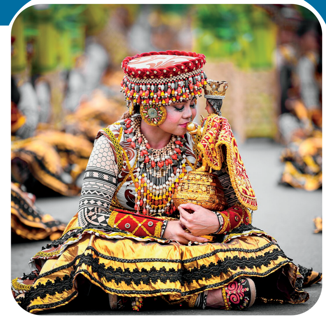
Lumad basakanon by Kliencyril08