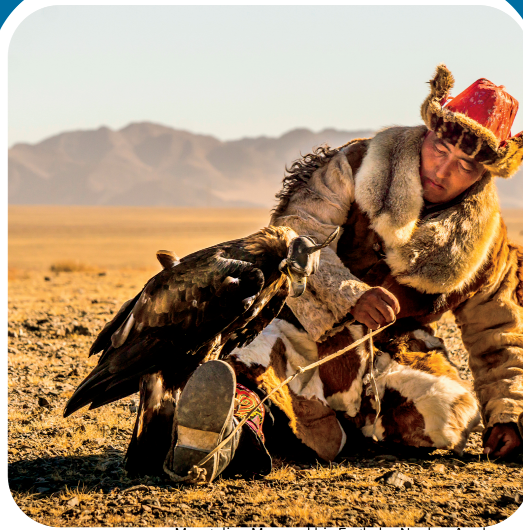
Mongolian Man and his Eagle