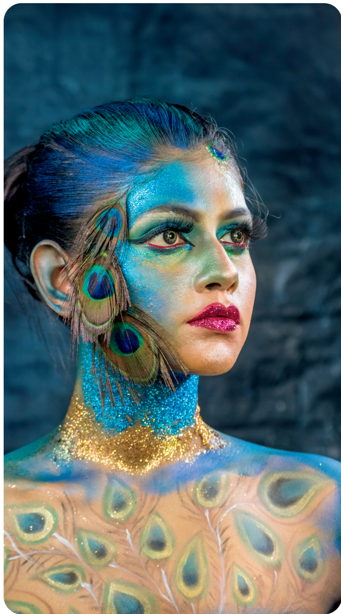
Peacock dance performer