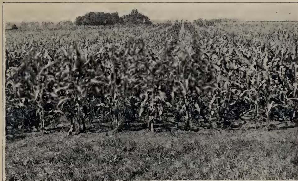
Detasselled Hybrid Seed Field on The Funk Farms. The two detasselled rows are the Hybrid seed producers and are the only rows from which seed is harvested. No seed is saved from the single row (male parent) with tassels.

For commercial hybrid seed two single crosses, with no common parent, are combined to produce what is known as double cross seed. Here again the crosses must be grown and compared in order to evaluate their fitness for actual farm use. We emphasize again that not all recombinations of inbred strains are high yielding and desirable in other respects.