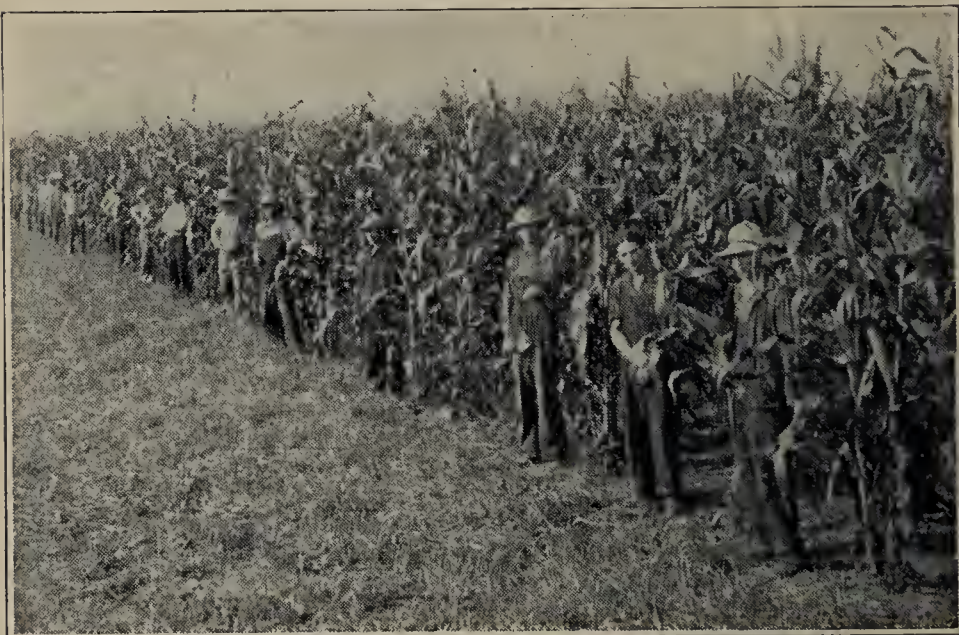
Men Detasselling Corn on Funk Farms. All tassels are removed from female parent or seed producing rows before any pollen is shed. Another strain in field supplies pollen. Seed is taken only from detasselled rows.

The Pure Line Method of Corn Improvement makes possible the accurate evaluating of both female and male parent because, instead of promiscuous, random pollination, very carefully controlled pollination is practiced with both parents definitely known.