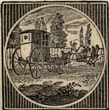
Going full speed to the Races.