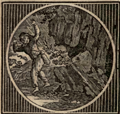
A Traveller overtaken by a storm.