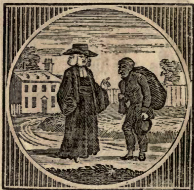
The Minister and Chimney-sweep.