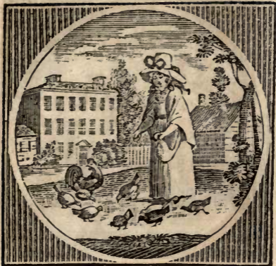
Feeding a numerous family.