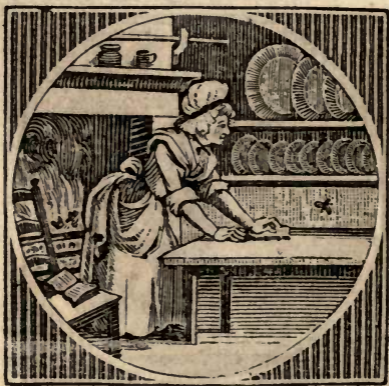
Making the birth-day cake.