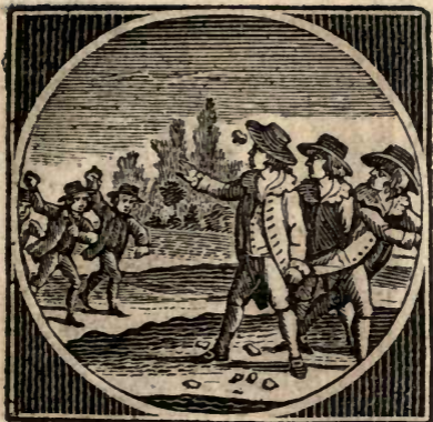
The danger of passion.