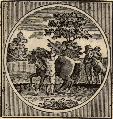
The little Pony and his rider.