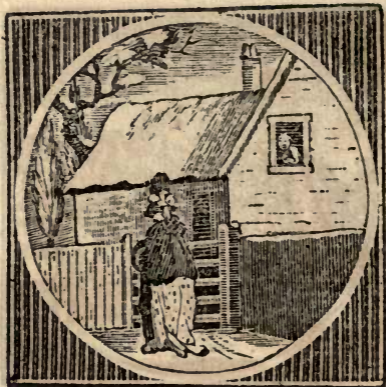
Lady Bountiful visiting the sick.