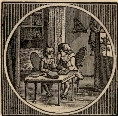
Consultation over a Plum Cake.