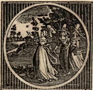
Never destroy any thing wantonly.