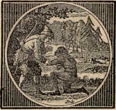
Crusoe rescues his man Friday.