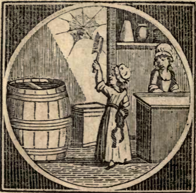
The industrious little Shopkeeper.