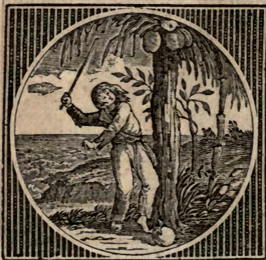
Discovery on the uninhabited Island.