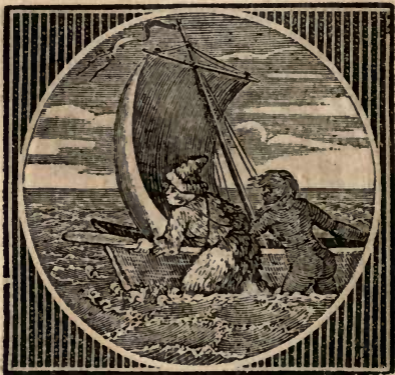
Robinson Crusoe and his man Friday.