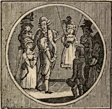
The little Automaton Lady.