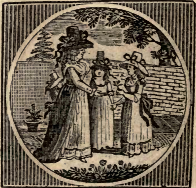
Taking a walk in the Garden.