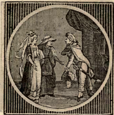
Just arrived from Persia.