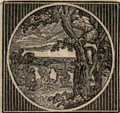
Robinson Crusoe firing at the Savages.