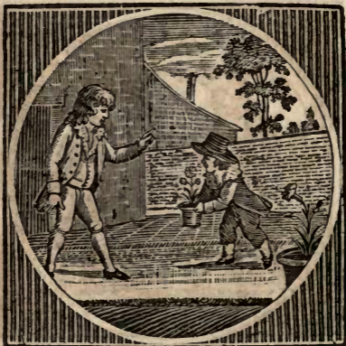
Only see Brother! my Clove is in bloom.