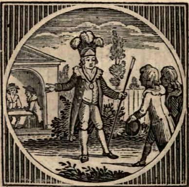
A visit to the Indian Juggler.