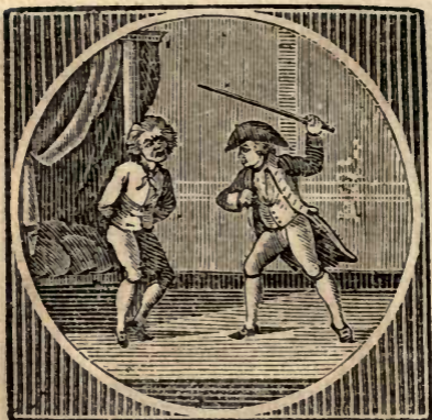
Inhuman mode of punishment.