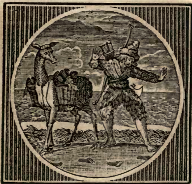
Crusoe discovers the print of a foot.