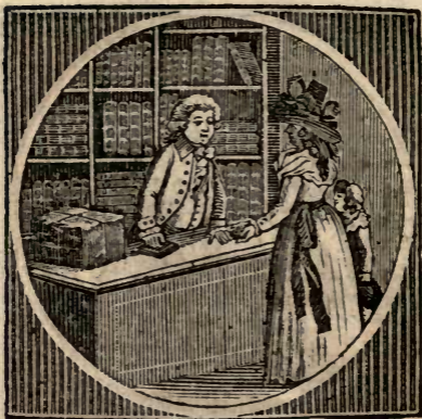
Purchasing a new-year's gift.