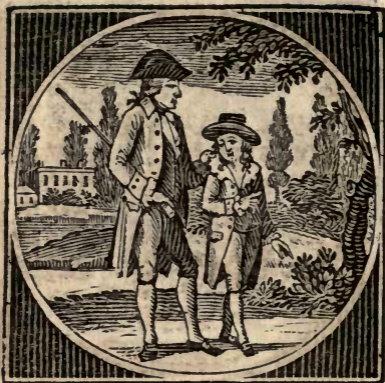
Taking a walk with papa.