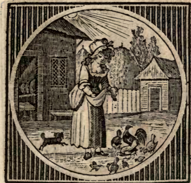
Little Sally feeding her poultry.