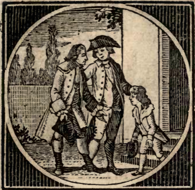
Master Tom introduced to his Uncle.