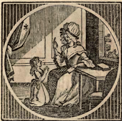
Remember God is every where.