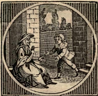
Poor woman, Ma has sent you sixpence.