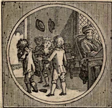
The idle and disobedient Boy.