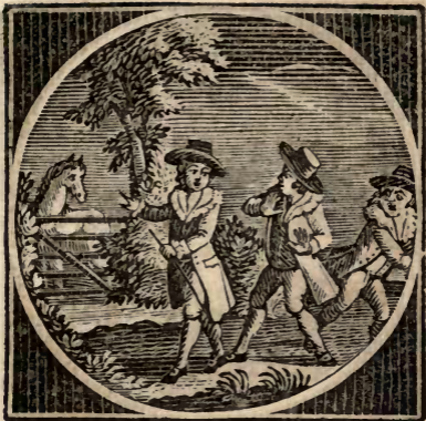
Catch my Pony.