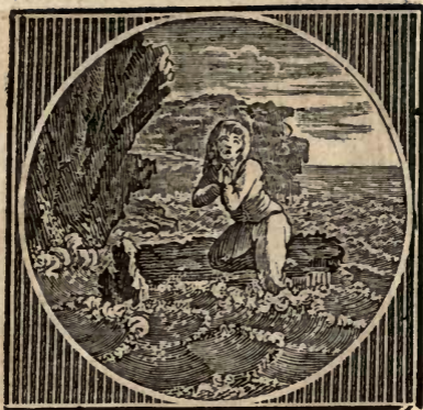
Crusoe cast on an uninhabited Island.