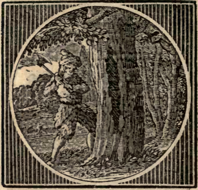
Crusoe preparing to build a House.