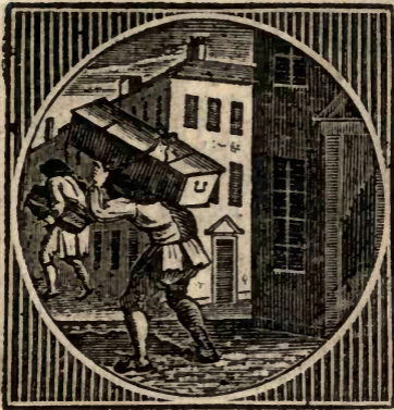
Poor man! what a heavy load.