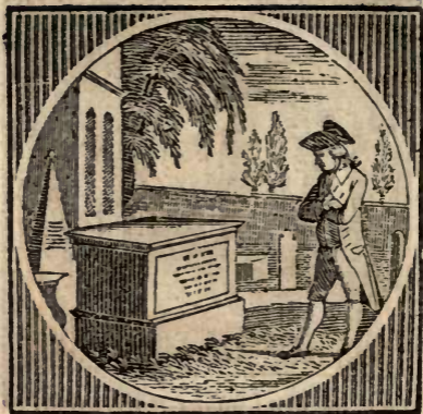
Reflections in a Churchyard.