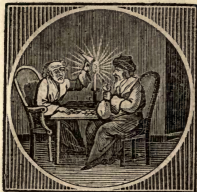
A covetous man is never contented.