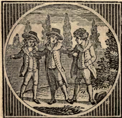
Frederick preventing blows.