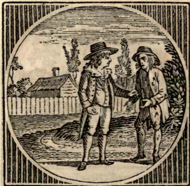
Heaven bless you! young Gentleman.