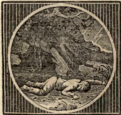
Fatal effects of Lightning.