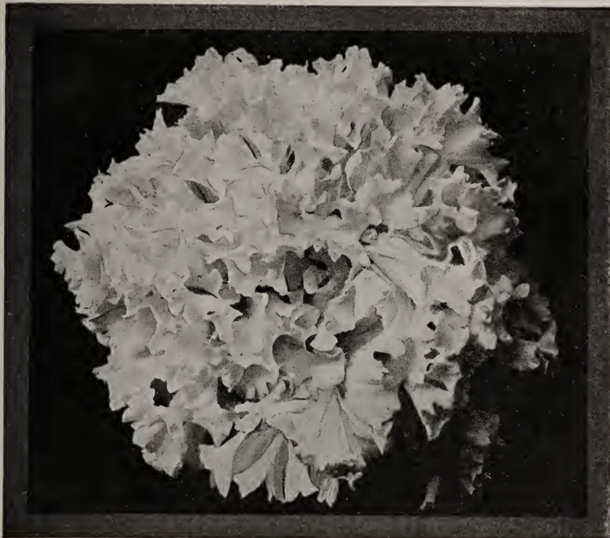
Type of Petunia A. B. C. "De Luxe" Dwarf Large-Flowering Double Mixture Exceptional for Pot Plants and Bedding

Worth-While "Profit-Providers" for the Florist Grower