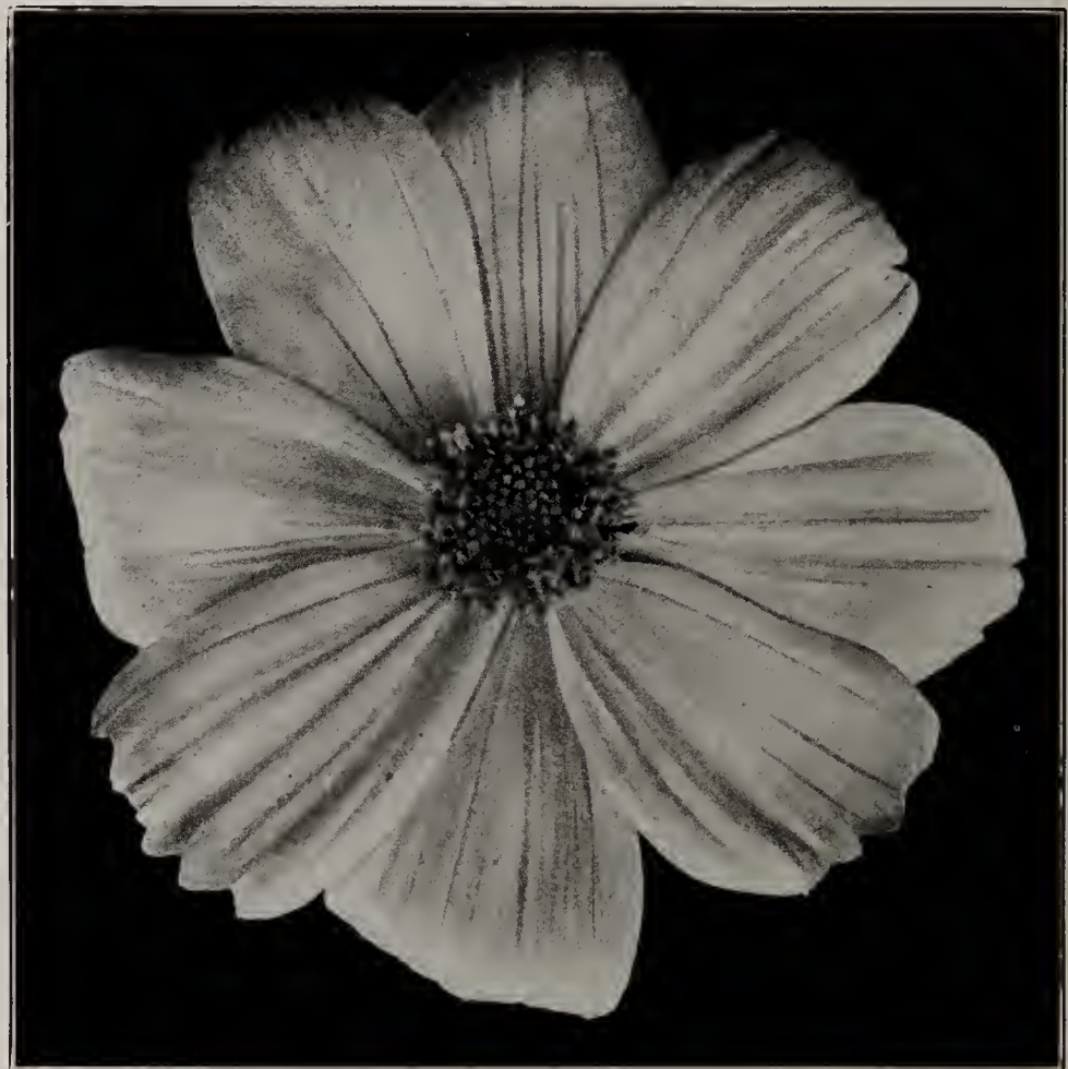
New Cosmos "Sensation"

Crimson Star. Richest crimson with white petals. Tr. Pkt.....75c 1/4 oz.....$2.75