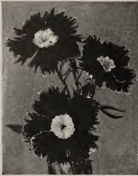
New Dianthus Laciniatus Splendens