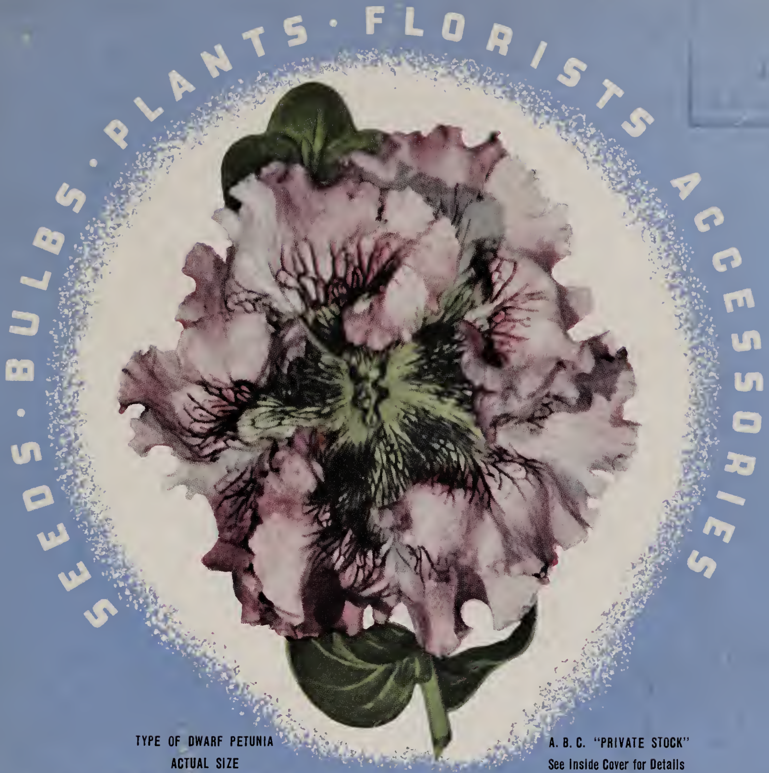
TYPE OF DWARF PETUNIA ACTUAL SIZE