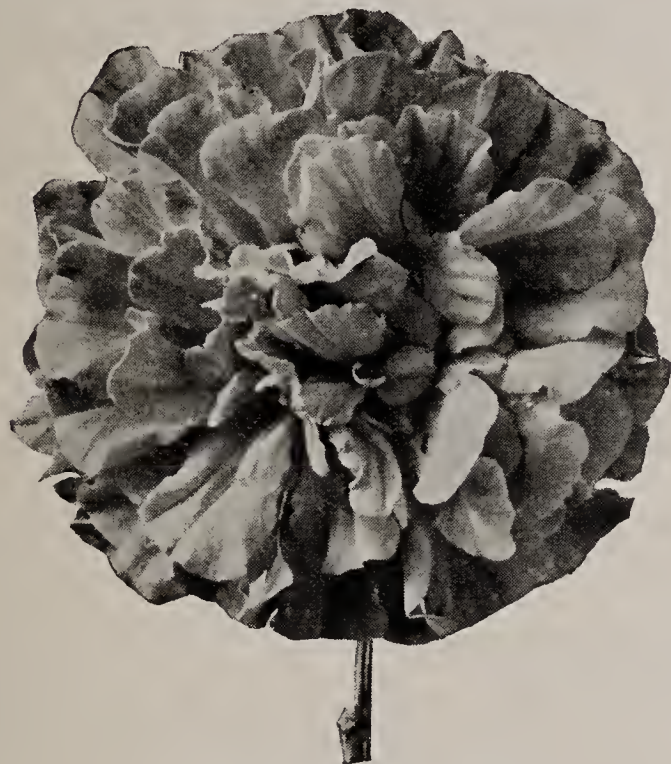
Marigold "Guinea Gold"

Tr. Pkt. . . . . 30c 1/4 oz. . . . . 50c Oz. . . . . $1.50 4 oz. . . . . $5.00