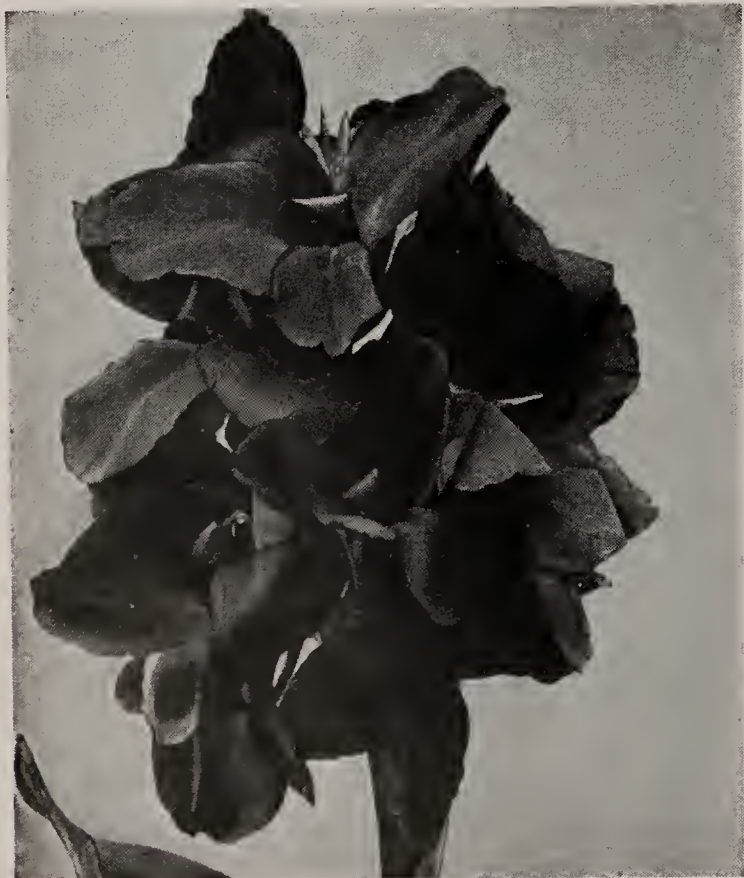
Canna, The President

Separate Named Varieties. 100.....$13.50 1,000.....$125.00 Named Varieties, Mixed. 100..... 11.00 1,000..... 100.00