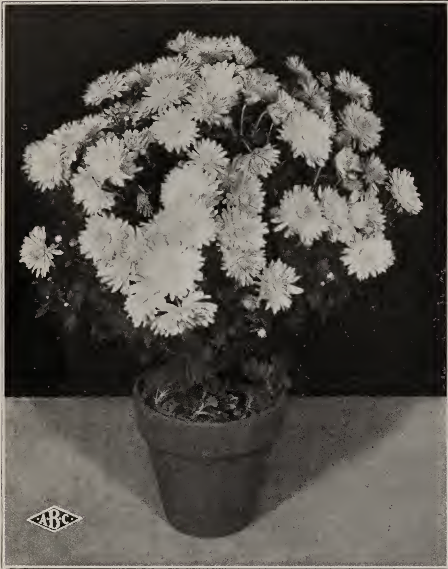
New Hardy Chrysanthemum "Pink Cushion" (See description below)