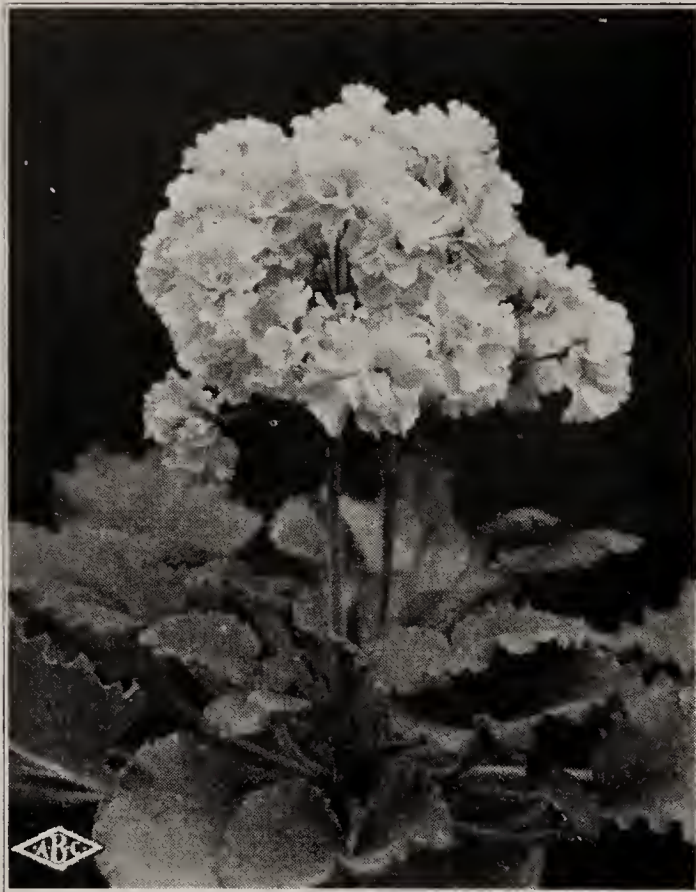
New Double Flowered Primula Obconica "Portland Beauty" Provides a Very Worth-While Pot Plant (New Crop Seed Ready in July)