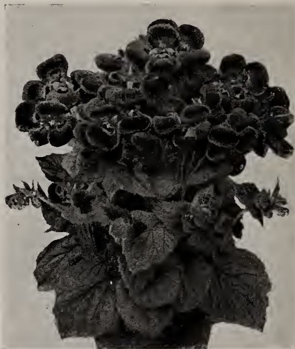
New Calceolaria "Indian Prince"

Rugosa Hybrids Mixed. Comparatively small flowers. Provide pot-plants and desirable for cutting. Tr. Pkt.....$1.00