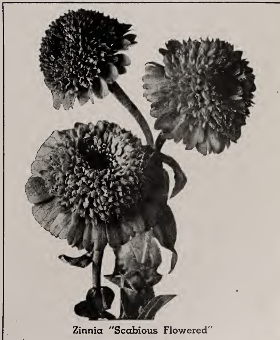
Zinnia "Scabious Flowered"

SEE PREVIOUS PAGE FOR CONTINUED LIST OF ZINNIAS