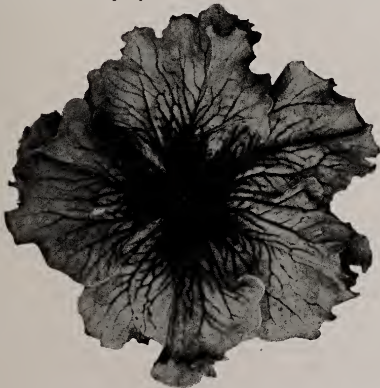
Petunia Extra Dwarf Giant Single Fringed "The Vein"

Striking color. Ground color white with a touch of lilac, conspicuously veined with aster violet which intensifies toward center. Extremely beautiful. Habit of plant is just like others. Quite a new and distinct color in this group. Tr. Pkt. . . . . $1.00