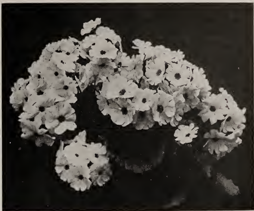
Primula Obconica, M and M Type (Note Size of Flowers)