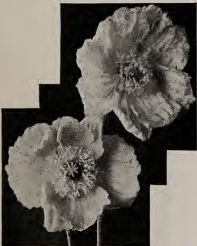
Iceland Poppy, "The Empress" Another Desirable New Variety for Cut Flowers

We cordially recommend this beautiful little Solanaceous plant as an admirable subject for greenhouse decoration. Not more than 4 to 6 inches high, it forms a cushion of elegant light green foliage from which emerge corymbs of salver-shaped flowers of a delicate lavender hue, 1 to 1 1/4 inches across, adorned with a clear yellow eye. Of highly ornamental effect, we are sure that it will prove a gem for the conservatory, and in suitable situations should do well in the open air. We may add that the bloom is very profuse and of a long-lasting character. It is a perennial, but seeds sown in Spring will bloom the same year. Award of Merit, R. H. S., 1933. Tr. Pkt.....75c