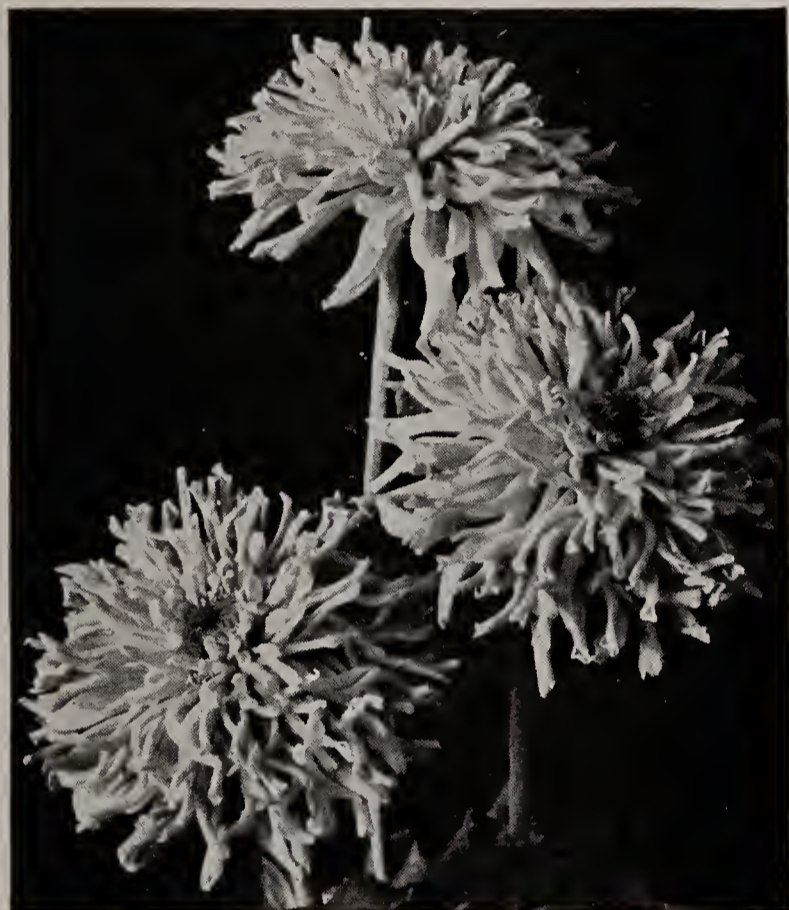
Zinnia New Fantasy Mixture