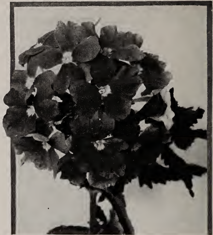
Verbena (Hybrid) Beauty of Oxford