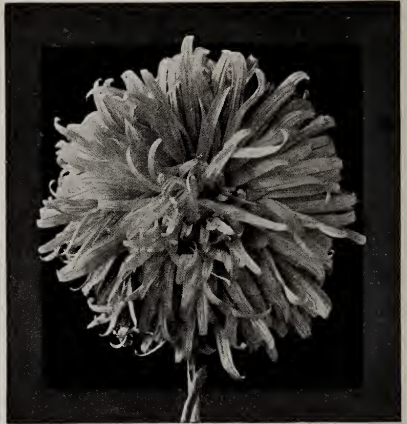
Aster—Improved Giants of California Also known as "Chicago Giant Beauty"

(About one-half natural size — see next page)