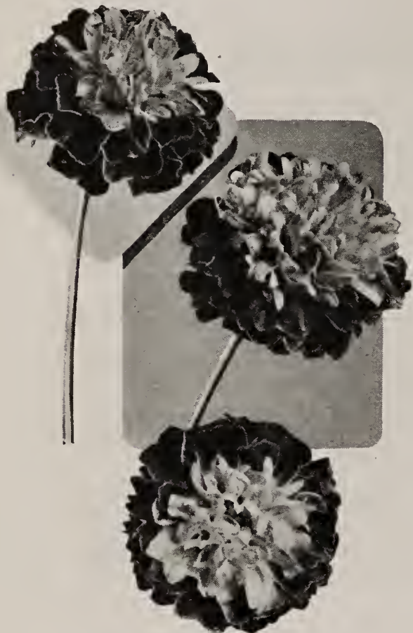
New Marigold "Harmony" A Desirable Annual for Cutting

A perusal of the following pages will no doubt suggest many other desirable cutflower annuals as well as PERENNIALS.