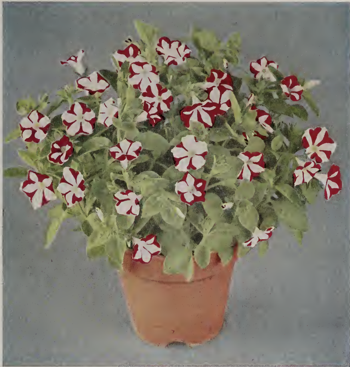
Petunia Hybrid Adora

The plant, as shown in the above picture, is bushy and seldom grows more than 10 inches, making a shapely ball form and is literally smothered with small sized, beautiful flowers. The color of flowers is the most lovely rosy carmine with pure white star, which regularly marks every individual flower. Tr. Pkt.....50c 1/8 oz.....$3.00 1/4 oz.....$5.00