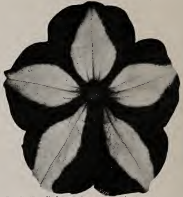
A. B. C. Re-Selected Howard's Star Petunia