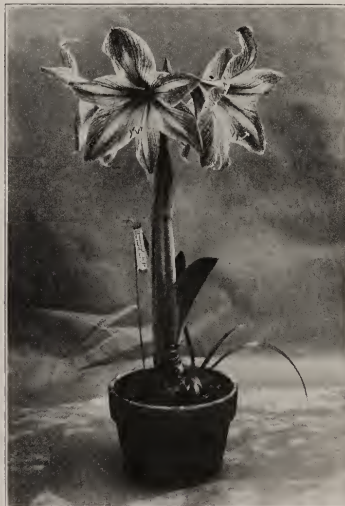
Amaryllis, Giant American Hybrid

Amaryllis find a ready sale to the public in dry bulb form. Their extreme ease of culture commends them to every flower lover, coming into flower within a short period of being potted. Likewise they are admirable for florists' show window decoration and pot plant sales.