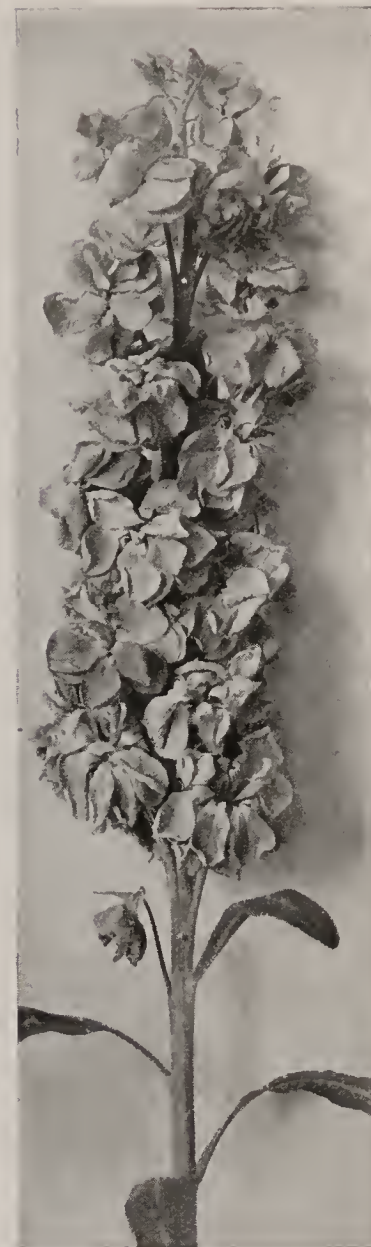
Stocks, Ball Branching or Column

OUR STRAIN OF IMPROVED BISMARCK STOCKS CANNOT BE EXCELLED