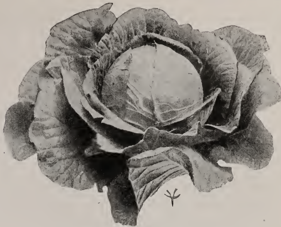
Cabbage "Marion Market" (Yellows-Resistant)

NOTE: Where not otherwise quoted, we supply 1/2 oz. at ounce rate.