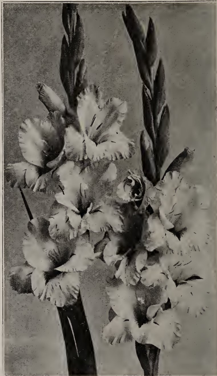
Type of Kunderd "Glory Strain" Gladiolus offered opposite.