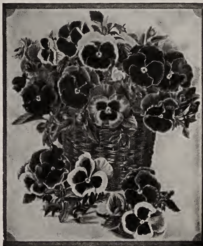
A. B. C. "De Luxe" Pansies