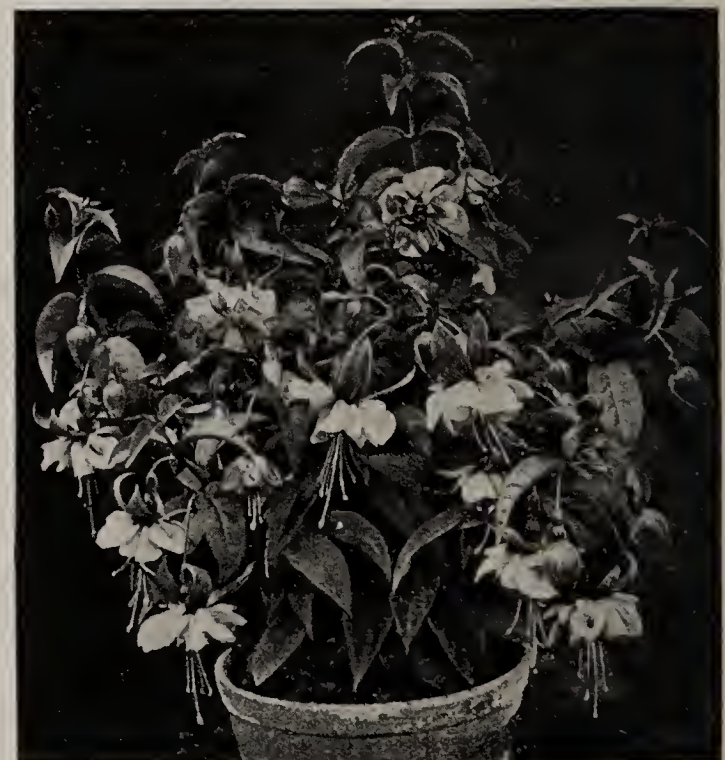
Double Early Dwarf Fuschia

For Standard Varieties of Florists' Flower Seeds Please Refer to Alphabetically Arranged Pages in This Book