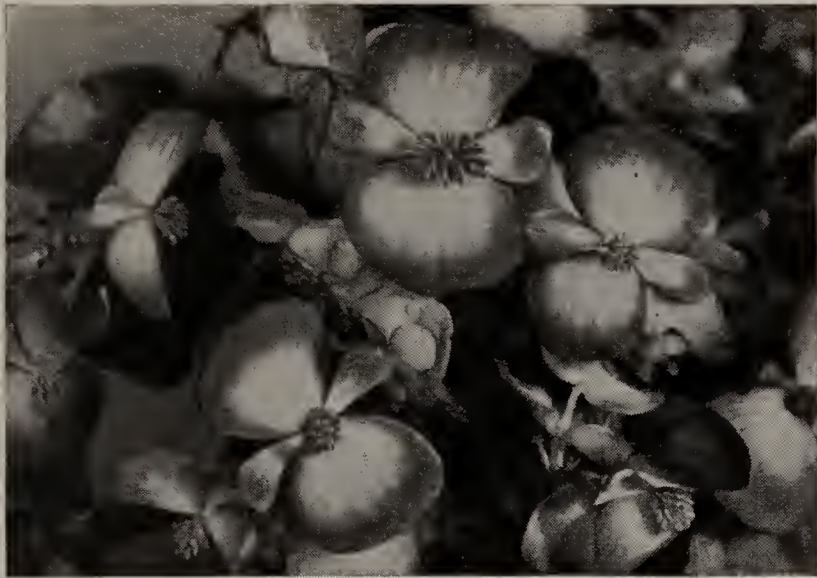
New Begonia Semperflorens Marginata "Elegant"