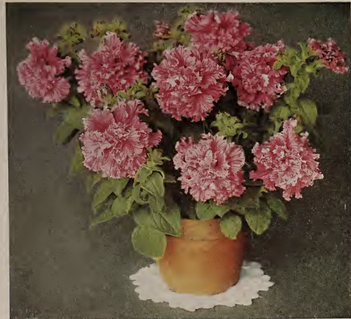
New Double Flowering Fringed Petunia "World Beauty" Named and Introduced by the American Bulb Co.