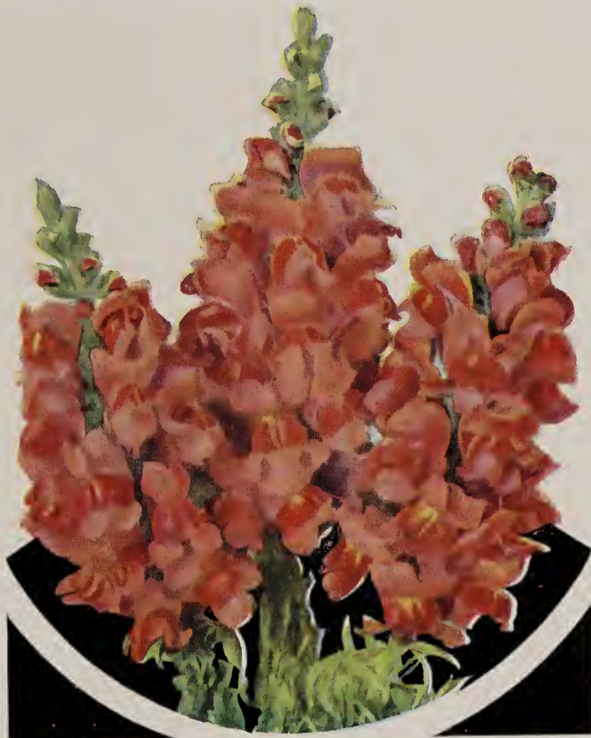
Antirrhinum Nanum St. George

Tr. Pkt. . . . . 35c ¼ oz. . . . . $1.00 Oz. . . . . $3.50