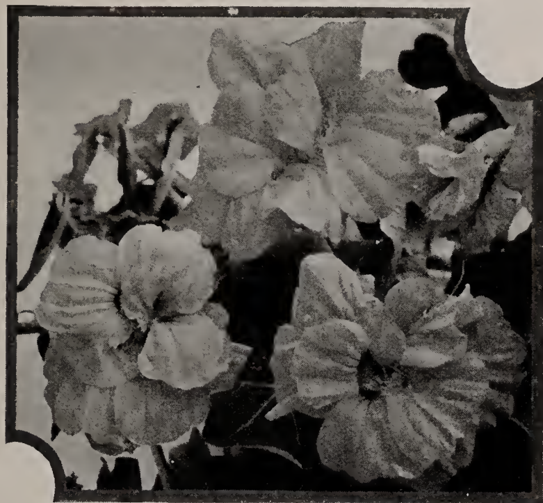
Nasturtium Bodger's Double

Sweet Scented Orange Gleam. Desirable for cutting