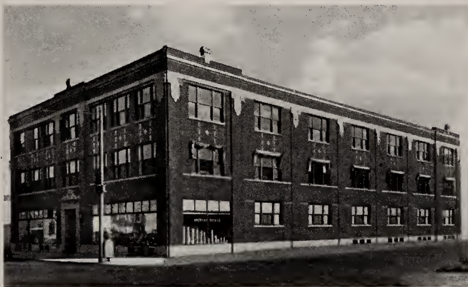
Illustration showing view of our new building in Chicago, occupying approximately 50,000 square feet of space, specially constructed to carry on with our highly specialized lines and assure our clients prompt service.

EARLY ORDERS WILL, WE BELIEVE, PROVE MUTUALLY ADVANTAGEOUS.