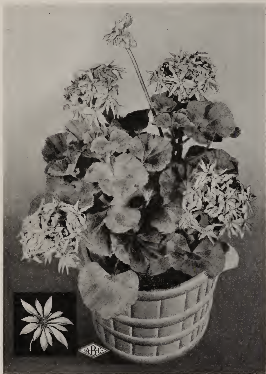
New "Poinsettia" Geranium

The Poinsettia Geranium is ideal as a pot plant, being constantly in flower the year around. May also prove to be desirable for bedding. The individual florets resemble miniature Poinsettias; the clusters are of good size and prolifically produced. The flowers are bright scarlet in color and produced well above the bright green foliage.