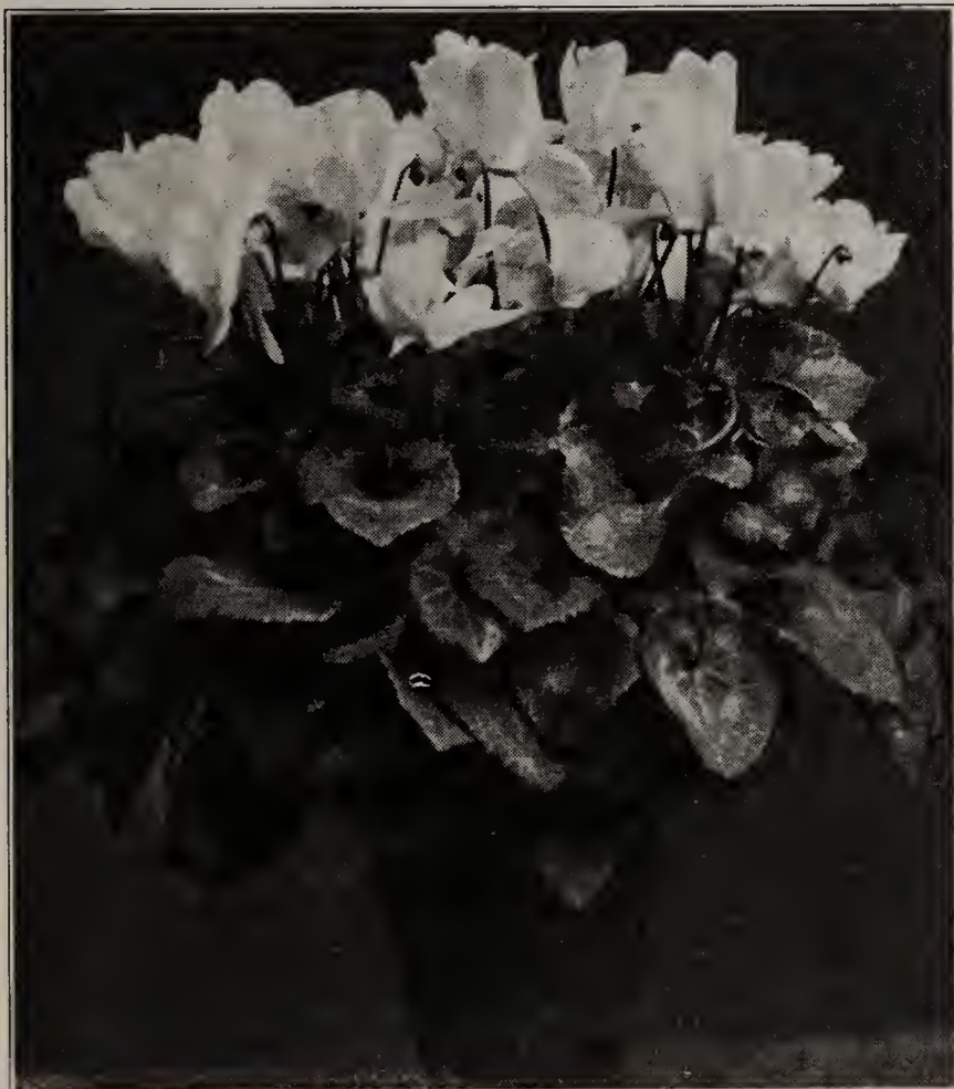
Type of Fischer's Giant Cyclamen Preferred by the Particular Grower

Mix "Sorbex". (The Finest Peat Organic) with soil in seed flats and pots. Soil for Seed Flats. A perfect mixture for the tender germinated seedlings is one part "Sorbex" to two parts screened garden loam—by volume. Prepare this mixture several days in advance of sowing seeds to allow the "Sorbex" time to absorb some moisture. If time is a factor, moisten the "Sorbex" somewhat before mixing with the soil.