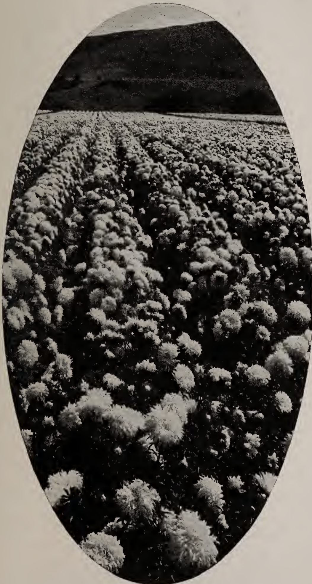
Field view of Asters in California (variety "Los Angeles"), where most of the world's supply of high grade Aster seed comes from, especially "wilt-resistant" strains.

To a Large Degree and at Only a Small Seed Cost Over the "Regular Strains" of Same