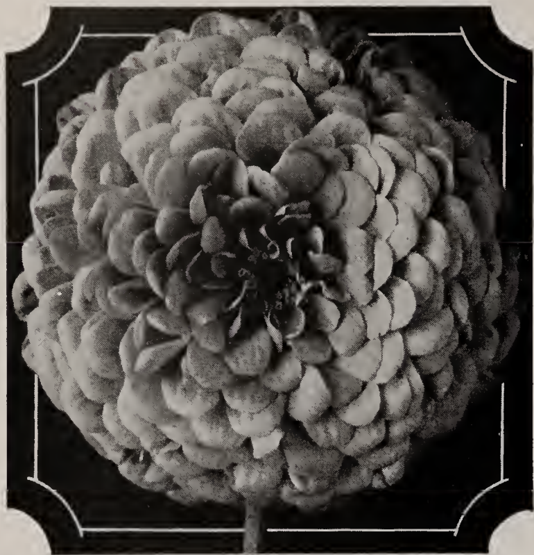
Zinnia Dahlia Flowered