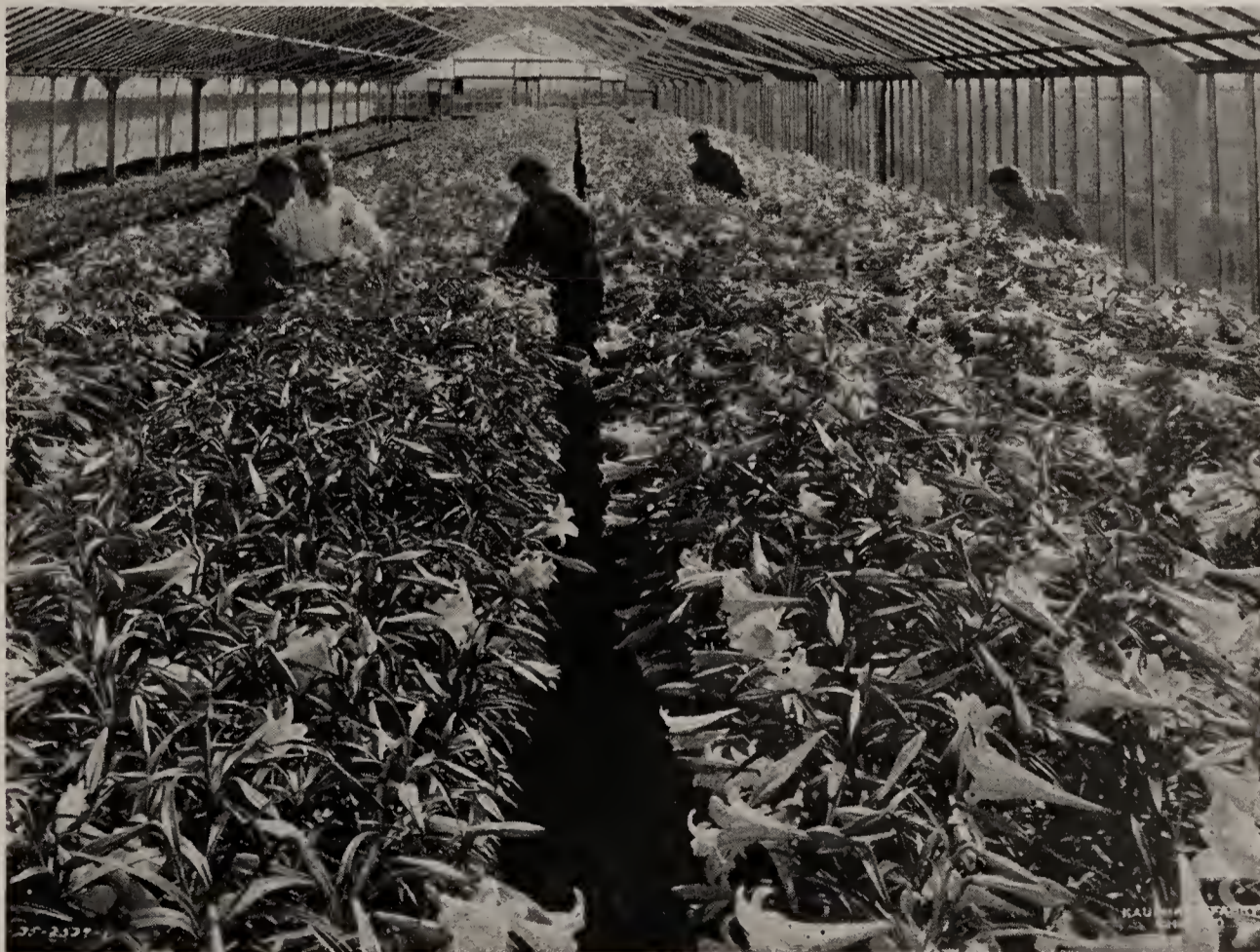
House of Lilies Produced from A. B. C. Bulbs by the Premier Rose Gardens, Maywood, Ill. Photograph taken April 13, 1935.

LILY-OF-THE-VALLEY PIPS AND CLUMPS (SEE MISCELLANEOUS BULB PAGES IN THIS BOOK)