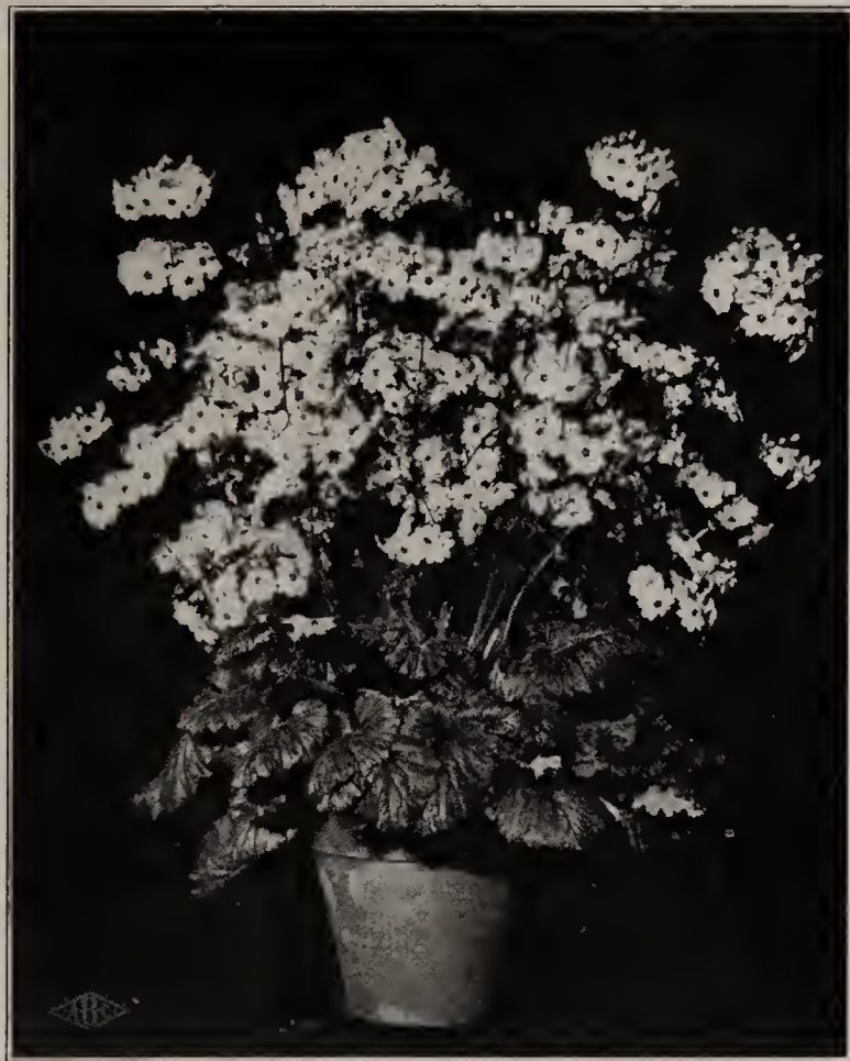
Primula Malacoides "Erikssoni"