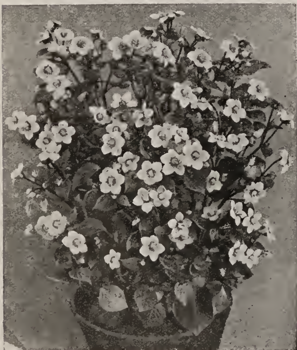
New Exacum Affine "Atrocoeruleum"