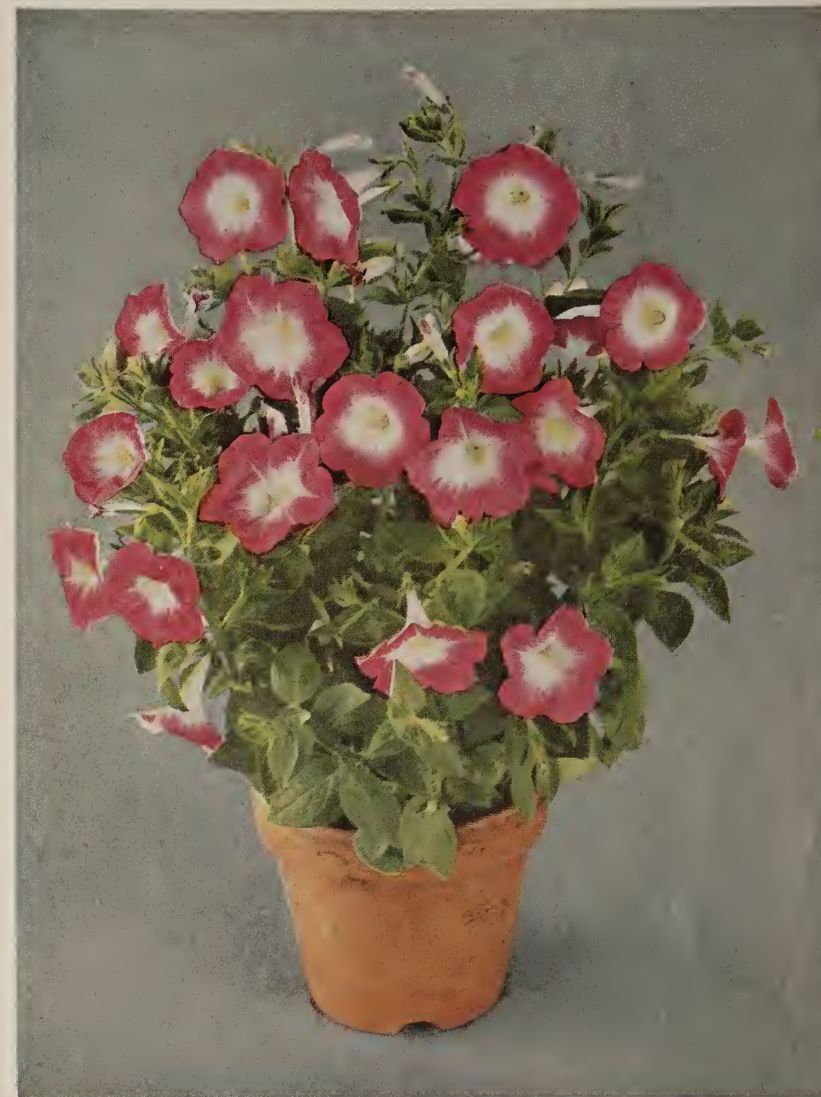
Petunia Hybrida Nana "New Rosy Morn" Improved

Tr. Pkt. ... 50c 1/16 oz. ... $1.75 1/8 oz. ... $3.00