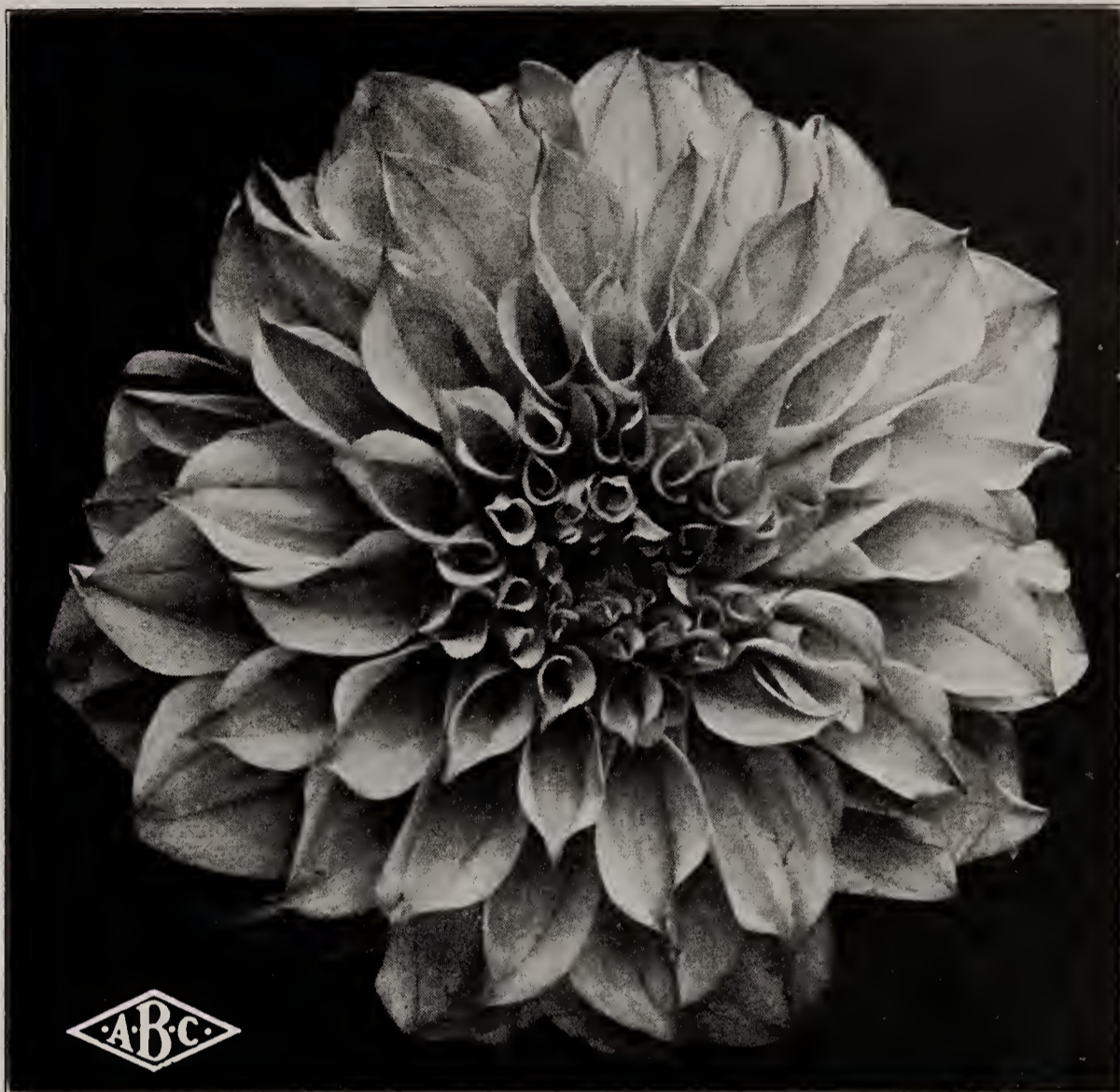
"Jersey's Beauty"—This Wonderful Rose-Pink Dahlia Still Remains at the Top of the List, Especially from a Cutflower Standpoint