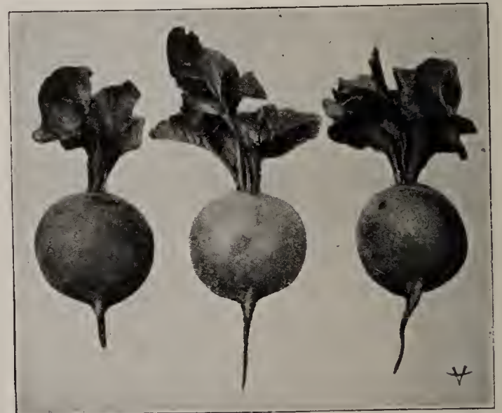
Radish, Early Scarlet Globe

NOTE! If you are in the market for vegetable seeds other than listed in these pages, please write for special prices. We supply all standard kinds at market prices.