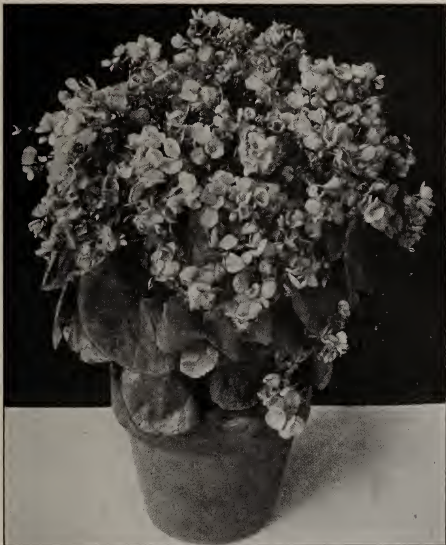
Begonias — Florists' Favorite Types