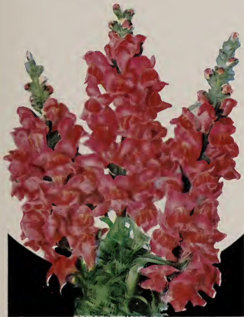
Antirrhinum Nanum Royal Rose

Tr. Pkt. . . . . 35c ¼ oz. . . . . $1.00 Oz. . . . . $3.50