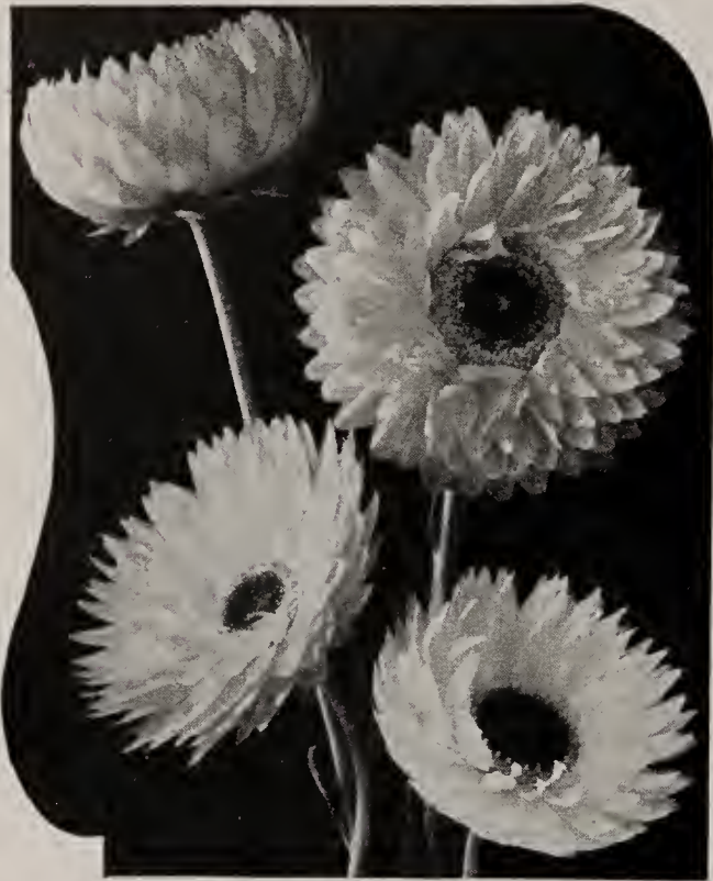
Acroclinium, New Hybrids