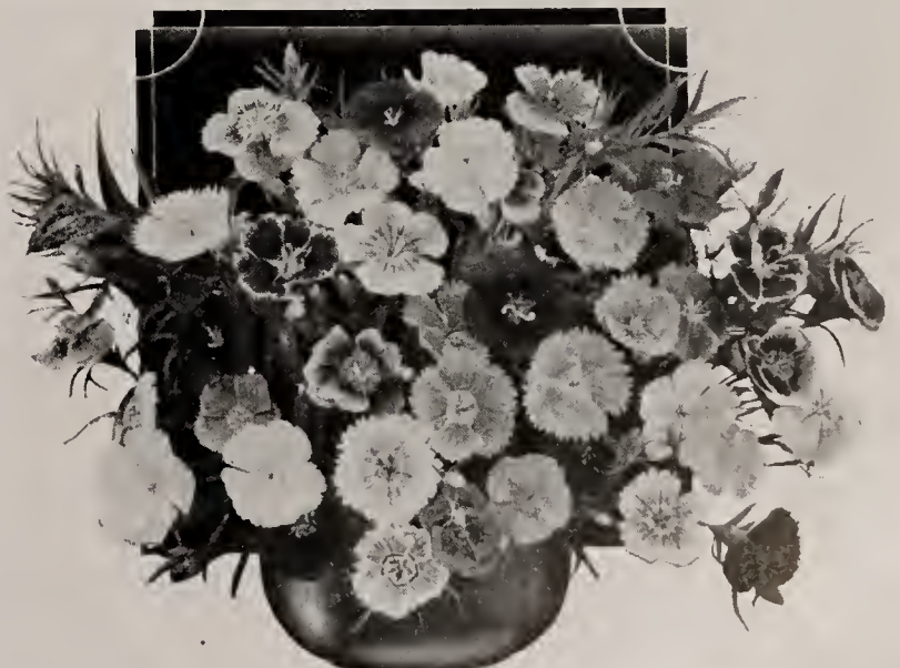
New Dianthus "Delight"

There is a bewildering range of colors from the palest pink down to the deepest purple, the predominating shades are velvety rich reds, many having the eye of a Sweet William, there is usually a definite color at the reflex of the petal like Dianthus Roysii, and the magenta shades are very subdued. Dianthus Delight is an easy growing plant which will stand many degrees of frost. Choice for cutting. Tr. Pkt.....75c