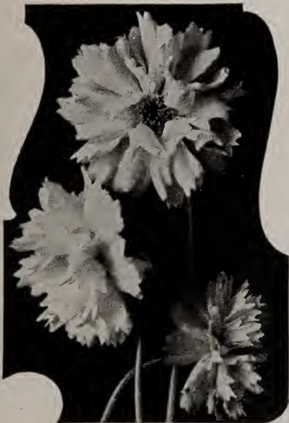
Coreopsis Grandiflora New Double Sunburst

NEW DOUBLE HARDY DAISY "WHITE SWAN" IS HIGHLY RECOMMENDED (SEE PAGE 61)