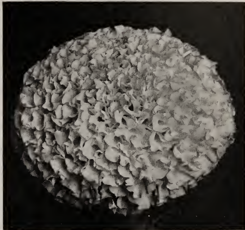
Marigold, Tall African "All Double"

Tr. Pkt. . . . . 25c 1/4 oz. . . . . 50c Oz. . . . . $1.50