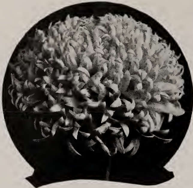
Marigold "Dixie Sunshine"

See previous page for description and price