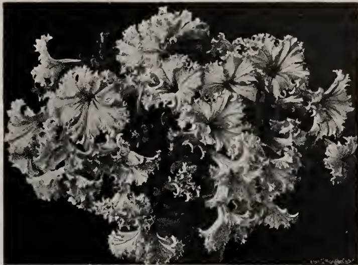
Petunia "Lace Veil"

PORTLAND PETUNIAS—SINGLE, LARGE FLOWERED (Fringed and Ruffled) Originator Strains, Seed from Hand Pollinated Plants. Free flowering strong upright growths. Now very popular with the trade. Especially "Elk's Pride," which is the most outstanding of all purple varieties. Apple Blossom. Light pink. Ruffled Heliotrope. Soft heliotrope. Elk's Pride. Royal purple. Scarlet Beauty. Bright scarlet. Lilac Beauty. Soft lilac. White Beauty. Pride of Portland. Deep rose. Mixed Colors. Price, each of above: Tr. Pkt. . . . $1.00 3 Tr. Pkts. . . . $2.50 6 Tr. Pkts. . . . $4.50