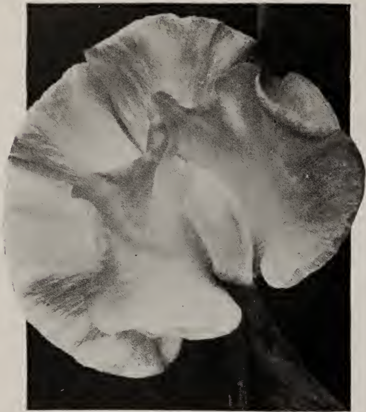
Early Sweet Pea "Hope" The "Last Word" in White Sweet Peas