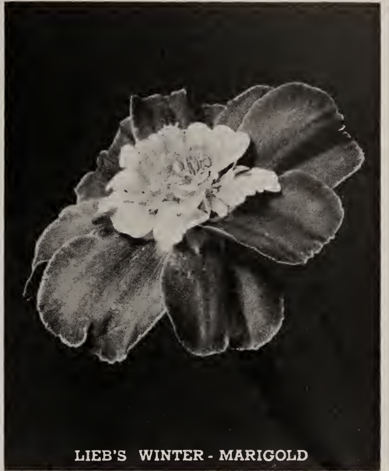
LIEB'S WINTER - MARIGOLD