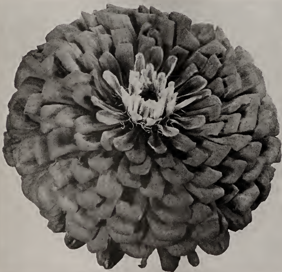
Zinnia California Giant or Mammoth

Price: Each of above—Tr. Pkt.....10c Oz.....50c ¼ lb.....$1.50 Salmon Rose. A pleasing shade largely used by florists in basket work. Tr. Pkt.....15c Oz.....60c ¼ lb.....$2.25 Choicest Mixed. Tr. Pkt.....10c Oz.....35c ¼ lb.....$1.00