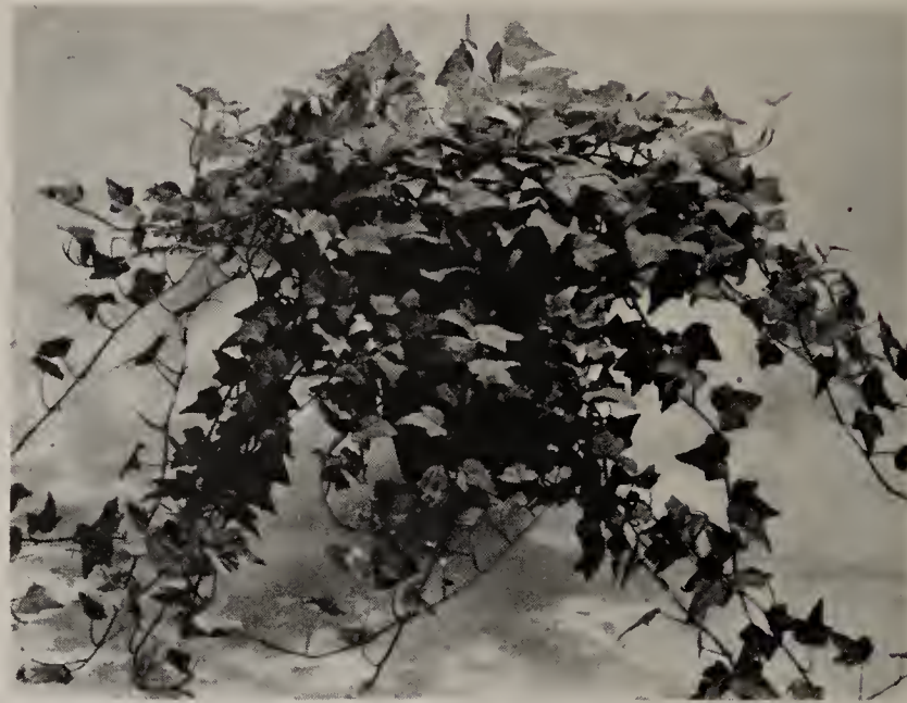
Hahn New Branching Ivy

SPECIAL NOTE: WE ADVERTISE SEASONABLE PLANT ITEMS IN CLASSIFIED PAGES OF THE FLORIST'S REVIEW FROM TIME TO TIME DURING THE YEAR AND BELIEVE YOU WILL FIND IT WORTH WHILE TO OBSERVE THE SAME.—A. B. C.