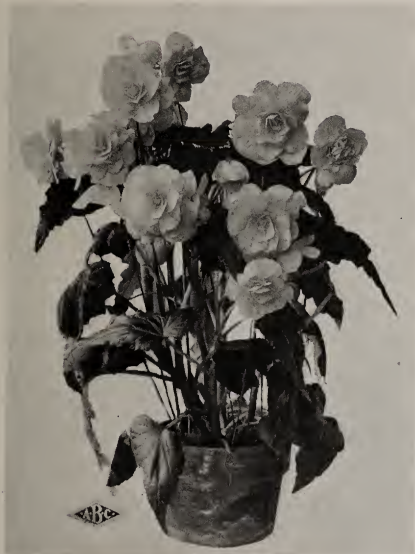
Double-Flowering Tuberous Begonia

Florists on the West Coast recently found a profitable outlet for Double Tuberous Begonia blooms by utilizing them for corsages and table decoration (the stems being wired). This new fashion is now sweeping the country, the flowers commanding a price on a par with that of Orchids and Gardenias.