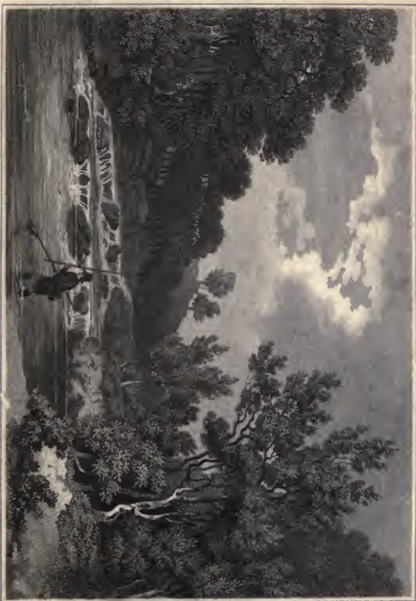
FLY FISHING FOR TROUT.