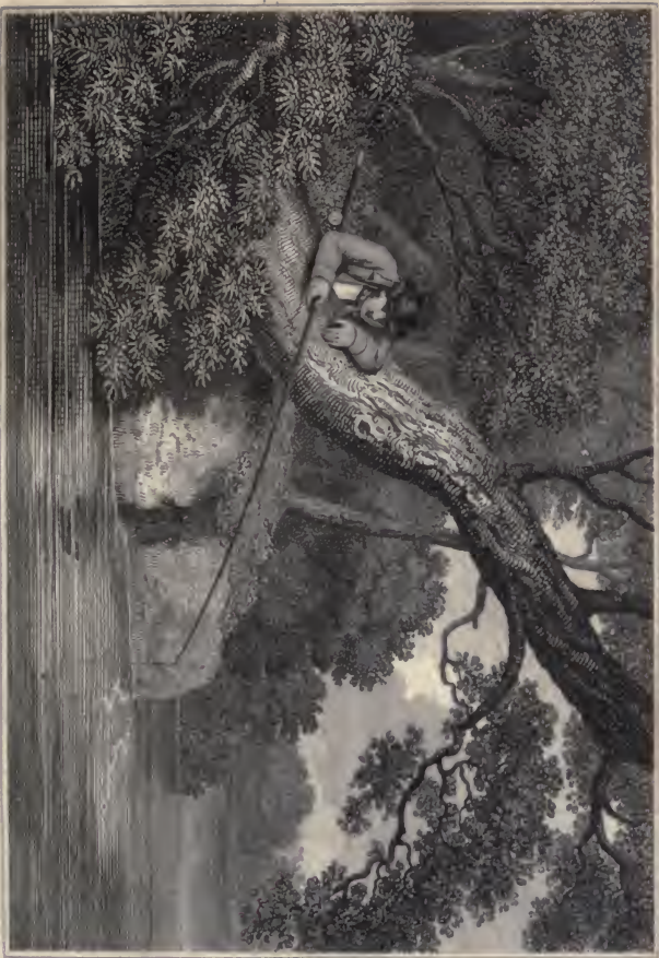
DAPING FOR TROUT.