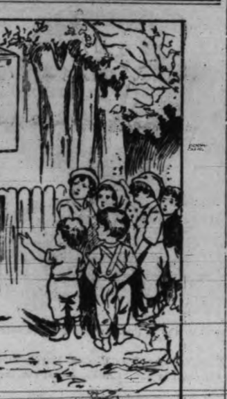
PICTURE PUZZLE. Find a cat, dog, rabbit and a duck.

He pledged himself to faithfully look after the interests of his ward and city if returned.