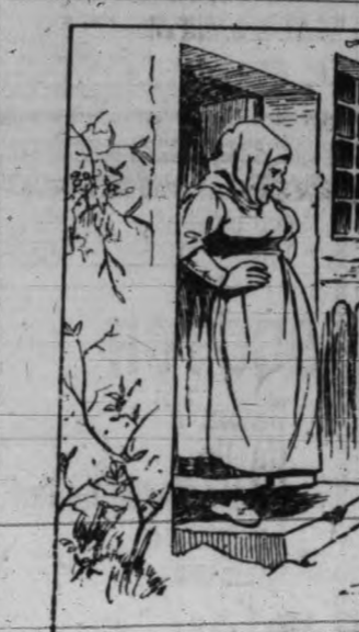
PICTURE PUZZLE. Find a cat, dog, rabbit and a duck.

Be sure and have it well boiled to bring out the flavor and food value.