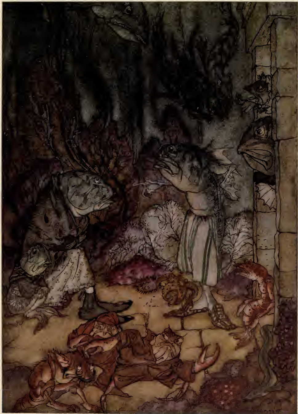
A scaly set of rascals