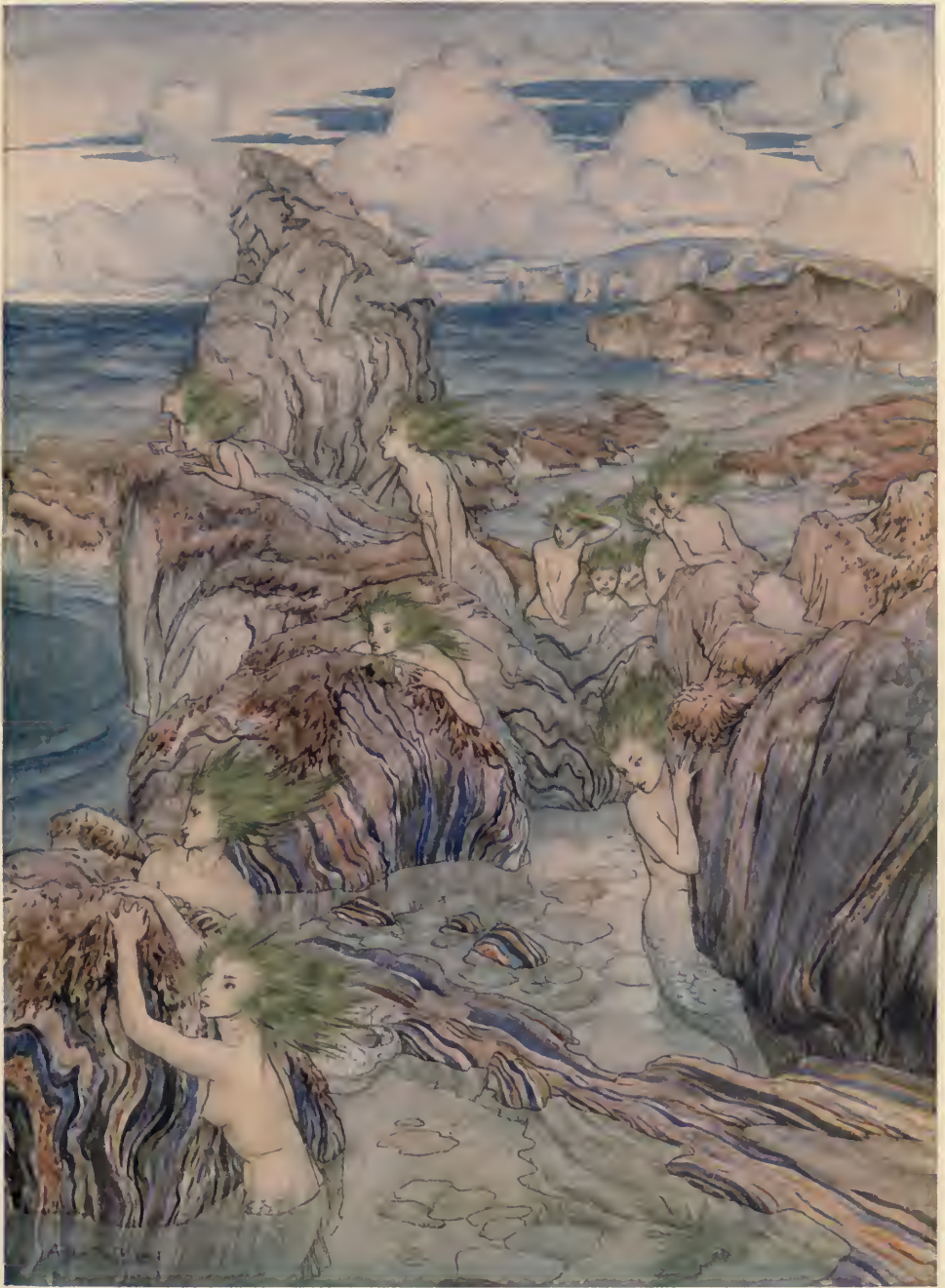
They have sea-green hair