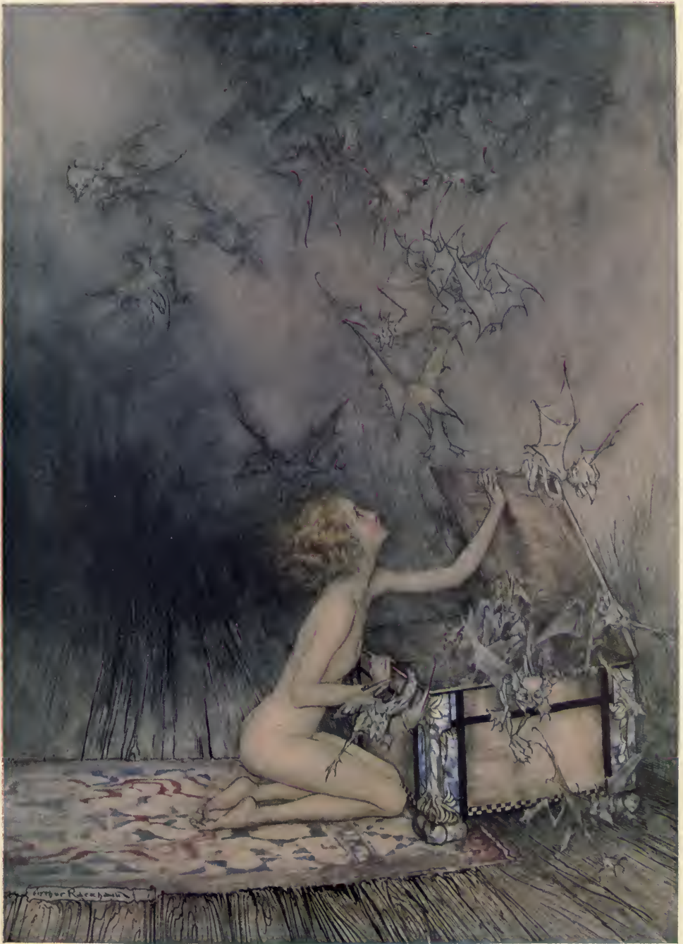
A sudden swarm of winged creatures brushed past her