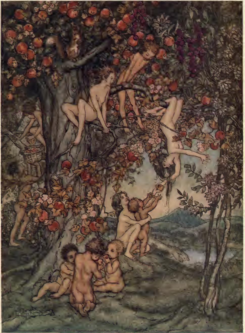
There was no danger, nor trouble of any kind