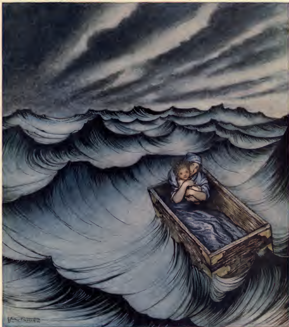
Danaë clasped her child closely