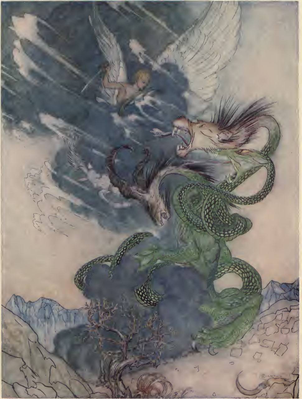
Its three heads spluttering fire